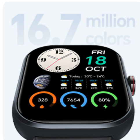
Image: The watch display showcasing its ability to render 16.7 million colors, providing rich visual detail.