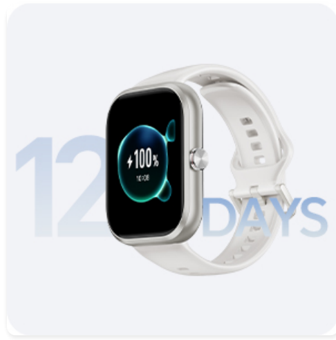
Image: The watch display indicating a full charge and highlighting its 12-day battery life capability.