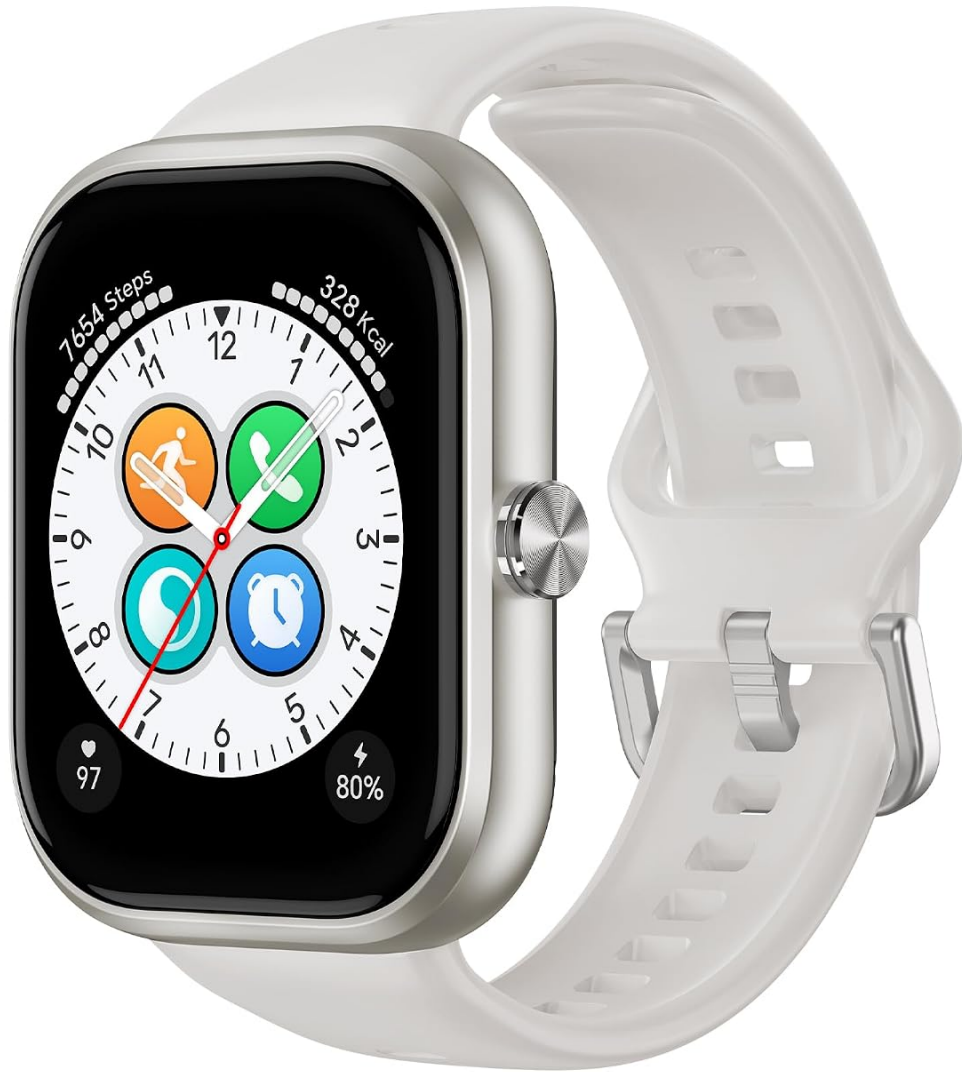
Image: The HONOR CHOICE Watch in white, showcasing its sleek design and vibrant display.