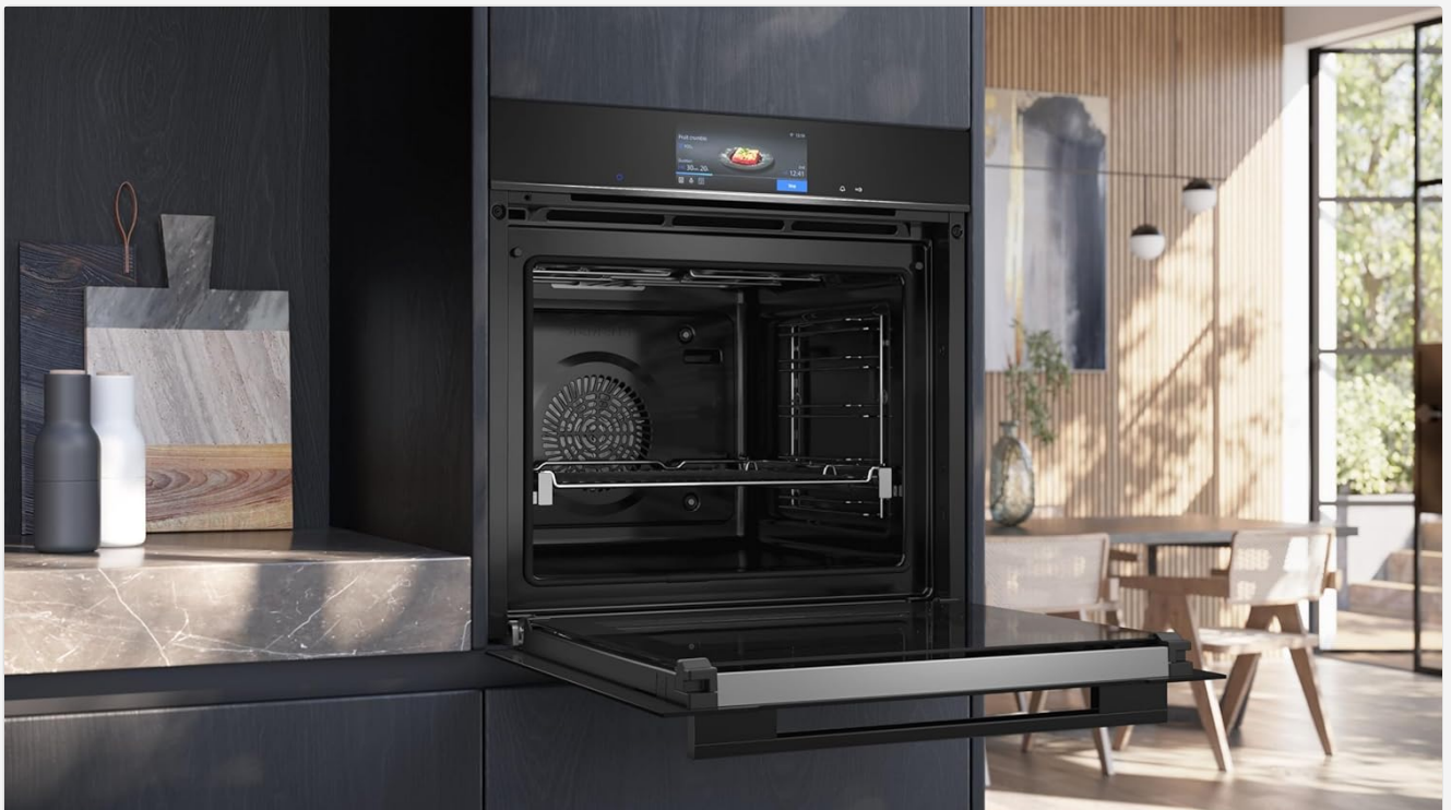
Figure 5: The Siemens iQ700 oven seamlessly integrated into a modern kitchen setting with its door open, showing the interior.