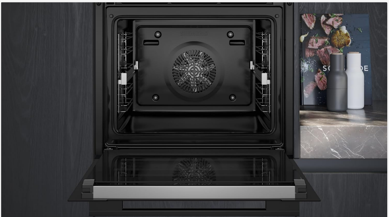
Figure 3: Interior view of the oven cavity, highlighting the fan for 4D HotAir distribution and multiple rack positions.