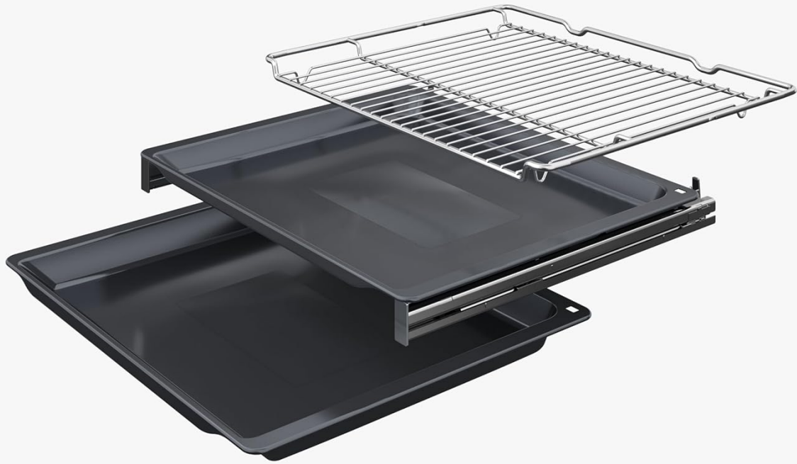
Figure 4: Included oven accessories, featuring baking trays and a wire rack for various cooking needs.