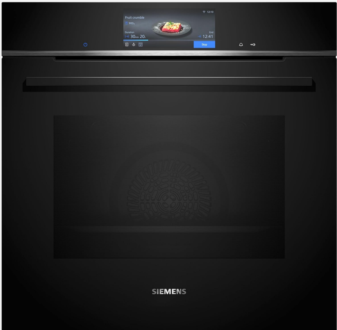
Figure 1: Front view of the Siemens iQ700 electric oven, showcasing its sleek black design and digital display.