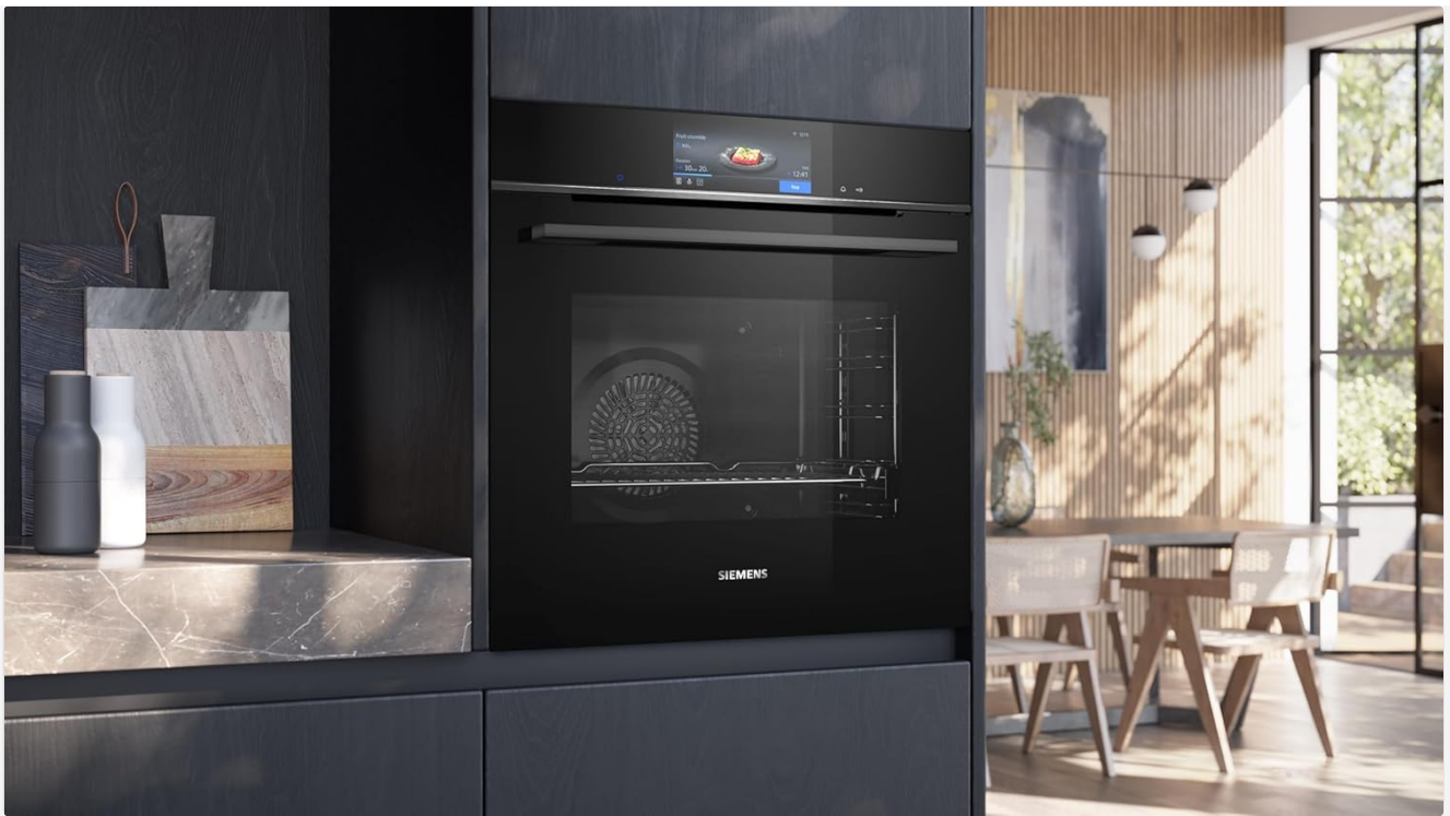
Figure 6: The Siemens iQ700 oven installed in a modern kitchen with its door closed, demonstrating its sleek built-in appearance.