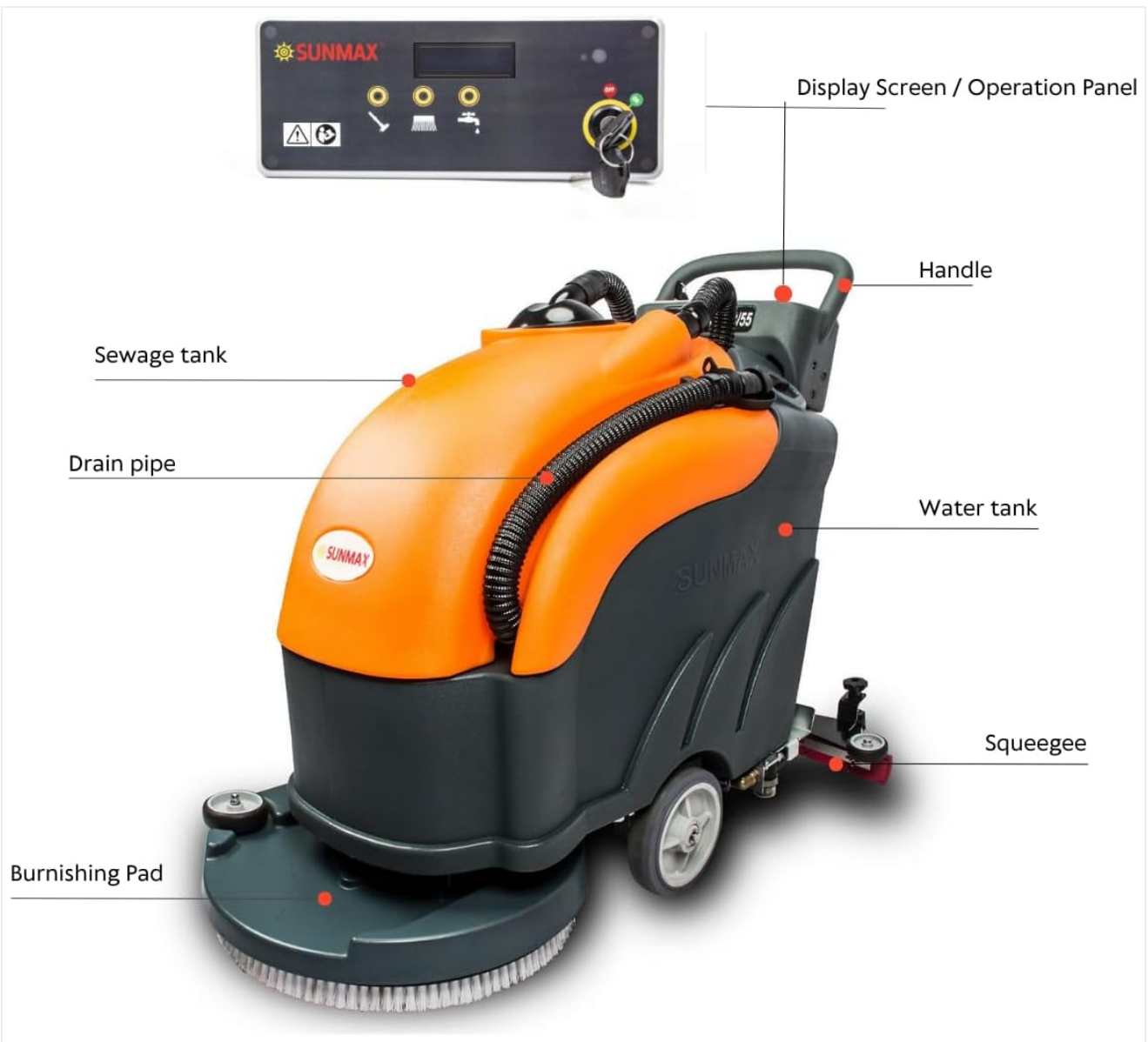
Figure 2: Overview of the SUNMAX RT50S, highlighting the handle, display screen/operation panel, sewage tank, water tank, drain pipe, squeegee, and burnishing pad.