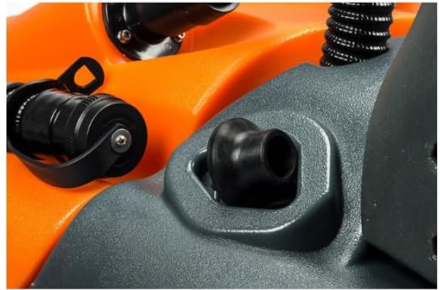
Figure 5: The solution tank, showing the inlet for water and cleaning solution. A measuring cup is used to ensure correct detergent concentration.