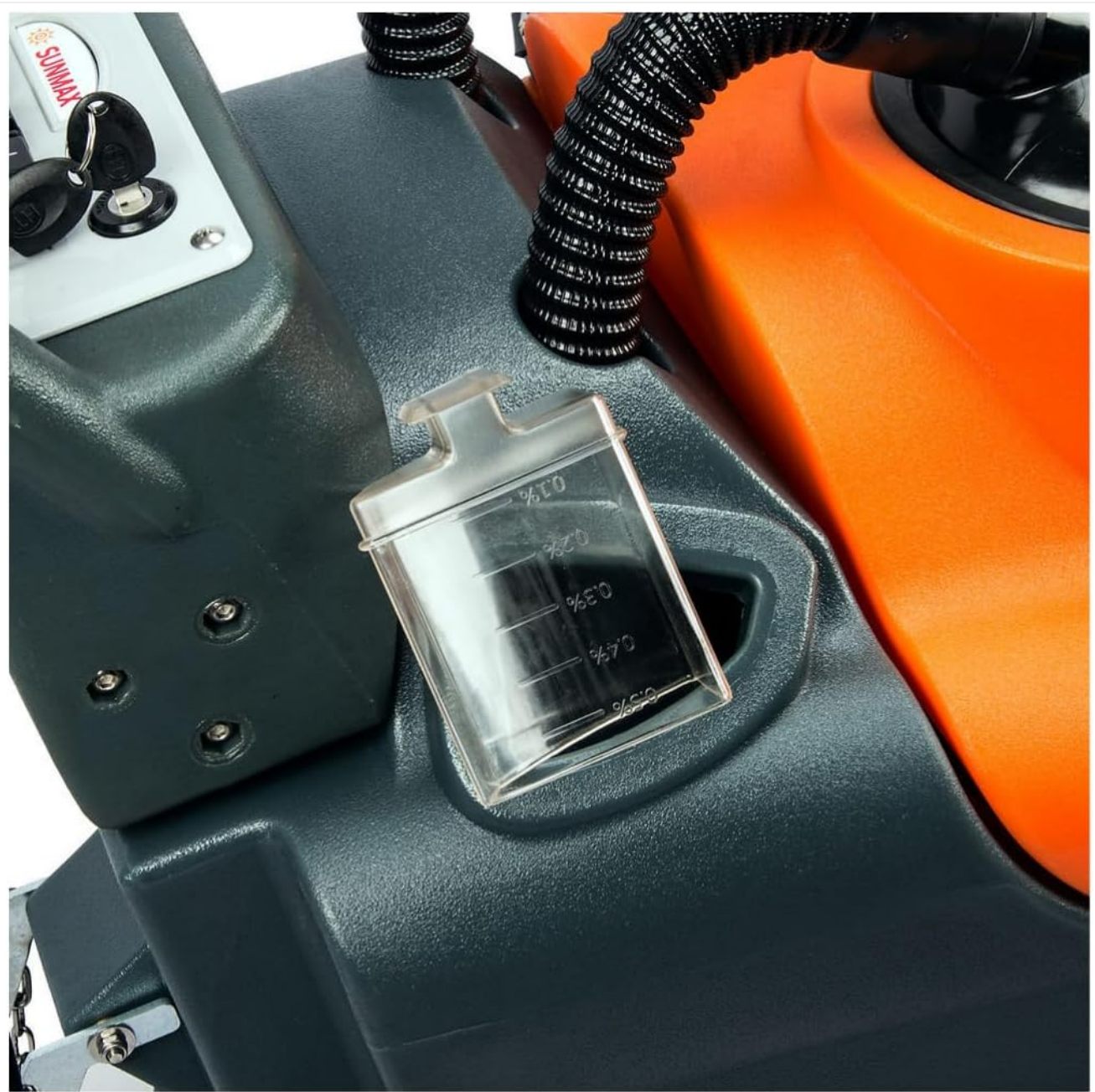
Figure 6: The RT50S is suitable for cleaning various hard floor types, including concrete, tile, linoleum, marble, epoxy, PVC, emery, and terrazzo floors.

Push the machine forward at a steady pace. The machine will automatically dispense cleaning solution, scrub the floor, and vacuum up the dirty water, leaving the floor dry. The 22-inch scrub path and 31.5-inch squeegee ensure efficient cleaning.