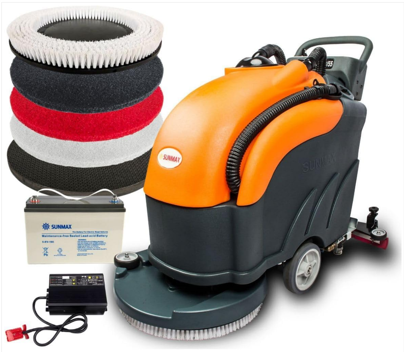
Figure 1: The SUNMAX RT50S Walk-behind Floor Scrubber Dryer with its included heavy-duty brush, red, black, and white pads, and charger.