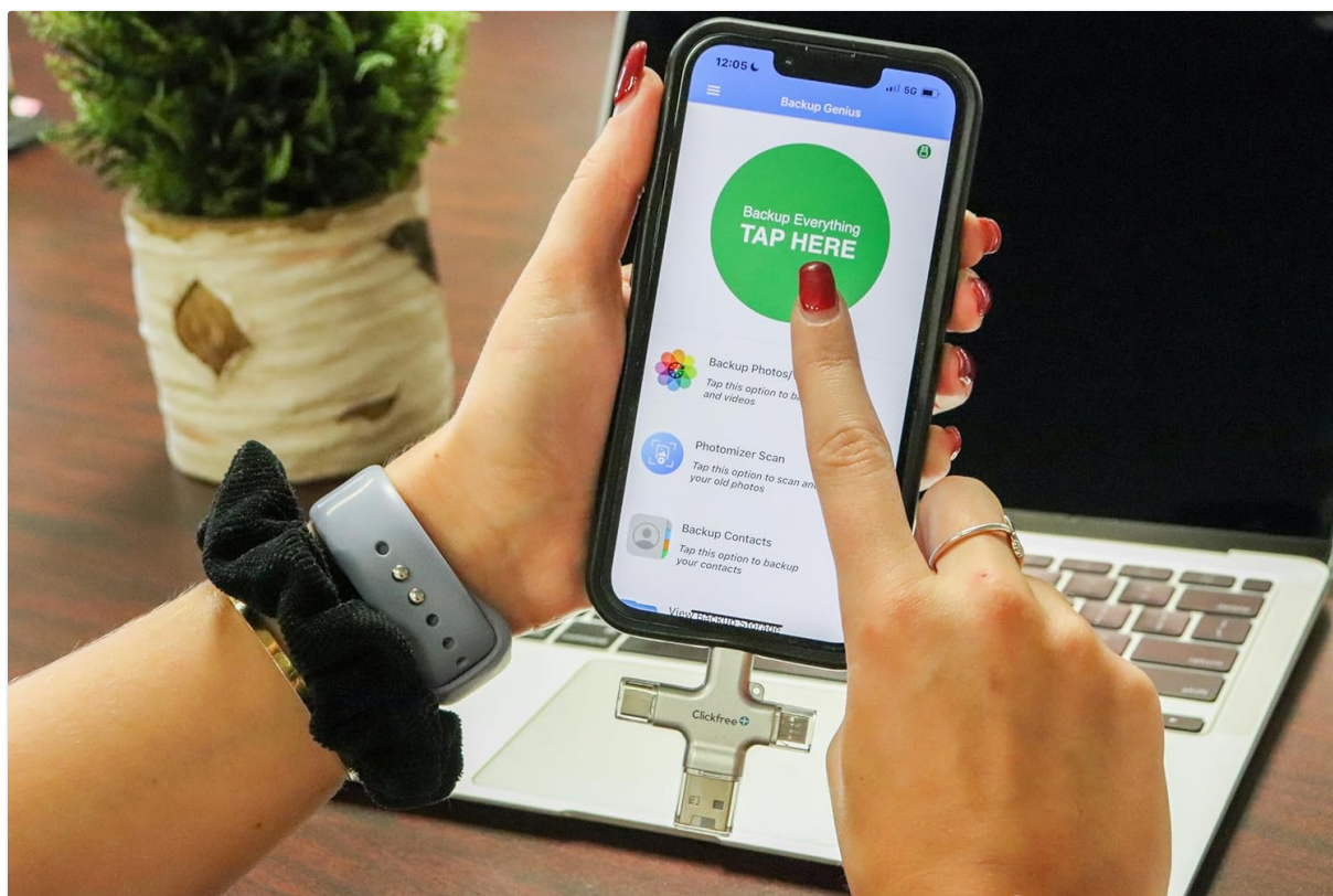
Figure 3.1: The Clickfree application interface, showing the "Backup Everything TAP HERE" option.