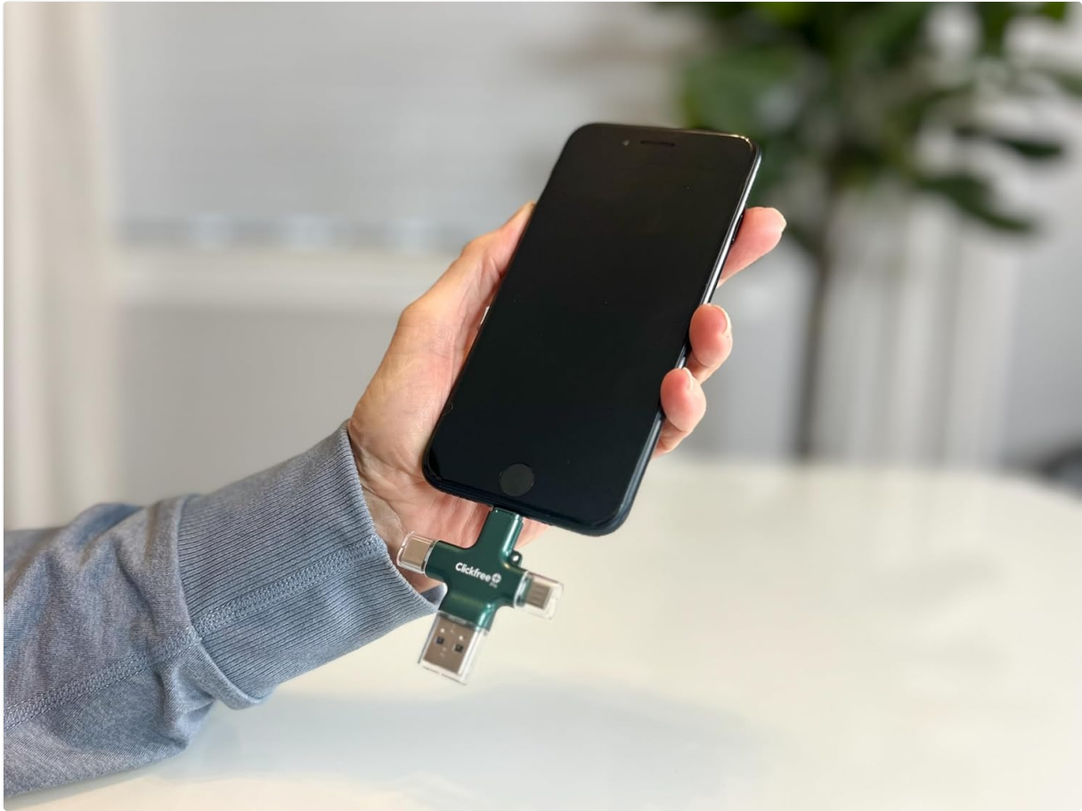
Figure 3.2: The Clickfree PRO connected to the charging port of a smartphone.

Gently insert the appropriate connector of the Clickfree PRO into your device's port. Ensure a secure connection. The application should automatically detect the device once connected.