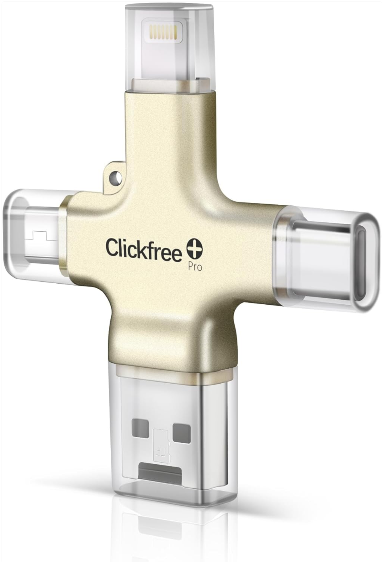
Figure 2.1: The Clickfree PRO device, showcasing its multi-port design in metallic gold.