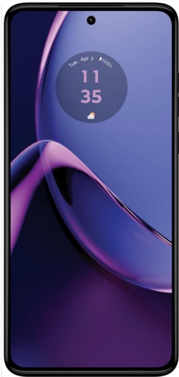
Figure 3.1: Front view of the Motorola Moto G84 5G, showcasing its large P-OLED display with a punch-hole camera.

The Moto G84 5G features a 6.5-inch P-OLED display with a 120Hz refresh rate, providing vibrant colors and smooth scrolling. Navigate the interface using touch gestures: swipe up for the app drawer, swipe down for quick settings and notifications, and use the navigation bar or gestures for home, back, and recent apps.