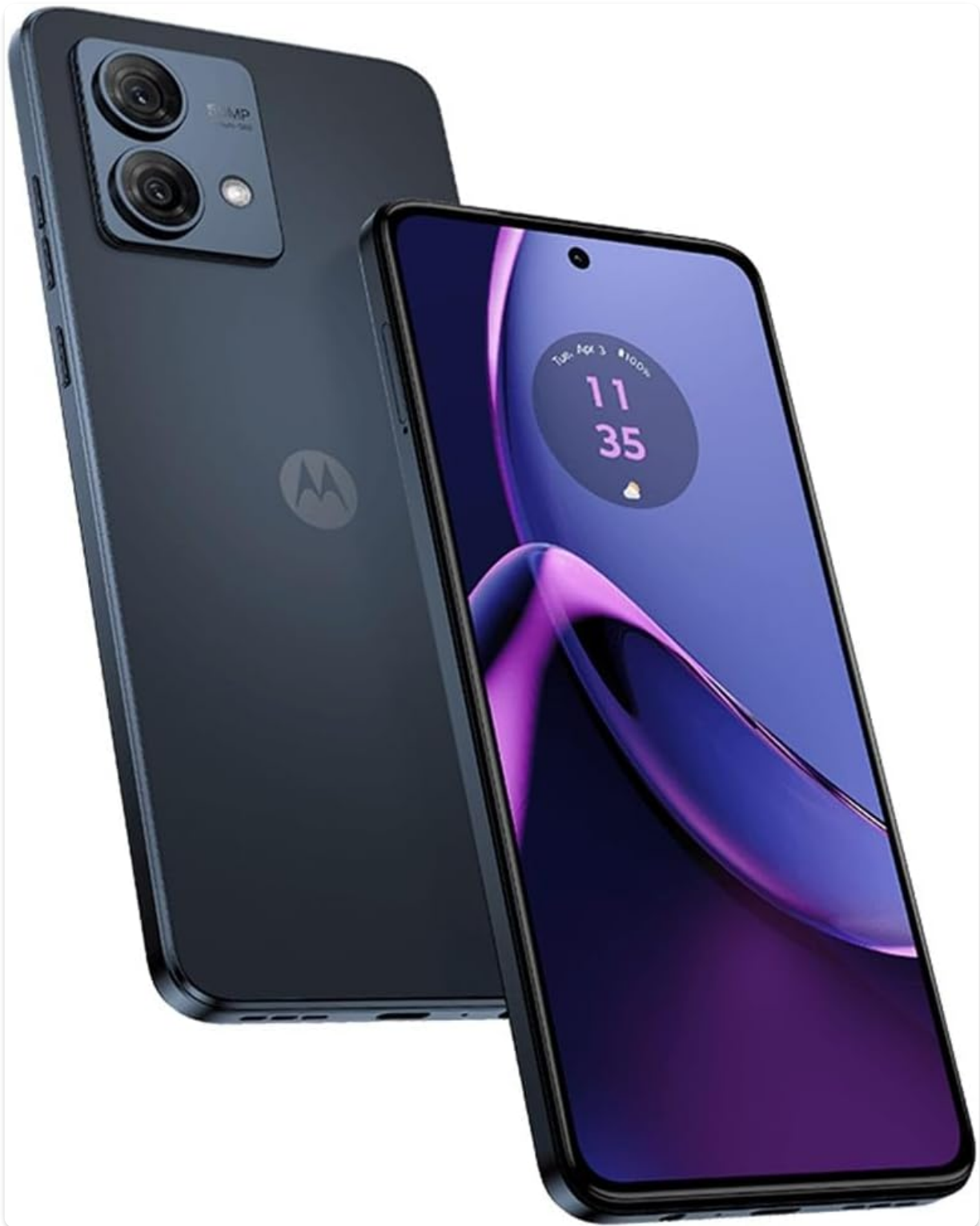
Figure 1.1: Motorola Moto G84 5G smartphone, showcasing its sleek design and camera module.