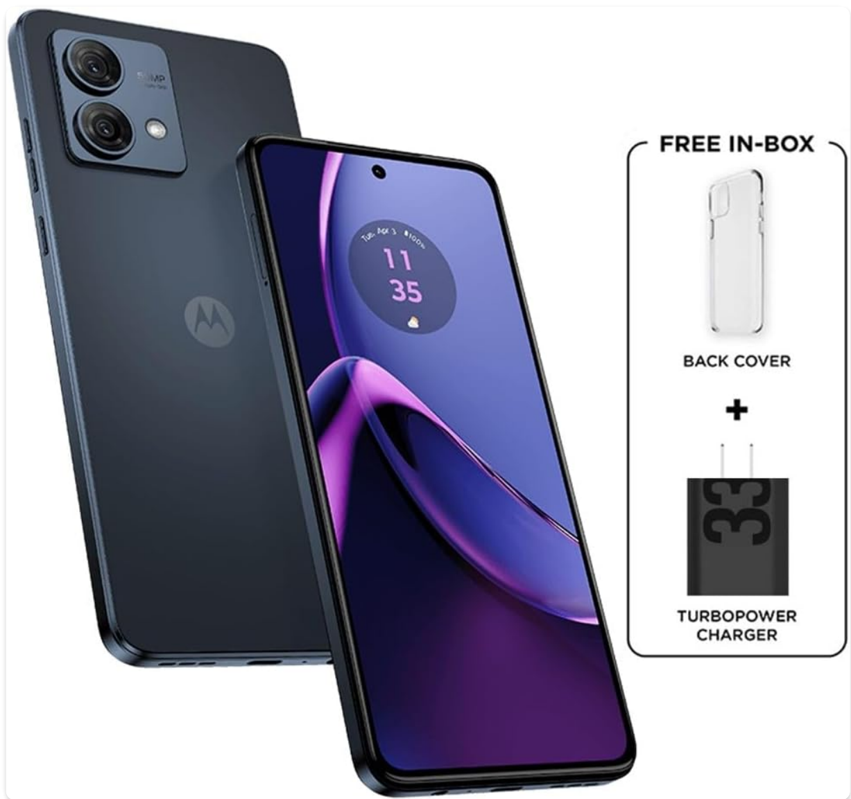
Figure 2.1: The Motorola Moto G84 5G alongside its in-box accessories, including a protective back cover and a TurboPower charger.