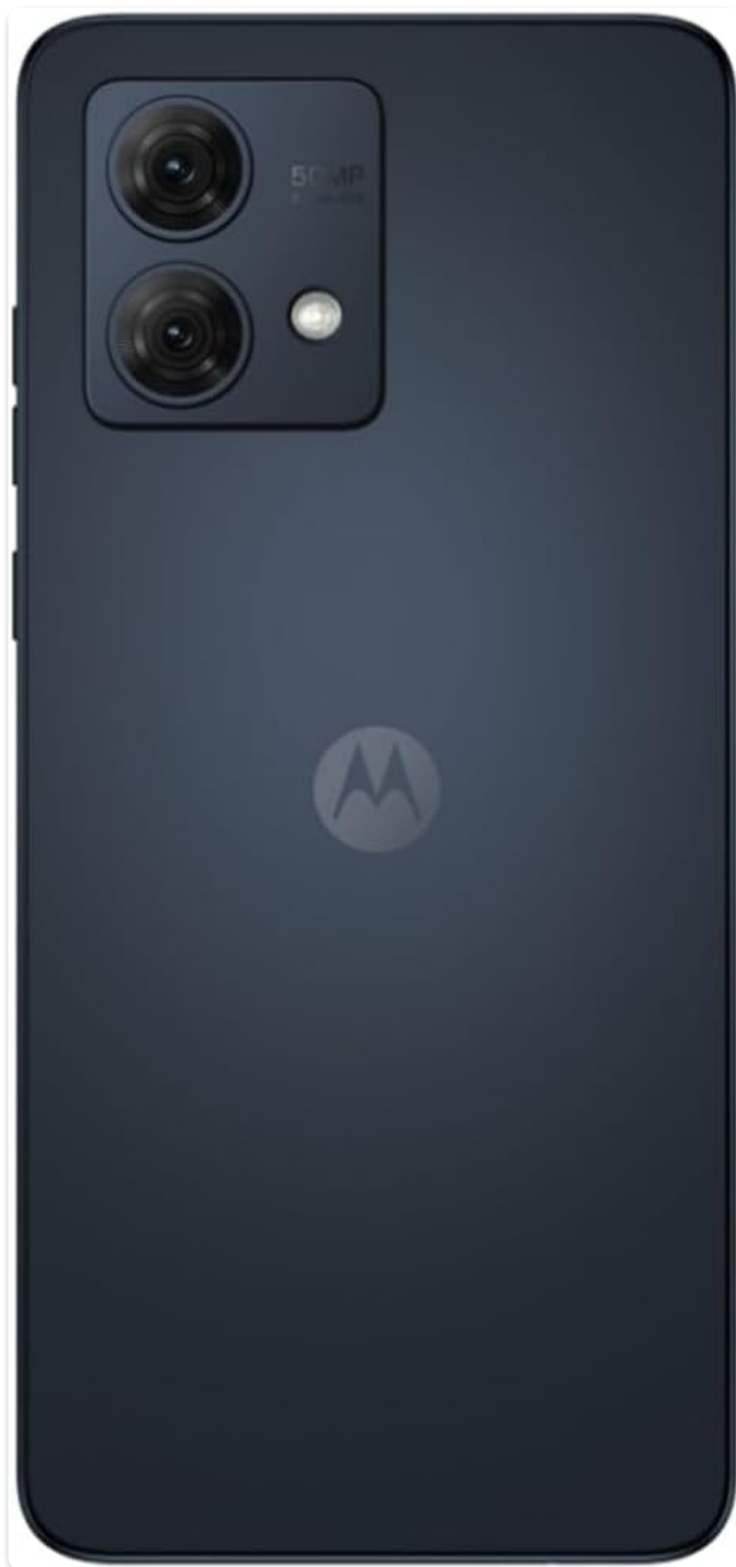
Figure 2.2: Rear view of the Motorola Moto G84 5G, highlighting the camera module and Motorola logo.