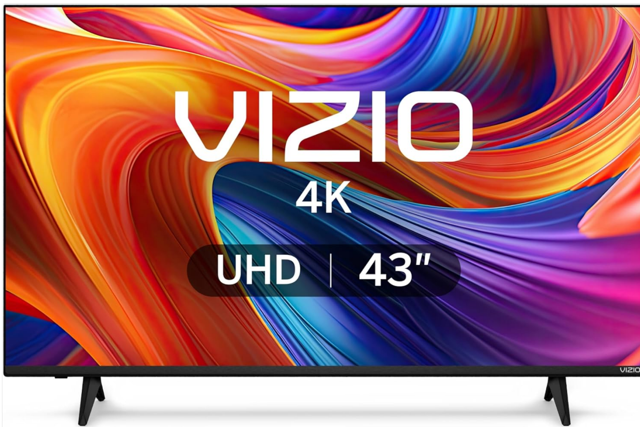
Front view of the VIZIO 43-inch 4K UHD LED Smart TV, showcasing its slim bezel and display.

This manual provides essential information for setting up, operating, and maintaining your VIZIO 43-inch 4K UHD LED Smart TV. Please read these instructions thoroughly before using your television to ensure proper function and safety.