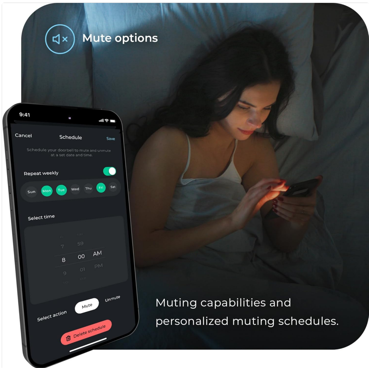
Figure 4.4: Setting mute schedules within the Globe Suite™ app.