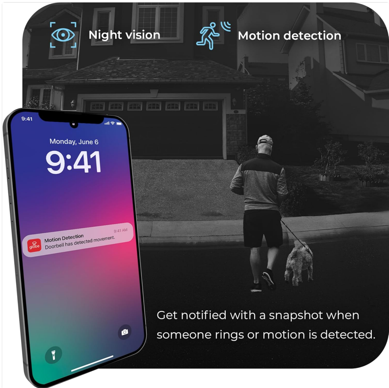
Figure 4.3: Motion detection notifications and night vision capabilities.