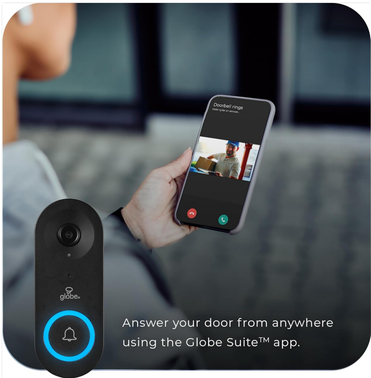
Figure 4.1: Answering your door remotely using the Globe Suite™ app.