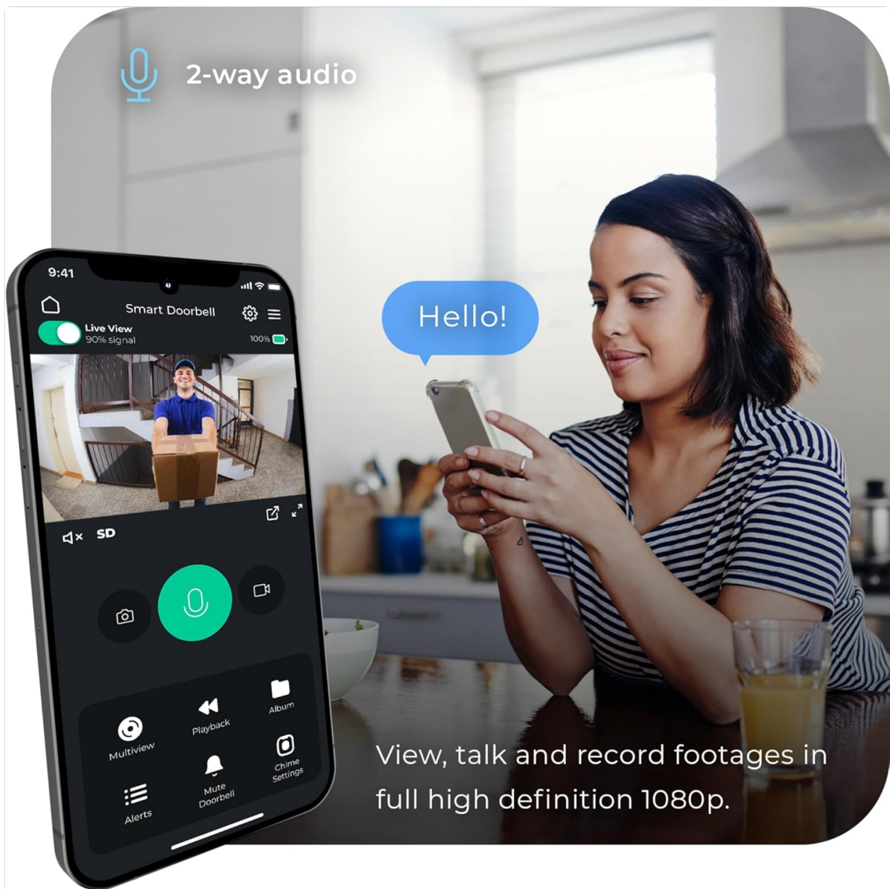
Figure 4.2: Live view, 2-way audio, and recording features within the app.