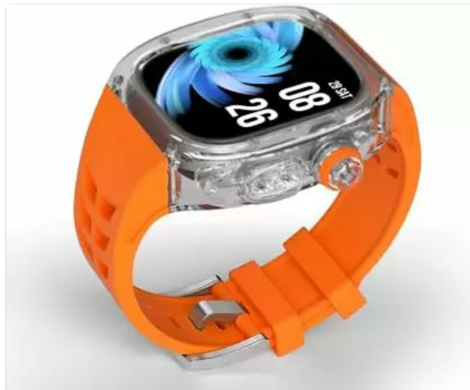
Figure 1: Front view of the Kalobee H9 Smart Watch featuring a large display and an orange silicone strap with a clear polycarbonate case.