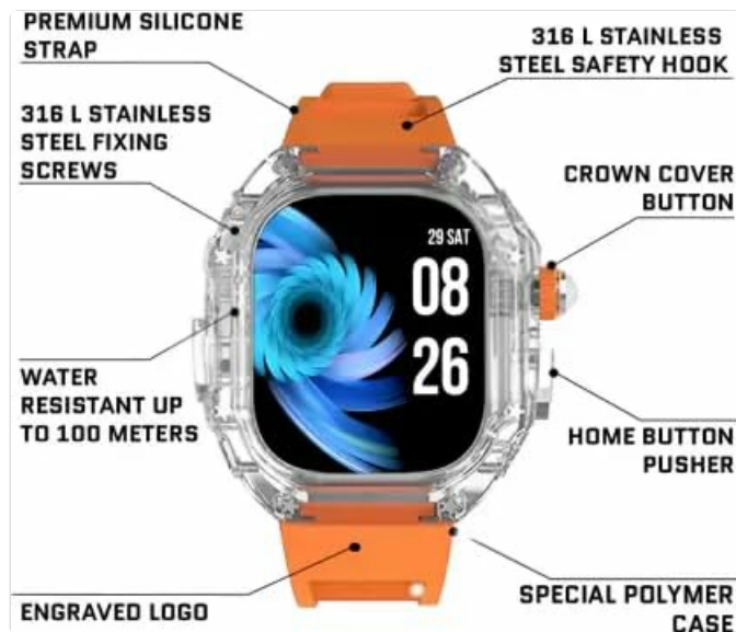
Figure 2: Detailed diagram of the Kalobee H9 Smart Watch highlighting key components such as the premium silicone strap, 316L stainless steel fixing screws, water resistance up to 100 meters, engraved logo, special polymer case, home button pusher, crown cover button, and 316L stainless steel safety hook.