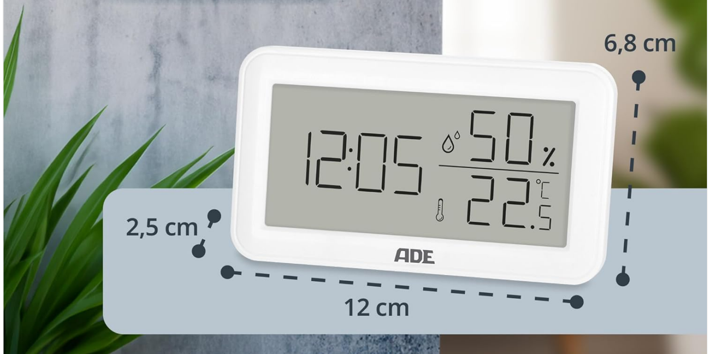
Image: The ADE WS2322 device, illustrating its compact dimensions. The image clearly labels the length (12 cm), height (6.8 cm), and depth (2.5 cm), emphasizing its suitability for various spaces due to its small footprint and clear, large-digit display.