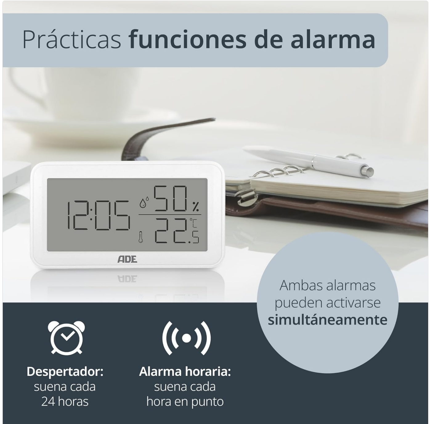
Image: The ADE WS2322 display, illustrating its practical alarm functions. It shows icons for both a daily alarm clock and an hourly chime, emphasizing that these two features can be activated concurrently to suit user preferences.