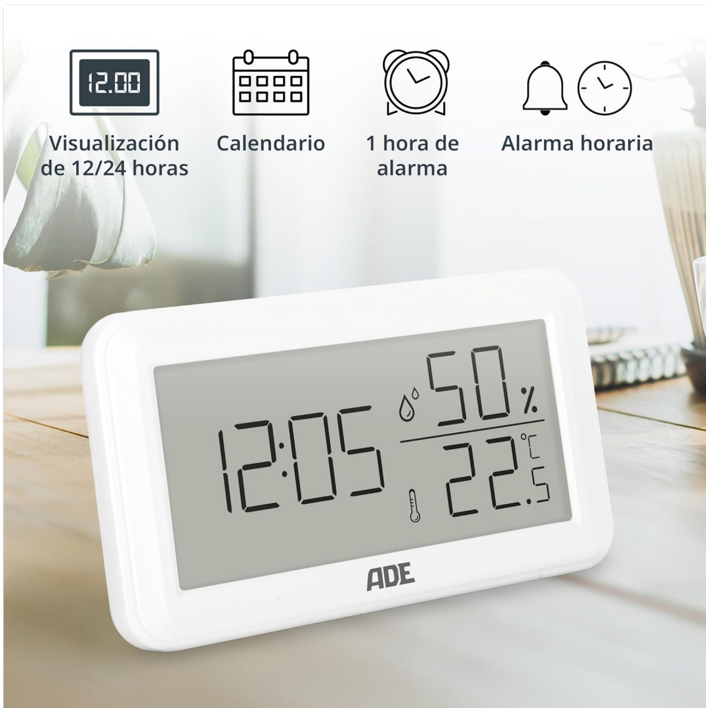
Image: The ADE WS2322 display, showcasing its various time-related functions. This includes the ability to switch between 12 and 24-hour time formats, a calendar display, a 1-hour alarm, and an hourly chime function. The image emphasizes the device's versatility beyond just temperature and humidity monitoring.