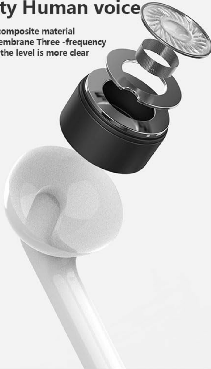
Image: Exploded view illustrating the 15mm composite material vibration film driver for enhanced audio quality.

Use 15mm composite material vibration membrane Three -frequency equilibrium the level is more clear