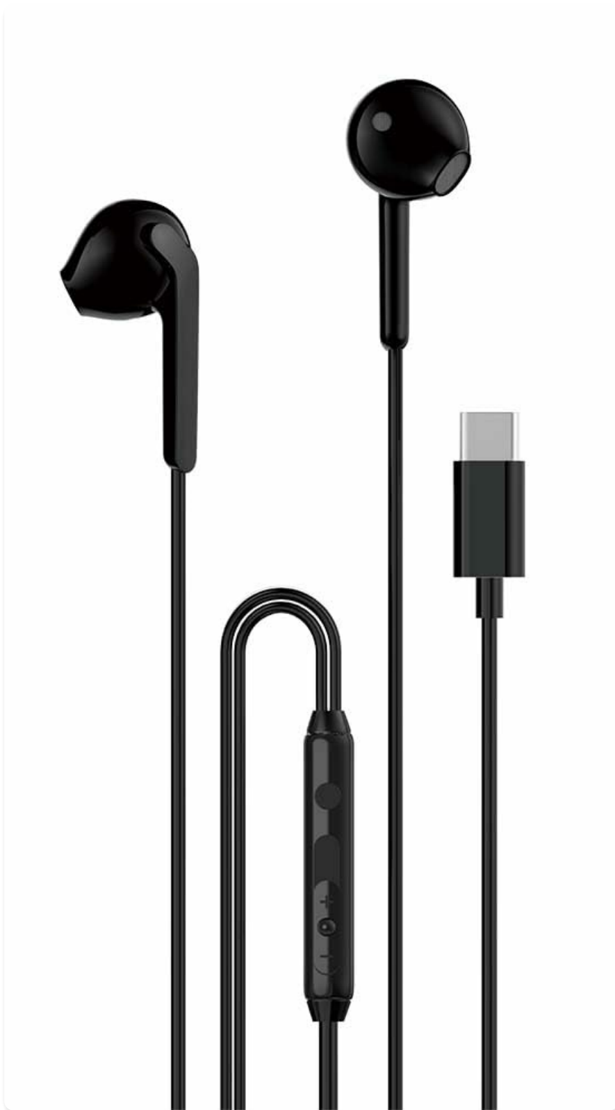
Image: DUDAO X3C Type-C Wired Earphones, black color.