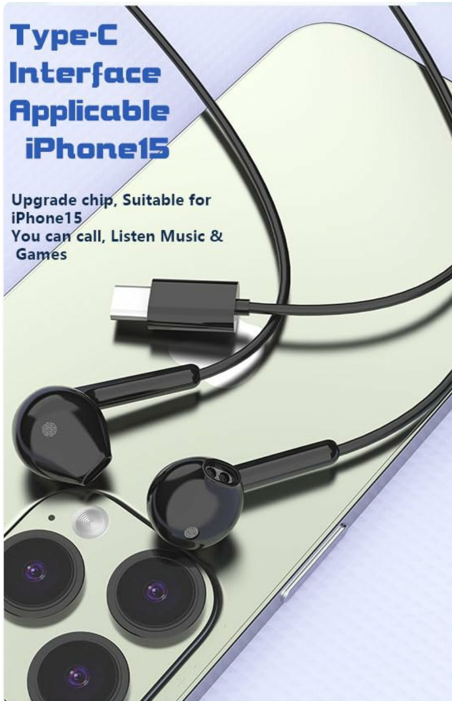
Image: DUDAO X3C Type-C Earphones with a Type-C interface, shown connected to an iPhone 15.