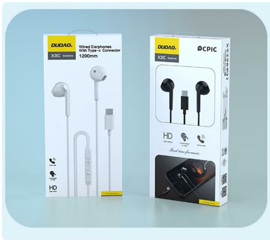
Image: Packaging for DUDAO X3C Type-C Wired Earphones.