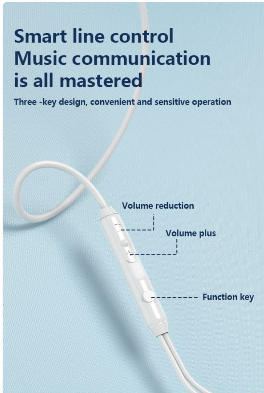
Image: Close-up of the in-line remote control, indicating the volume up, volume down, and function keys.