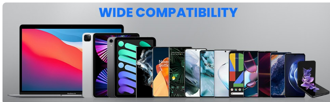
Image: A range of devices including laptops, tablets, and smartphones, illustrating the wide compatibility of the Type-C earphones.