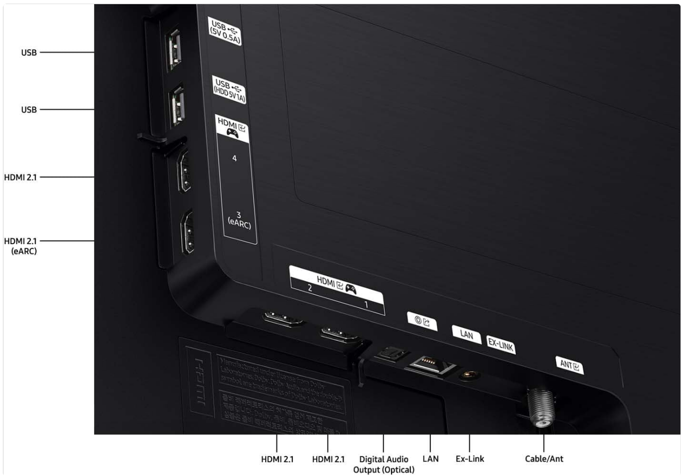
Figure 2: Rear Connectivity Ports. This image highlights the various input and output ports available on the back of the TV, including multiple HDMI 2.1 ports (one with eARC support), USB ports, Digital Audio Output (Optical), LAN, and Cable/Antenna input.