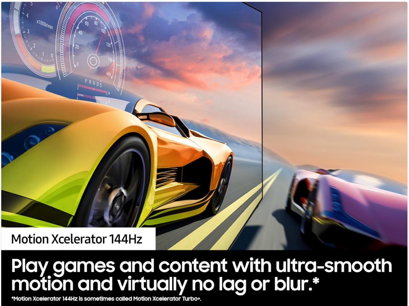
Figure 5: Smooth Motion with Motion Xcelerator 144Hz. This image demonstrates the TV's ability to render fast-moving scenes with exceptional clarity and fluidity, ideal for gaming and action content.