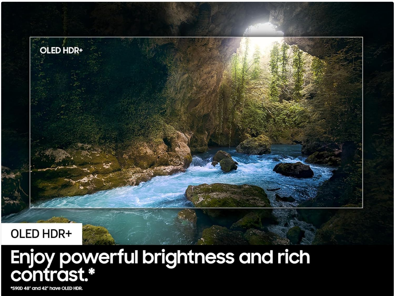
Figure 4: Enhanced Brightness and Contrast with OLED HDR+. This image highlights the vivid colors and dynamic range provided by OLED HDR+, making scenes appear more lifelike and impactful.