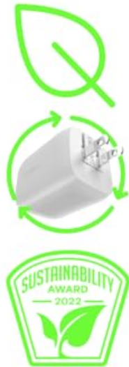
Figure 9: Details on Belkin's Connected Equipment Coverage and warranty.

Meeting regulatory standards in 22+ Countries