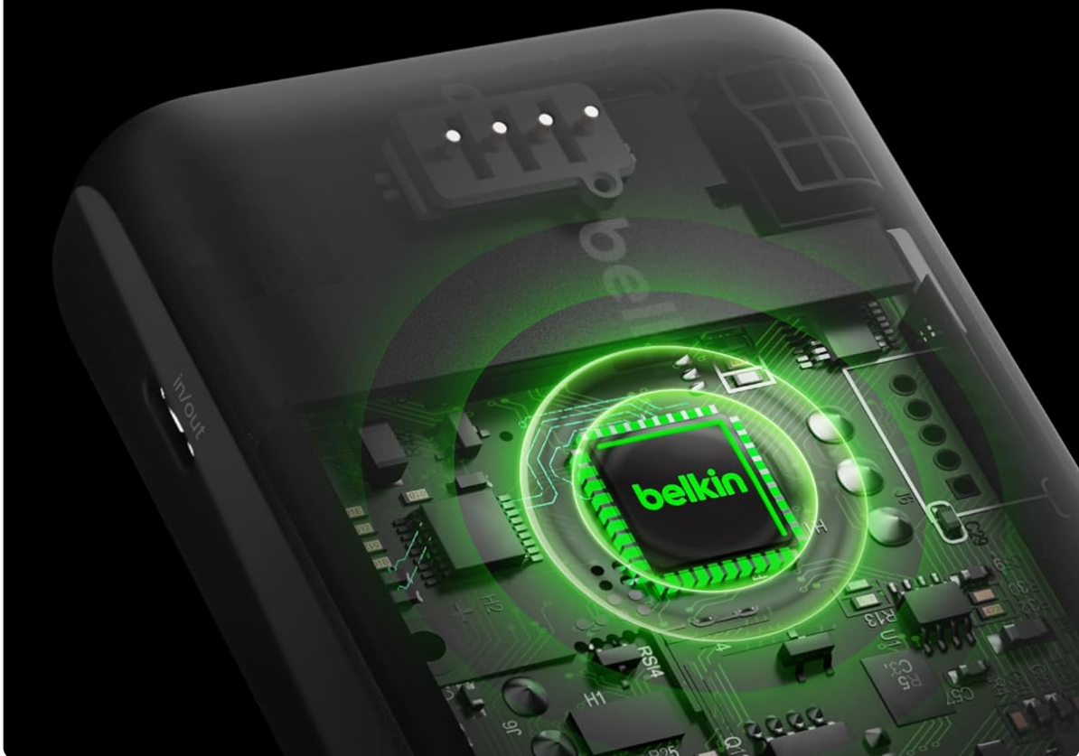
Figure 5: Visual representation of the power bank's 10,000mAh capacity providing extended battery life.