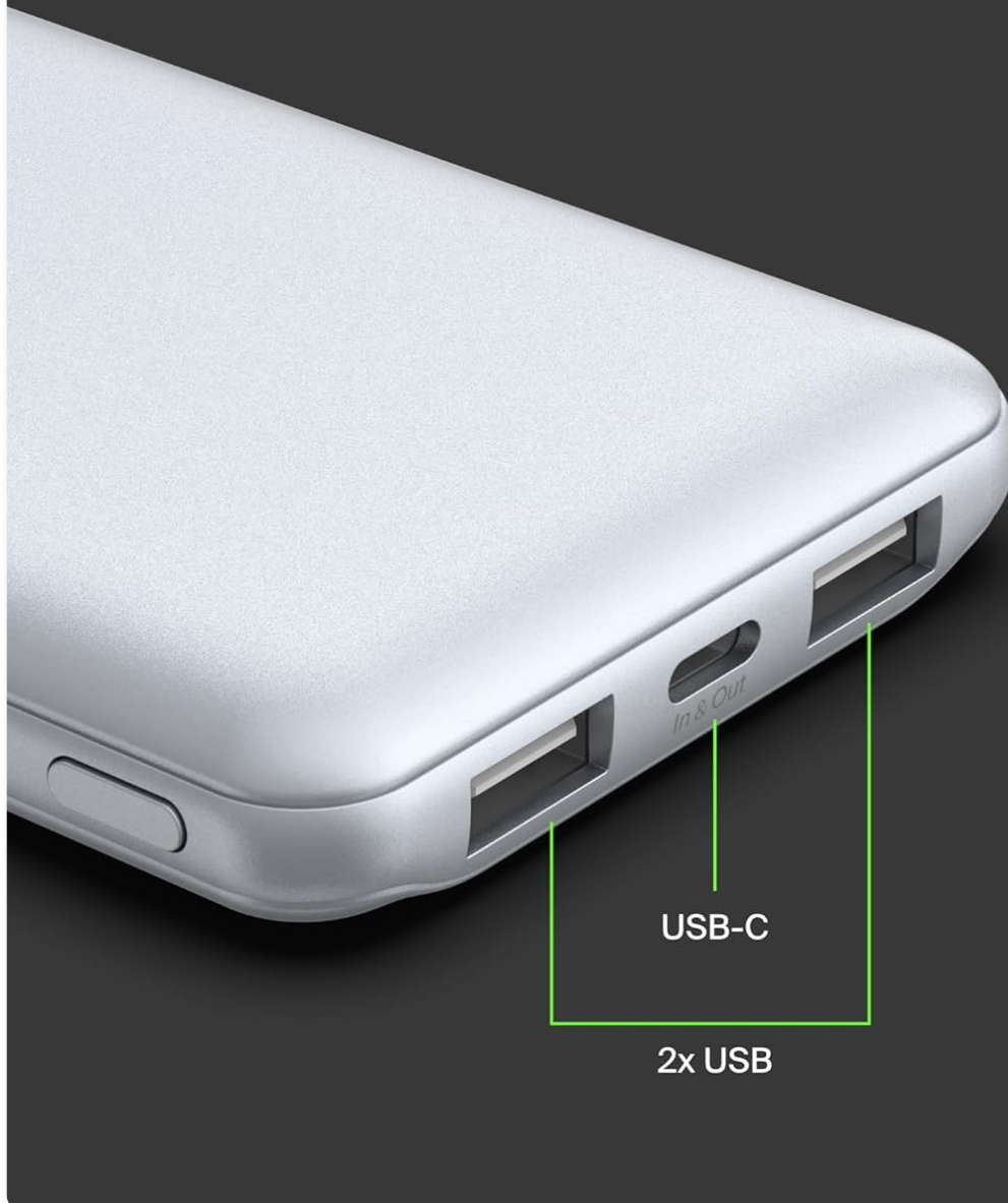
Figure 6: Examples of fast charging capabilities for various devices.