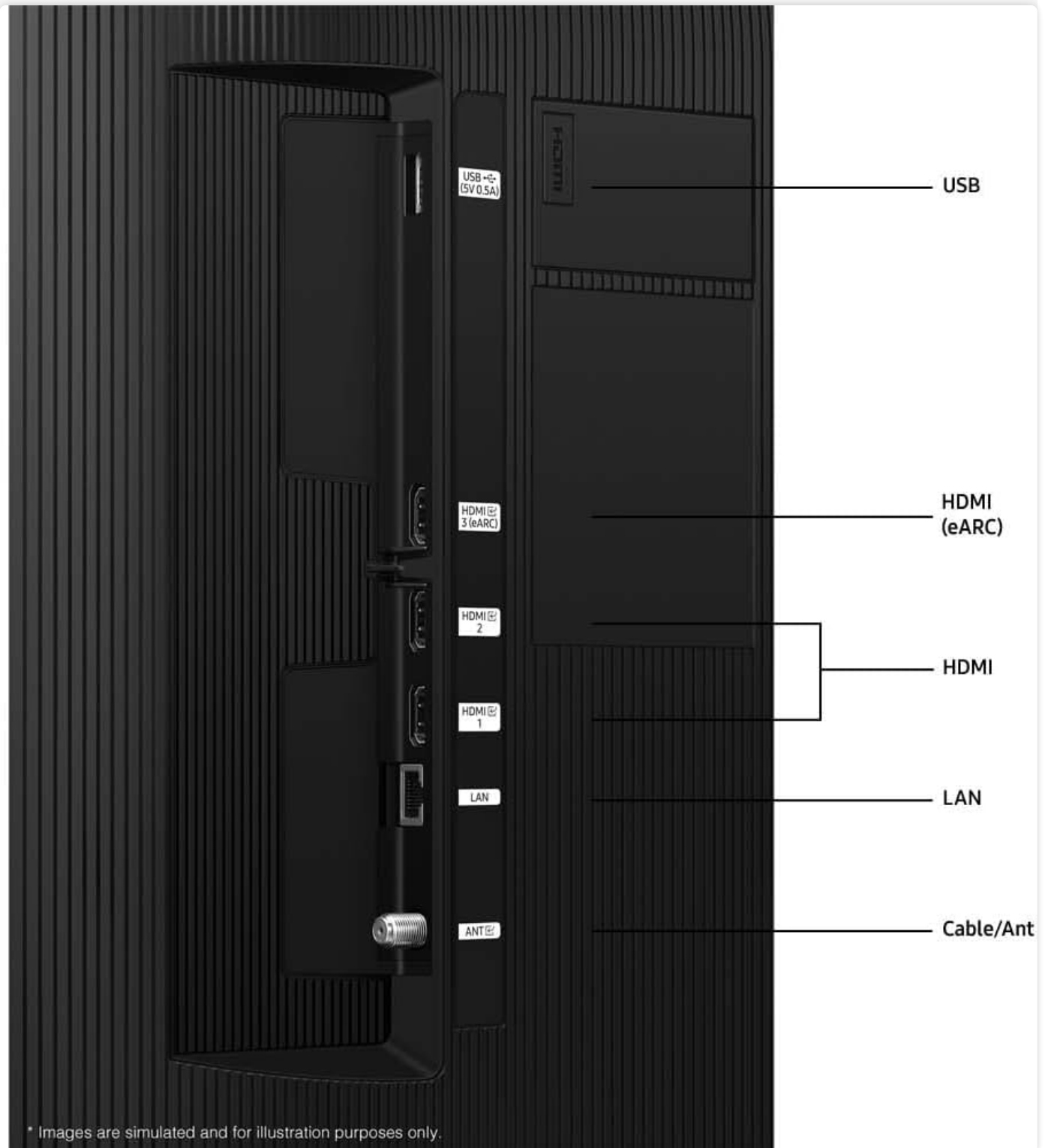
Figure 4: Rear panel connections of the Samsung QN90D TV, detailing the placement of USB, HDMI (including eARC), LAN, and Cable/Antenna ports.