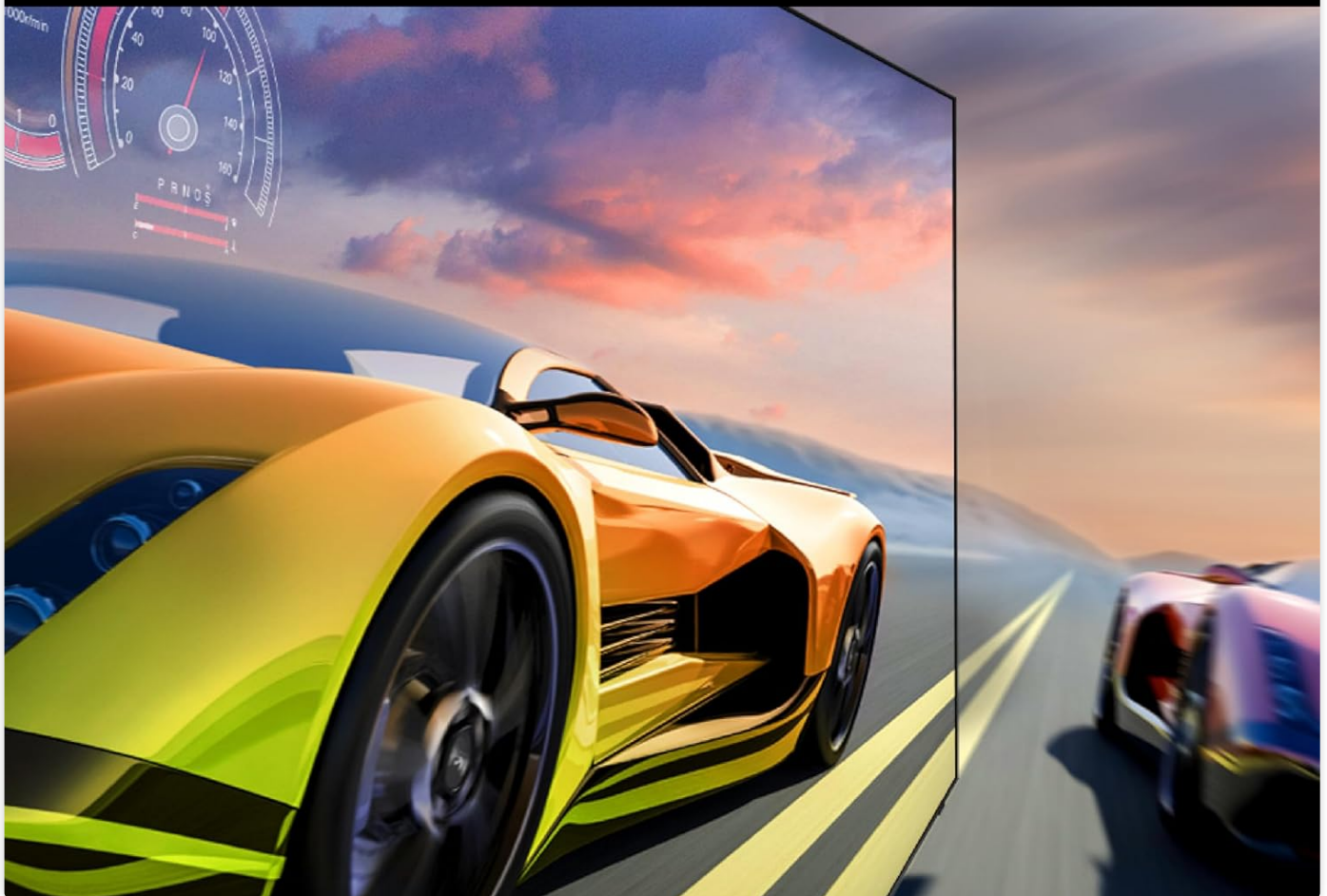
Figure 9: Peak Motion Enhancements 144Hz, demonstrating the TV's capability for ultra-smooth gaming and content playback.

Play games and content with ultra-smooth motion and virtually no lag or blur. Get uninterrupted action with crisp visuals rendered at top speeds, so you always have a seamless, non-stop picture.*