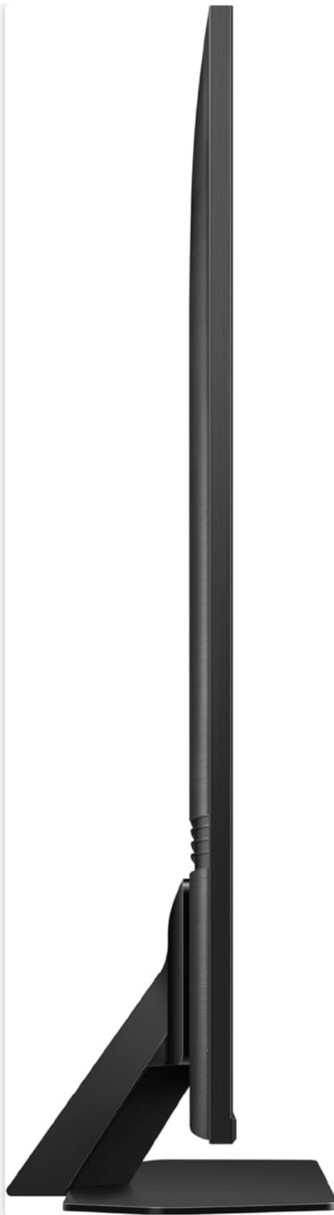
Figure 3: Side profile of the Samsung QN90D TV, highlighting its slim design and the attached stand.