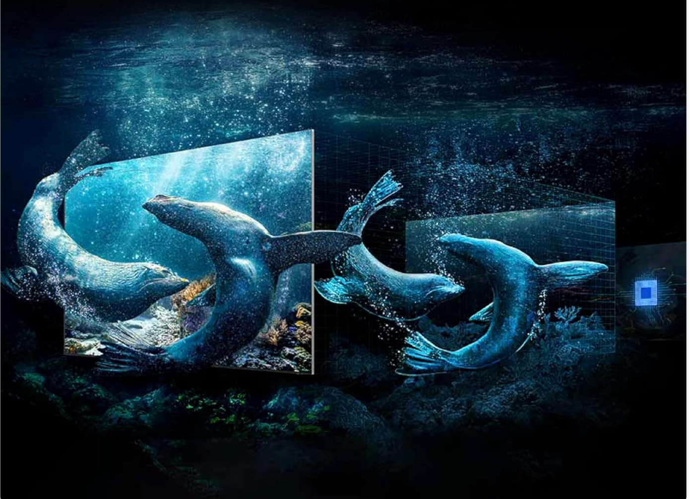
Figure 7: A New Level of Depth in Every Image, illustrating the Real Depth Enhancer Pro's ability to create a fully dimensional picture.

Experience depth and dimension on screen just like you do in real life. Real Depth Enhancer Pro finds the focal point in each frame and adjusts for a fully dimensional picture.