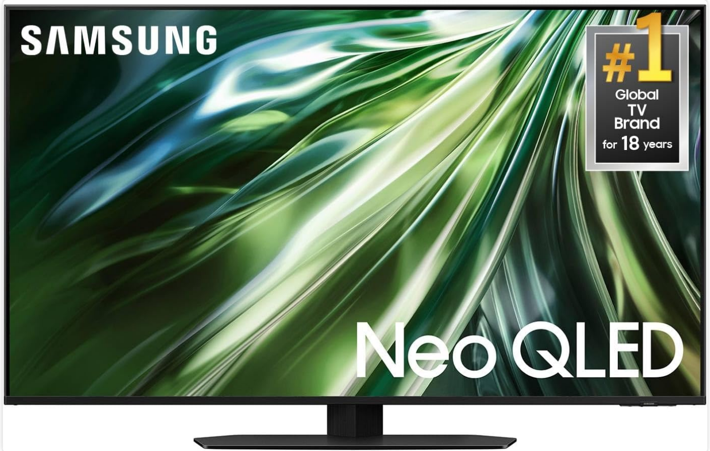
Figure 1: Samsung QN90D Series 65-Inch Neo QLED 4K Smart TV.