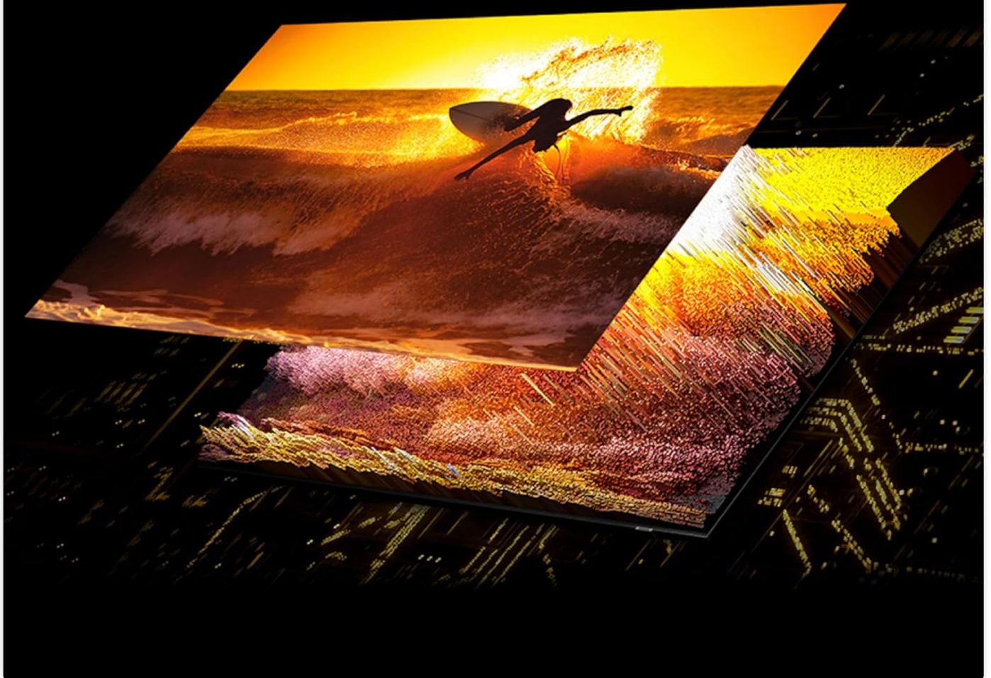
Figure 6: Brilliant Details, showcasing how Mini LEDs boost brightness for every detail in dark to bright scenes.

Catch every detail in dark to bright scenes. Precise lighting from Mini LEDs boost brightness so you don't miss a thing.