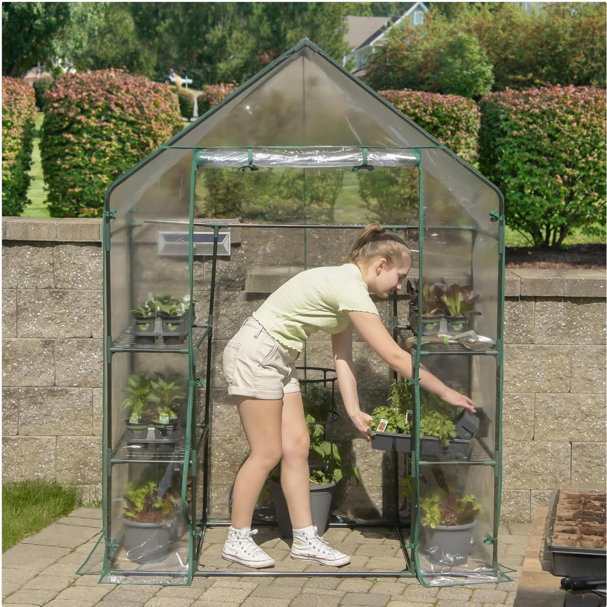
Figure 3: User interacting with plants inside the greenhouse.