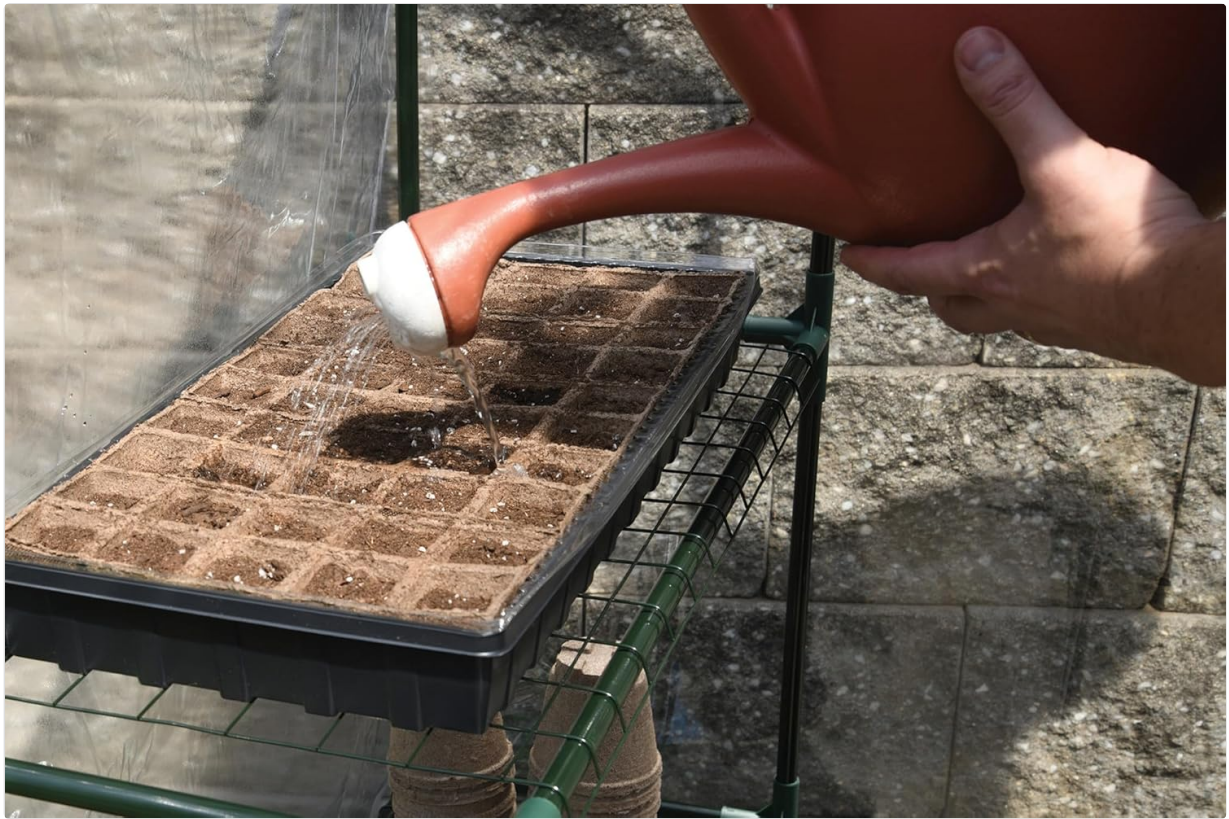
Figure 4: Watering seedlings on a shelf within the greenhouse.