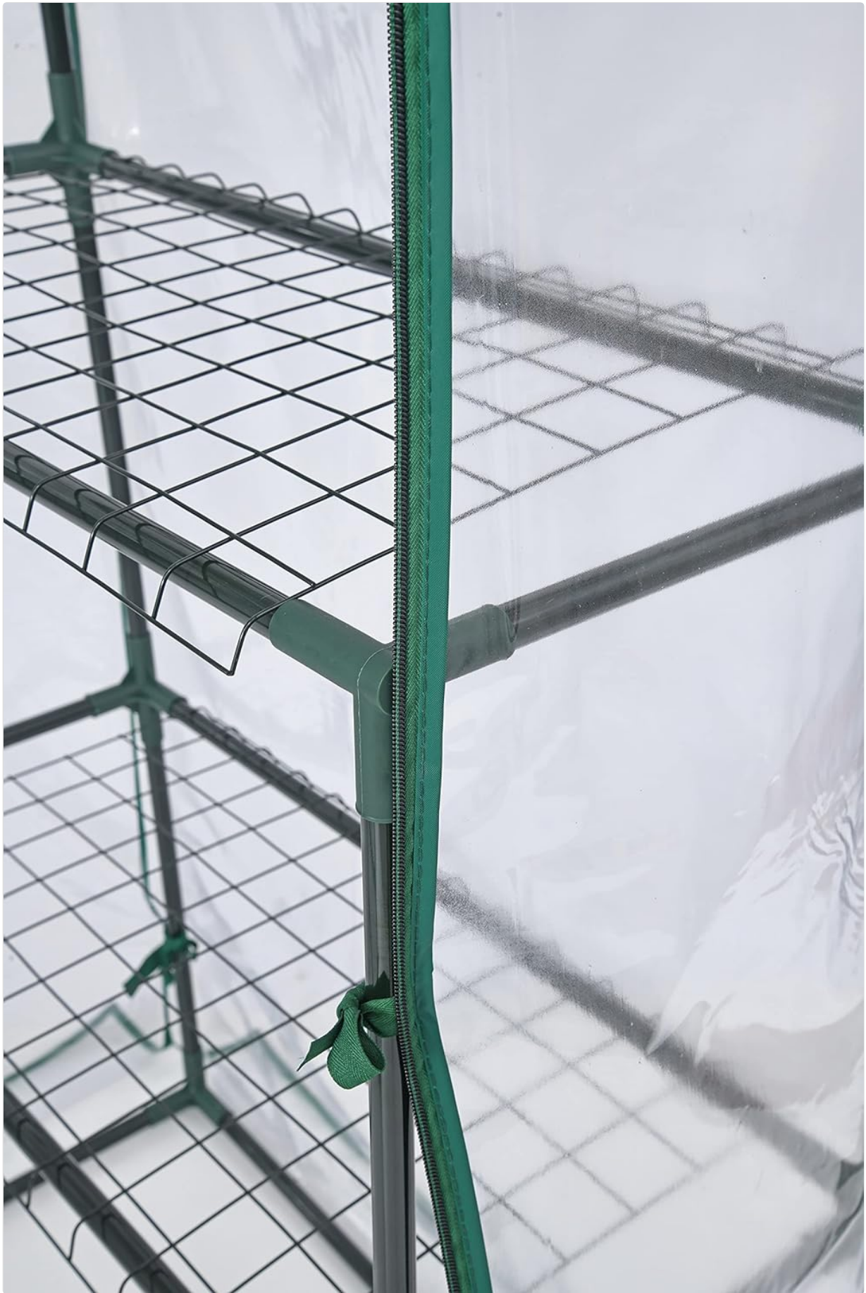
Figure 5: Detail of the durable double-zipper for easy access.