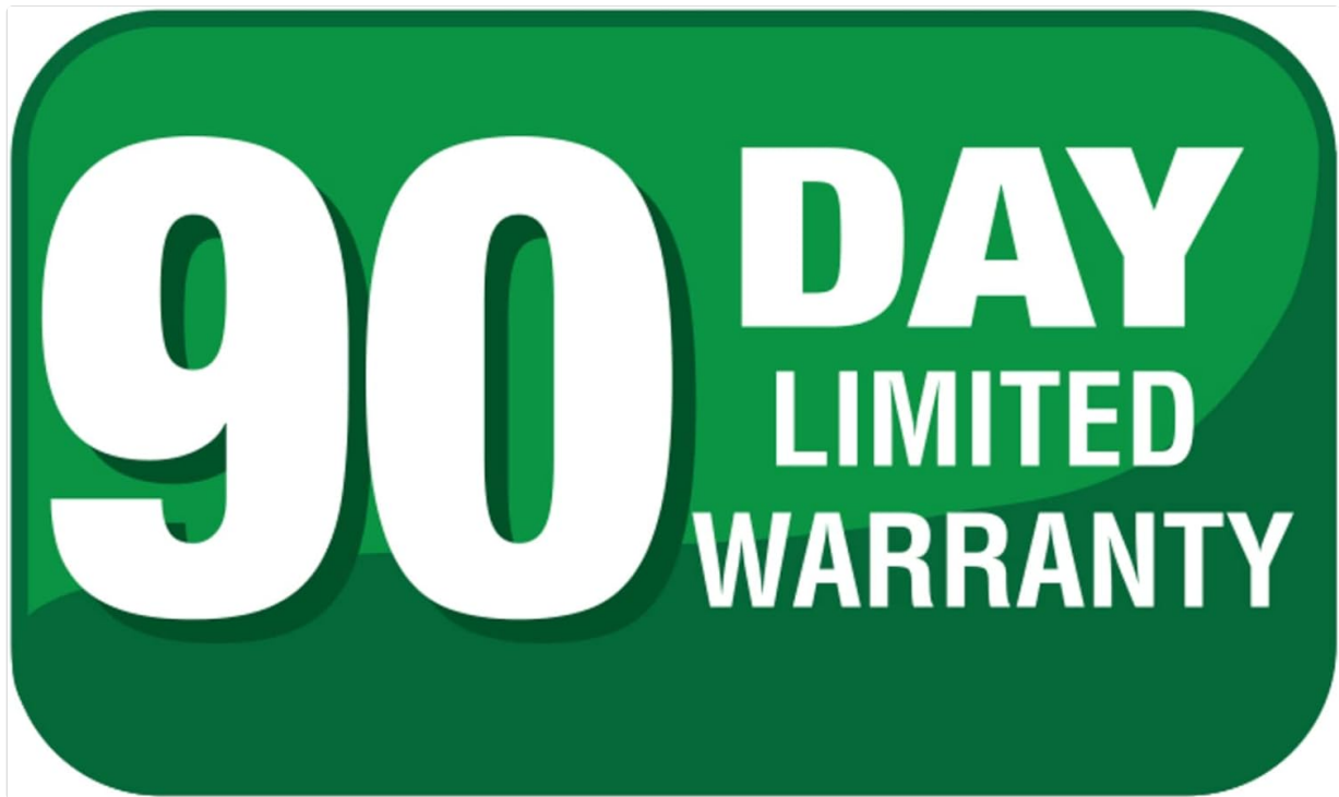
Figure 6: 90 Day Limited Warranty information.