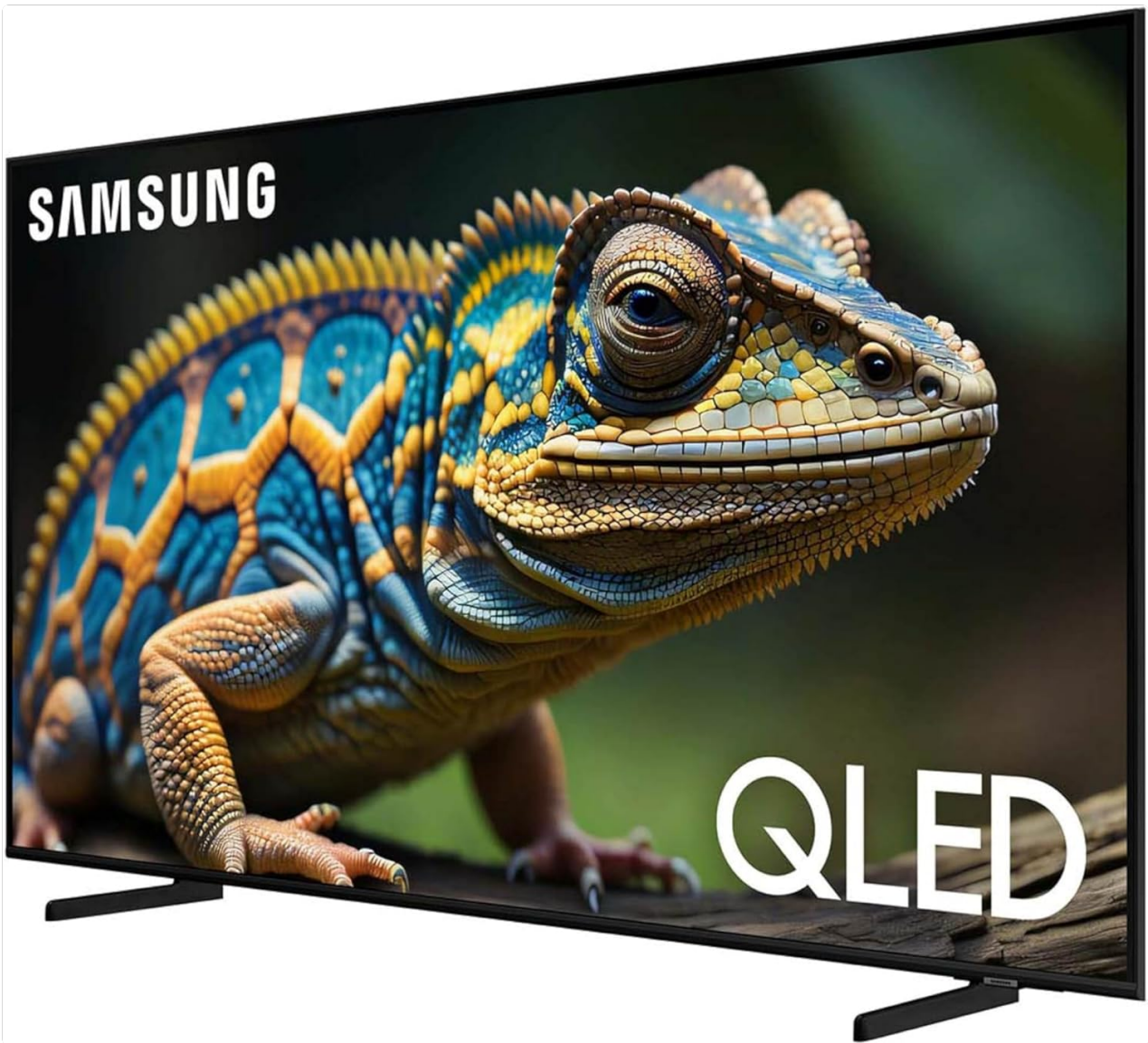
Figure 4.5: The AirSlim design offers a sleek, minimalist aesthetic.