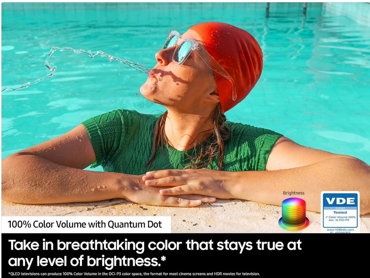
Figure 4.2: Quantum Dot technology ensures accurate and vibrant colors across all brightness levels.