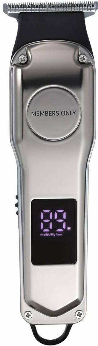
Figure 2.2: Front view of the hair clipper highlighting the intelligent LED display.