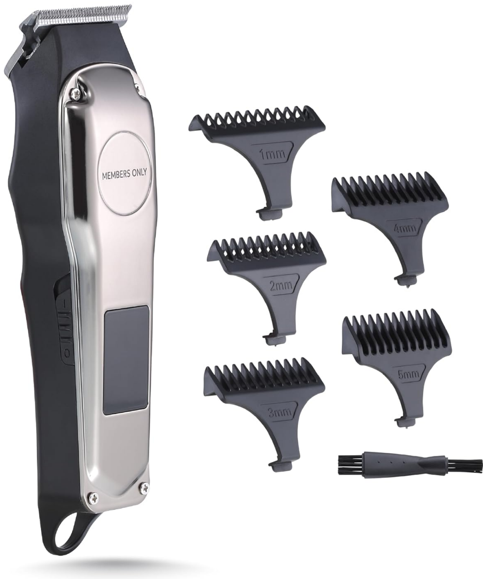
Figure 2.1: Complete 7-piece kit including the hair clipper, comb guides, and cleaning brush.