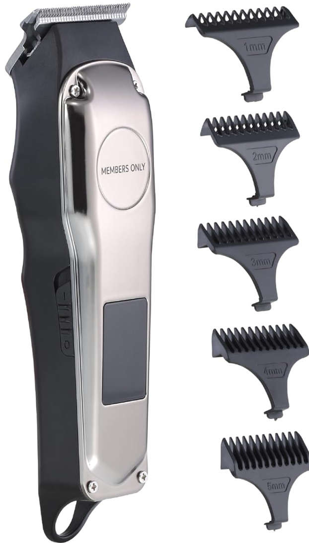
Figure 2.4: The five included comb guides (1mm, 2mm, 3mm, 4mm, 5mm) for various hair lengths.