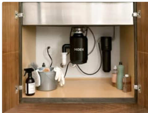
Image 3.1: An example of an under-sink setup, illustrating the space required for faucet connections and potential filtration system integration.