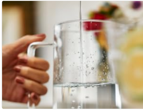
Image 4.2: The high-arc design of the faucet allows for easy filling of tall glasses and pitchers.

Image 4.1: The Moen Sip Drinking Water Faucet provides convenient access to cold, filtered drinking water directly at the sink.