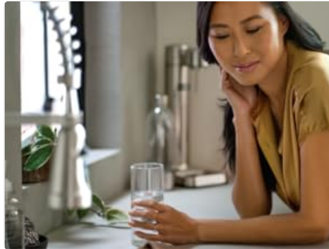
Image 4.3: Enjoy clean and refreshing drinking water directly from your Moen Sip faucet.