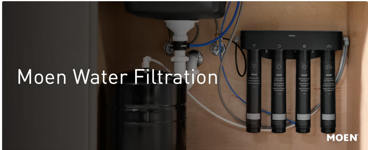
Image 3.2: Moen offers both Carbon Filters (F9800) and Reverse Osmosis (F9900) filtration systems, which can be paired with your Moen Sip faucet for filtered water.