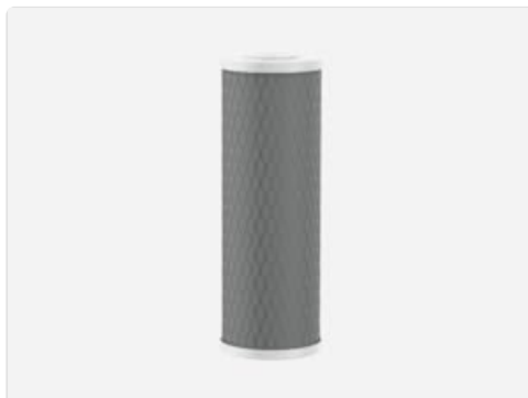
Image 5.1: Example of a filter cartridge used in compatible Moen filtration systems. Replace filters according to the filtration system's guidelines.

If you have connected your Moen Sip faucet to a Moen filtration system, refer to the filtration system's manual for specific filter replacement instructions and schedules. Regular filter replacement ensures optimal water quality.