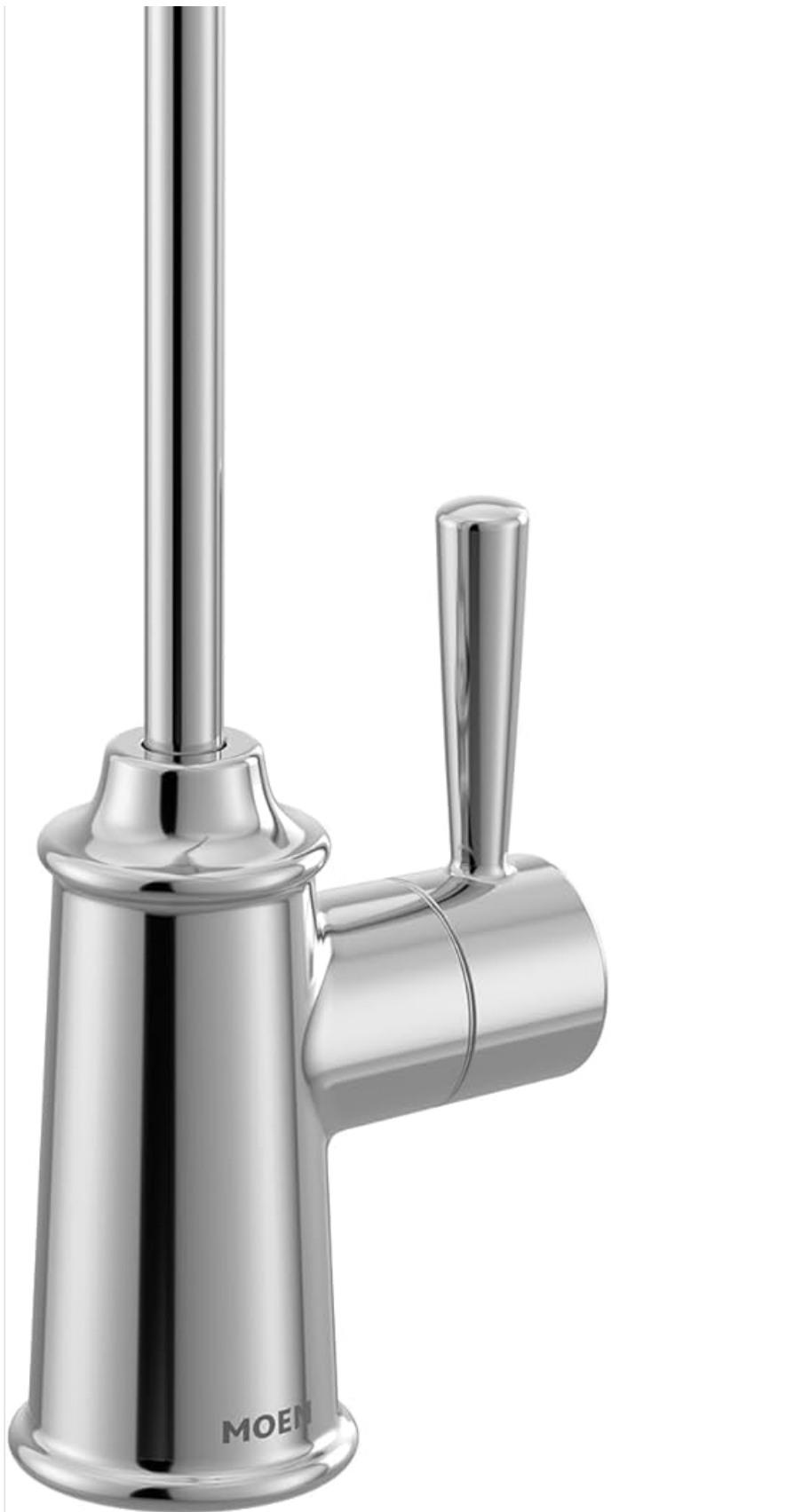
Image 1.1: The Moen Sip Chrome Traditional Drinking Water Beverage Faucet, featuring a high-arc spout and a single lever handle in a polished chrome finish.

The Moen Sip faucet is compatible with Moen under-sink filtration systems (sold separately), allowing you to enjoy clean, crisp cold drinking water and reduce the need for plastic water bottles.