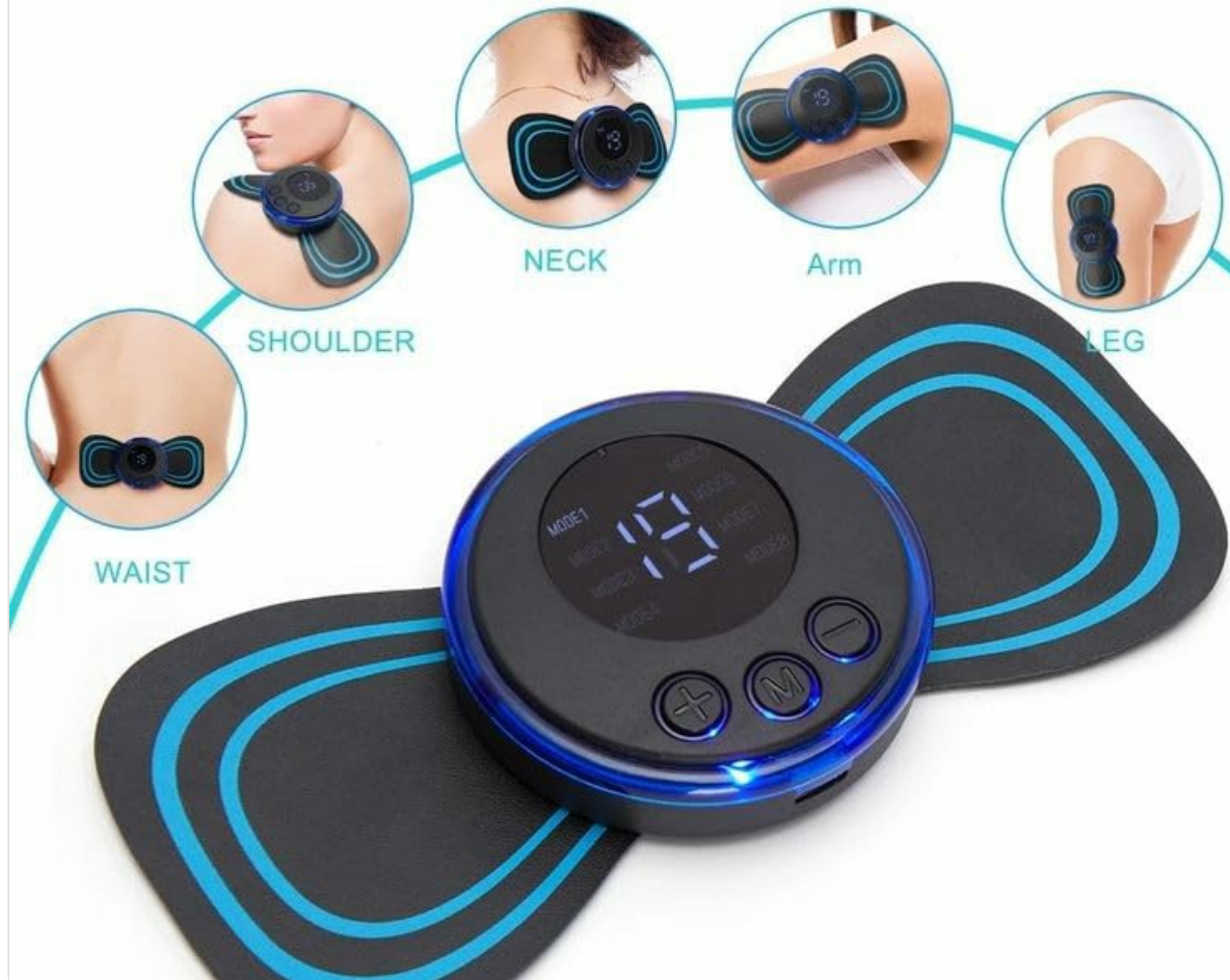
Image Description: A close-up of the ThermaFlex Mini Massage Stick's control panel, highlighting the digital display showing an intensity level (e.g., '19') and the '+' and '-' buttons for intensity adjustment, along with the 'M' button for mode selection. Surrounding images illustrate various application areas like neck, shoulder, arm, leg, and waist.

TENS LOW-FREQUENCY OUTPUT+ANALOG MASSAGE