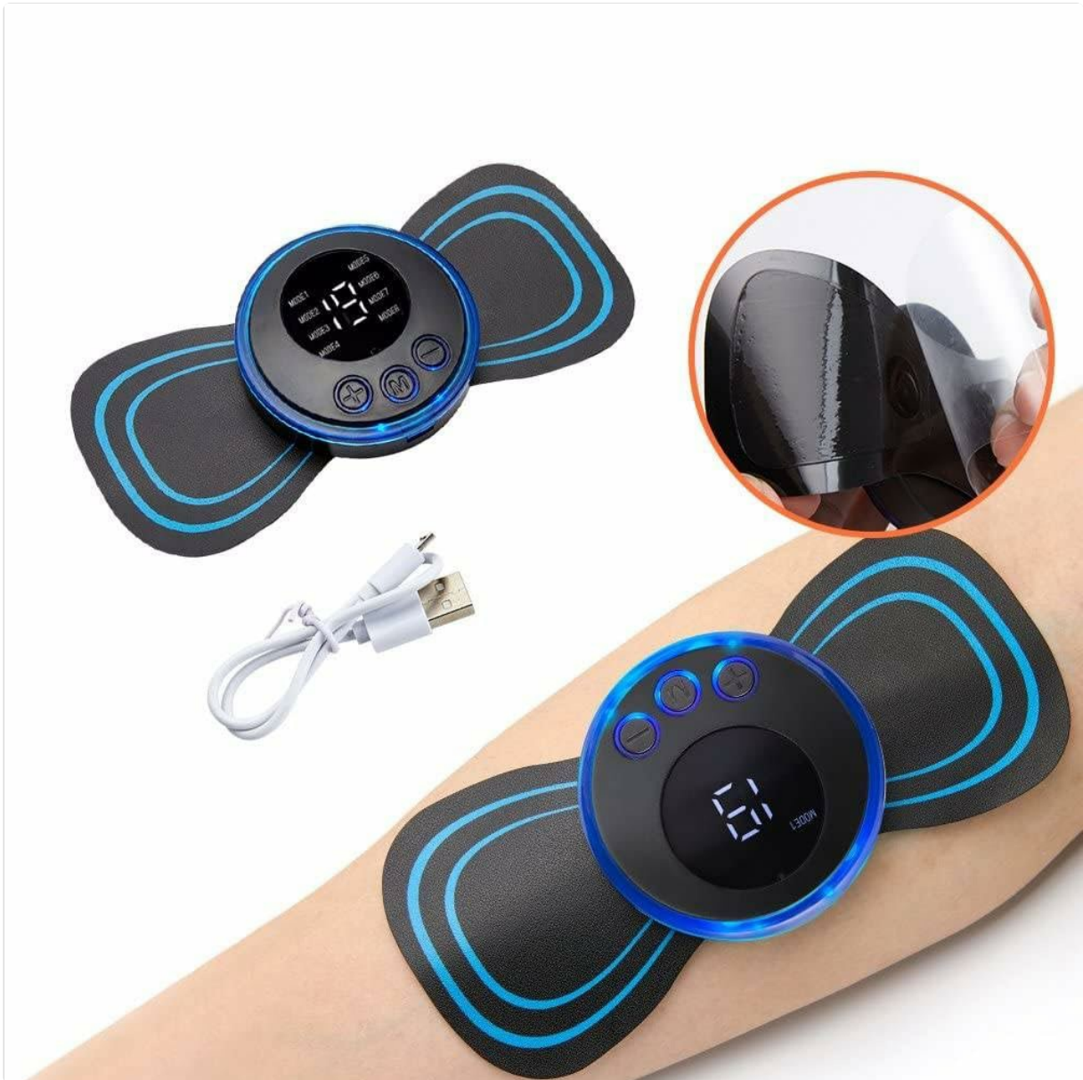
Image Description: The ThermaFlex Mini Massage Stick shown with one of its hydrogel pads being peeled back, demonstrating the removal of the protective film before use. The device is compact and features a central control unit with a digital display.

The massage stick comes with integrated hydrogel pads. Ensure the protective film is removed from the pads before application. The pads are designed to be skin-friendly and adhere securely to the body.