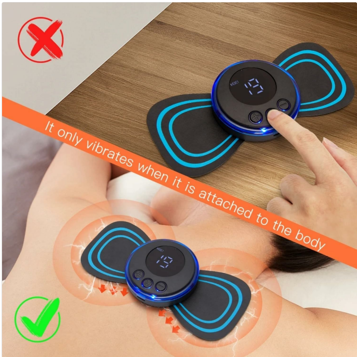
Image Description: An illustration showing the ThermaFlex Mini Massage Stick correctly applied to a person's back, with visual cues indicating the pulse therapy is active. An incorrect application (not attached to body) is also shown with a red 'X', emphasizing that the device only functions when in contact with skin.