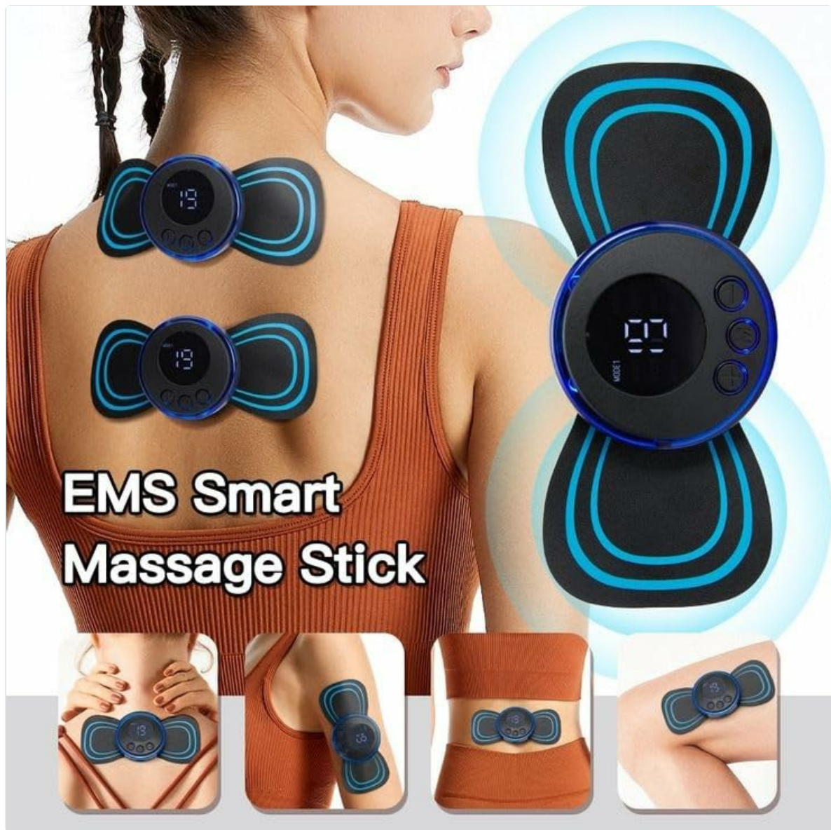
Image Description: A collage demonstrating the versatility of the ThermaFlex Mini Massage Stick, showing it applied to a person's back, waist, arm, and leg, illustrating its use for full-body muscle relief.