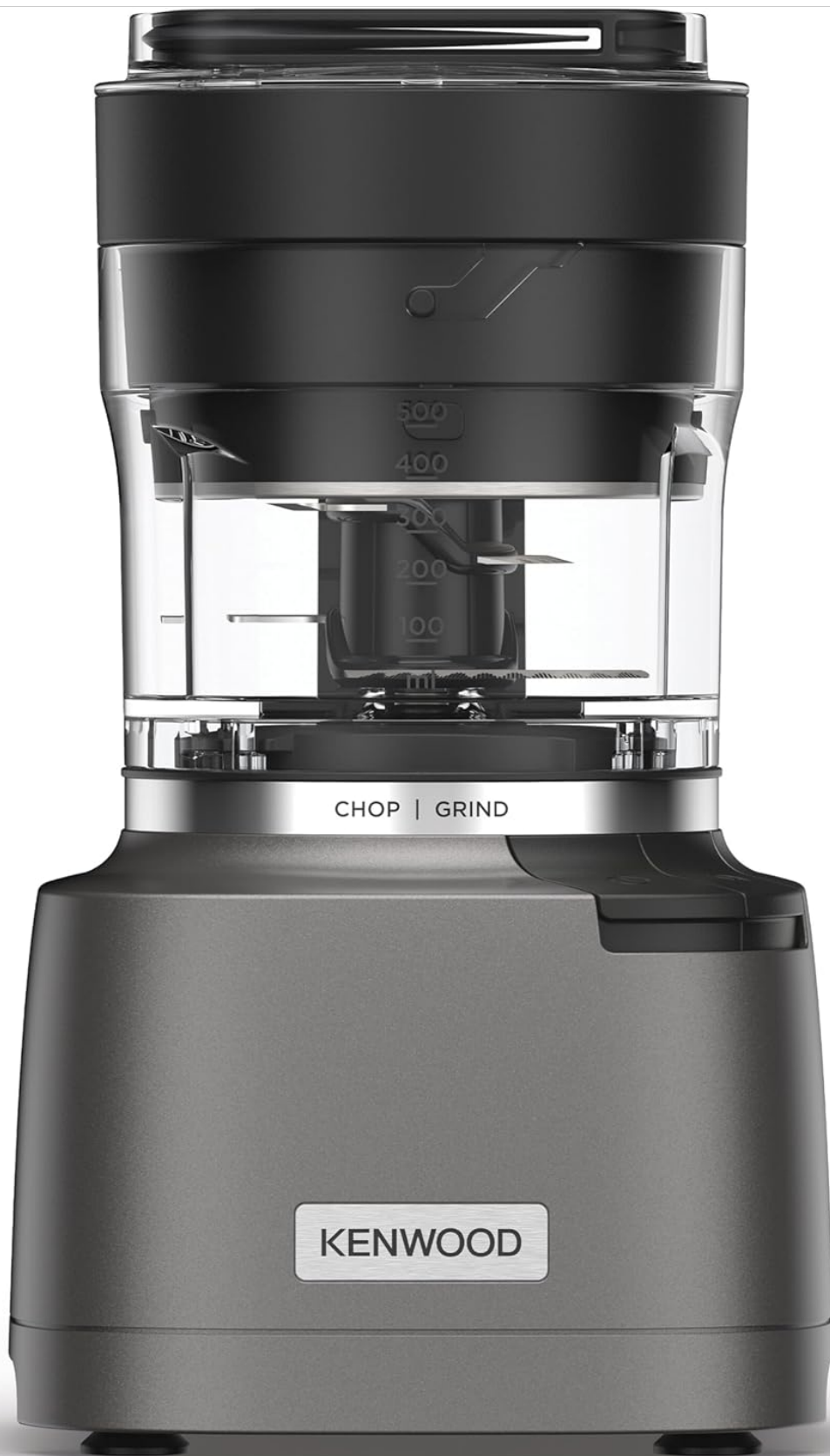
Figure 7: Product Overview - This image illustrates the compact design of the Kenwood Duo Prep, highlighting its sleek appearance.