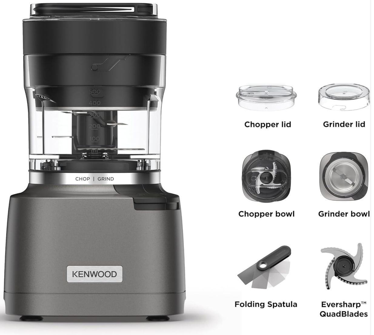
Figure 2: Two Control Modes - The appliance features distinct buttons for chopping and grinding functions.