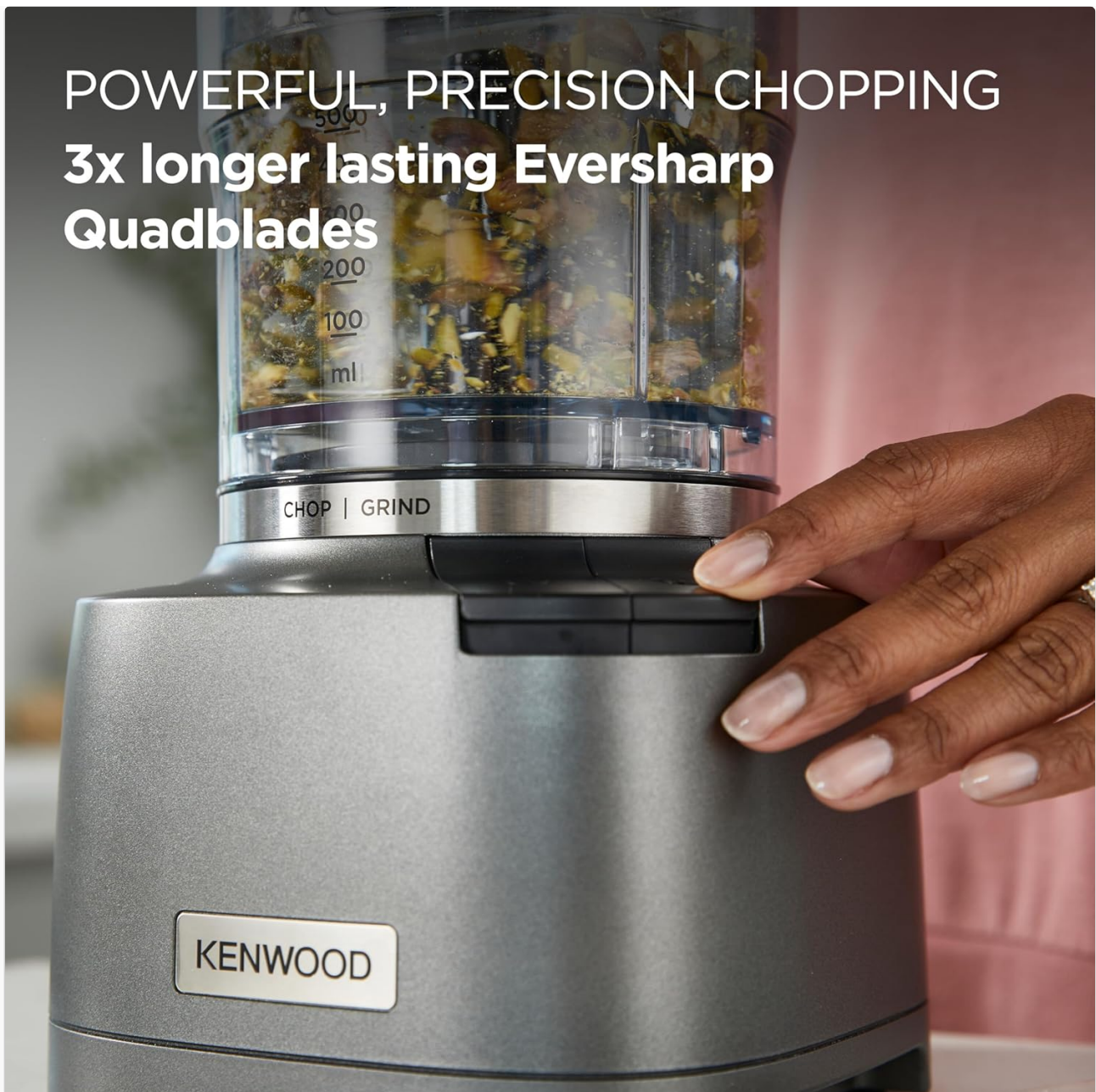
Figure 4: High-Speed Grinding - The specialized grinder bowl efficiently processes spices to a fine consistency.