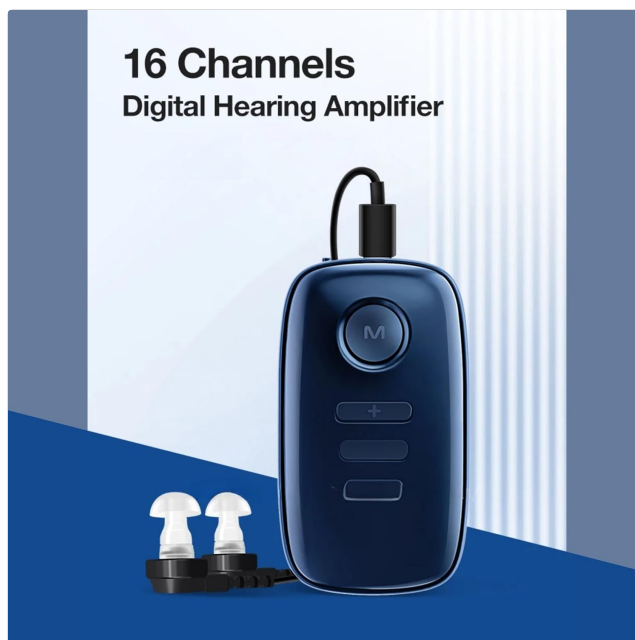
Figure 3: Hearing aid with eartips.