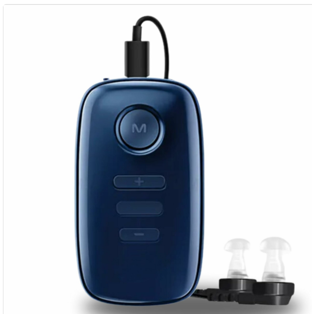
Figure 1: Front view of the Aika AK-690 Hearing Aid.

The Aika AK-690 is a digital rechargeable pocket hearing aid designed to enhance auditory experiences. It features 16 channels for clear sound processing, active noise reduction technology, and a long-lasting battery. This manual provides essential information for the proper setup, operation, maintenance, and troubleshooting of your device.