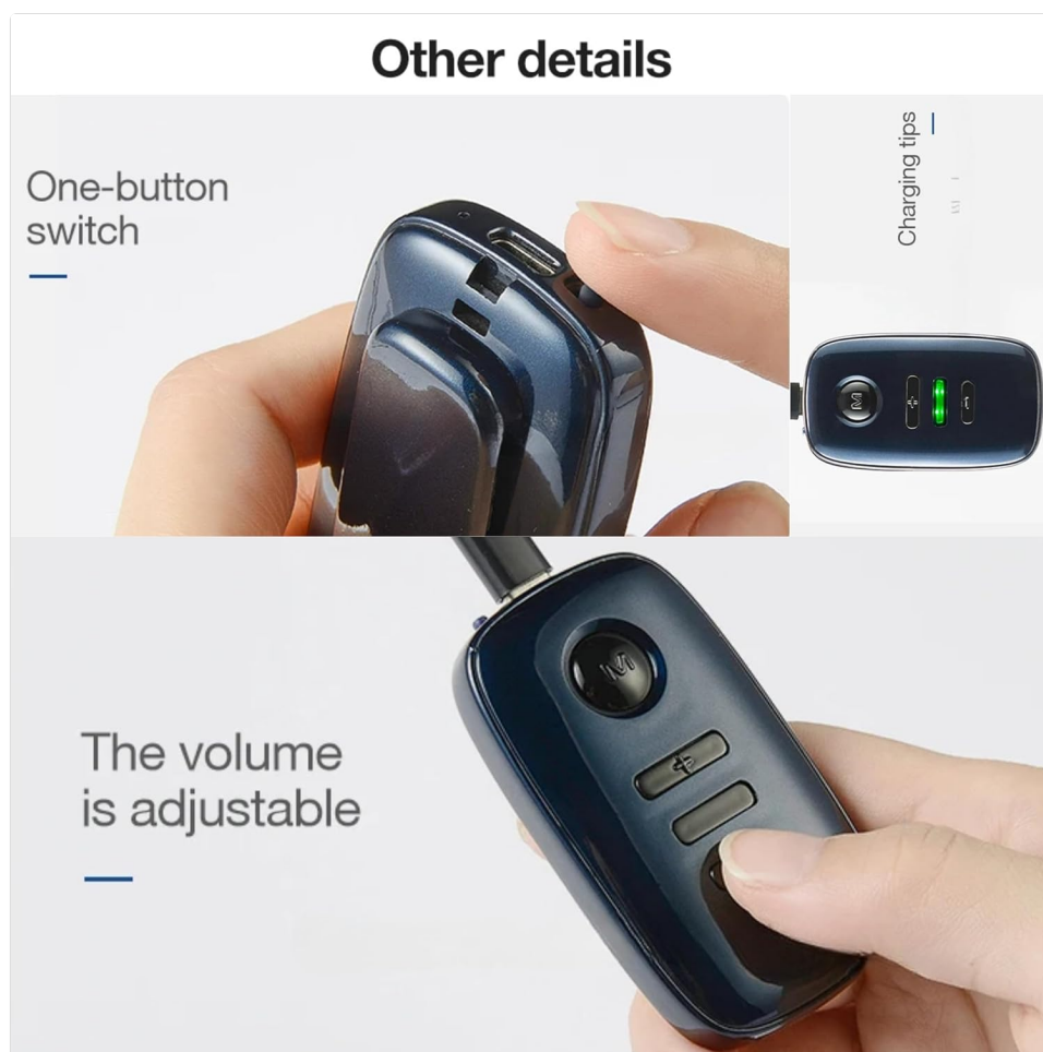
Figure 6: Charging port and indicator lights.