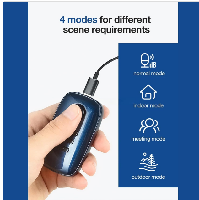
Figure 5: Four modes for different scene requirements.

Press the Mode (M) button to cycle through the available listening modes. Each mode is optimized for different acoustic environments.