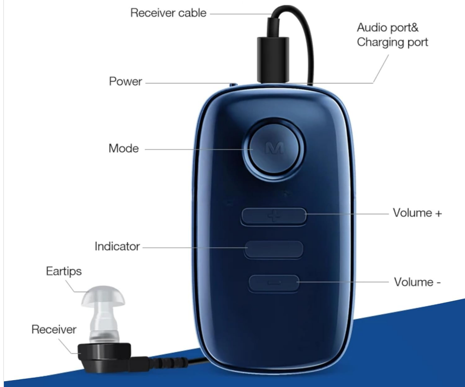
Figure 2: Product Structure and Components.