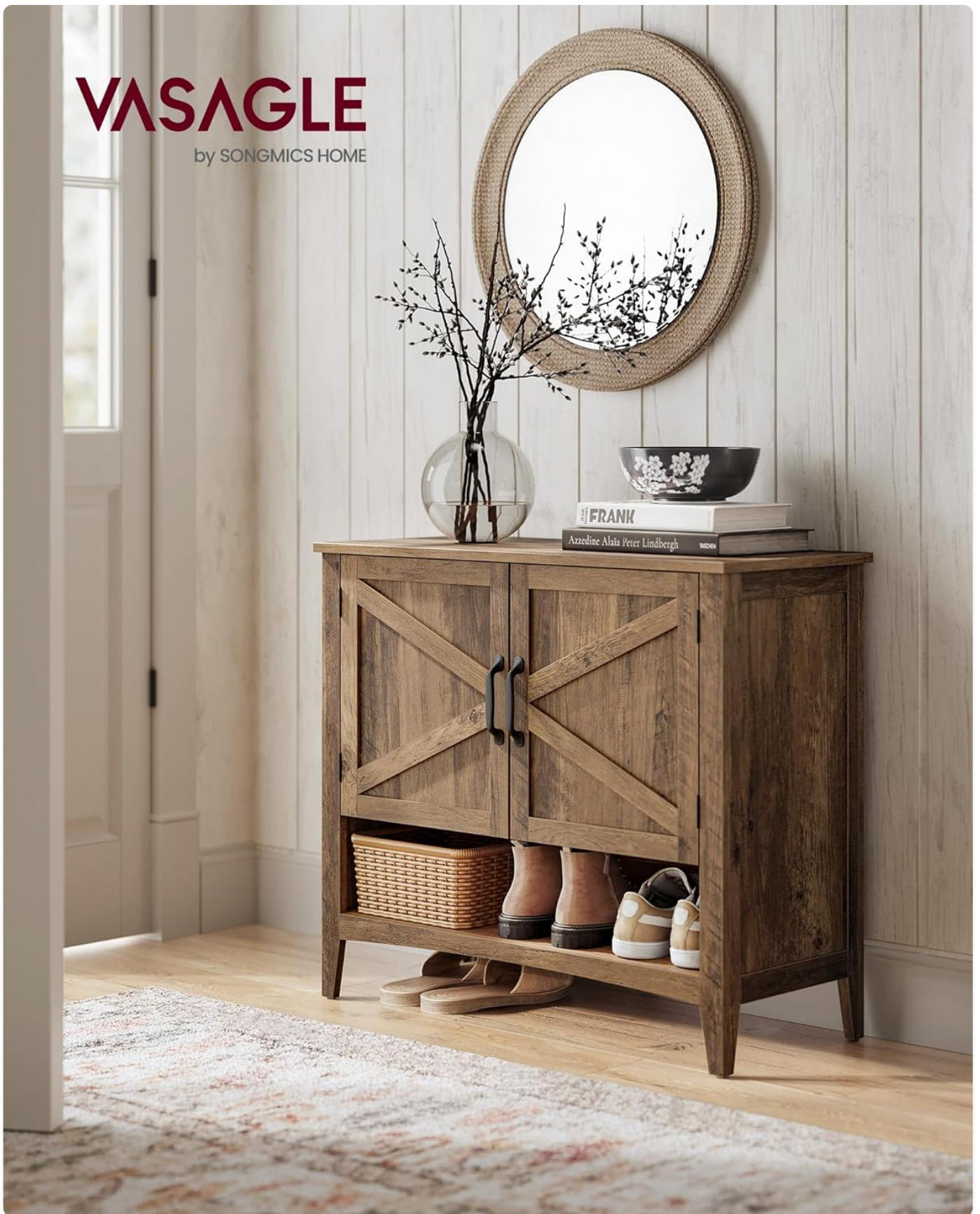
Image: The VASAGLE Shoe Cabinet, a honey brown unit with barn-door style fronts, positioned in a bright entryway, complementing the rustic decor.