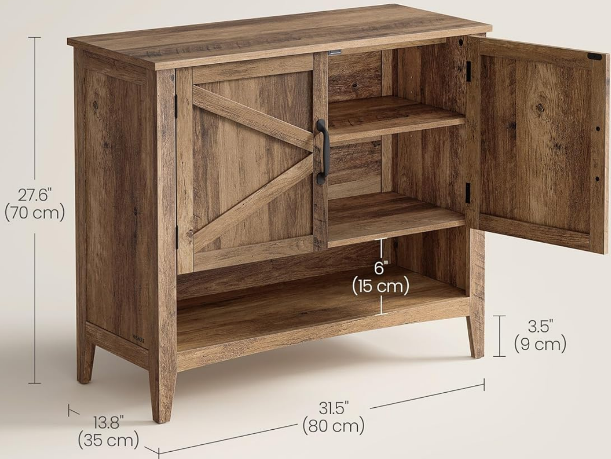
Image: A diagram illustrating the dimensions (13.8"D x 31.5"W x 27.6"H) and maximum static load capacity (165 lb) of the shoe cabinet.

↓ ↓ ↓ 165 lb (75 kg) Max. Static Load Capacity in Total