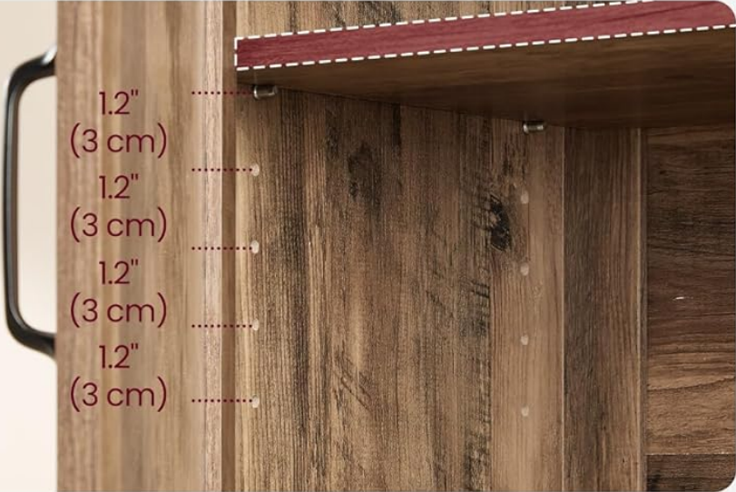
Image: A visual representation of the adjustable shelf feature, showing how the shelf height can be customized to fit taller items like boots. The open bottom shelf provides convenient access for frequently used items or additional shoe storage. The sturdy top surface can be used for decorative items, keys, or other entryway essentials.