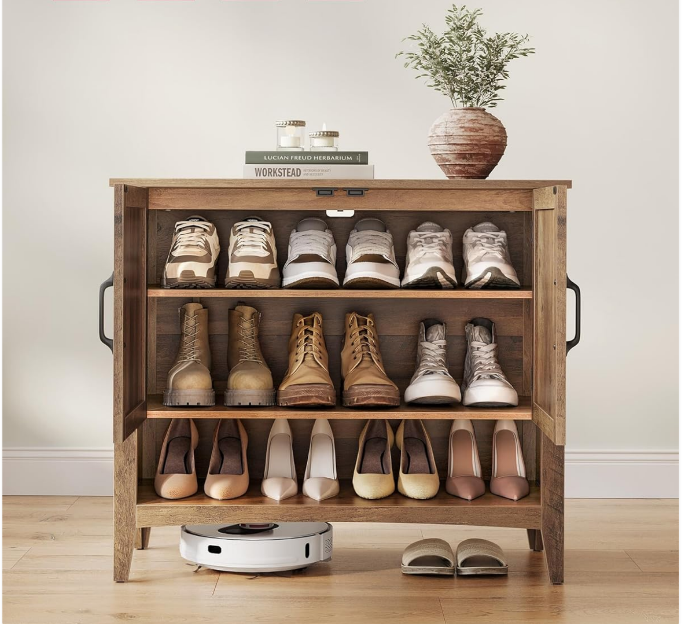
Image: The shoe cabinet with its doors open, revealing multiple shelves filled with various types of footwear, demonstrating its storage capacity.