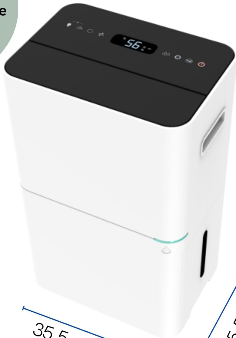
Front view of the Qlima D 820 A SMART Dehumidifier, showing the control panel and air outlet.