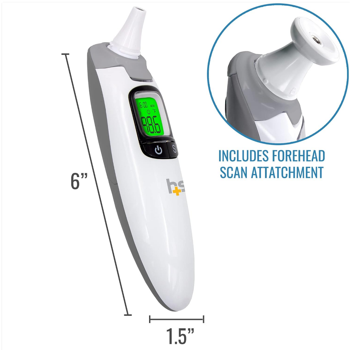
Image: The thermometer with its approximate dimensions (6 inches long, 1.5 inches wide) and the forehead scan attachment highlighted.