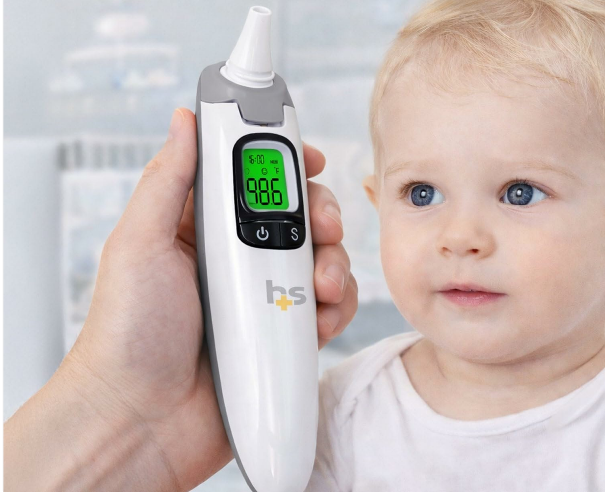
Image: The thermometer's display illustrating the color-coded temperature ranges for normal, low fever, and fever conditions.