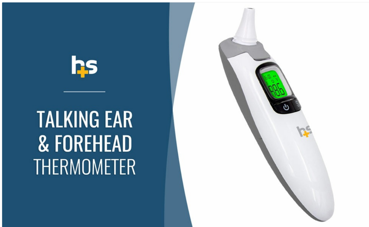
Image: The HealthSmart Talking Ear & Forehead Thermometer, showcasing its design and dual functionality.

The HealthSmart Talking Infrared Ear & Forehead Thermometer provides instant, accurate temperature readings for all ages. It features both ear and forehead measurement modes, a visual fever alarm, and audio readings in English and Spanish. The device also includes a 3-color backlit display and a 30-reading memory function.