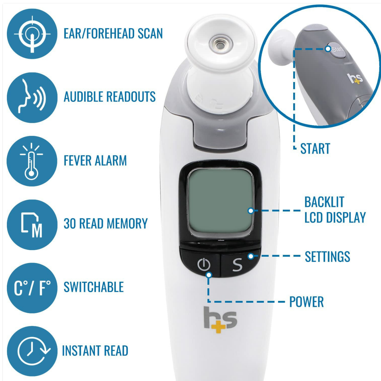
Image: The thermometer highlighting the Power and Settings buttons, and the backlit LCD display.