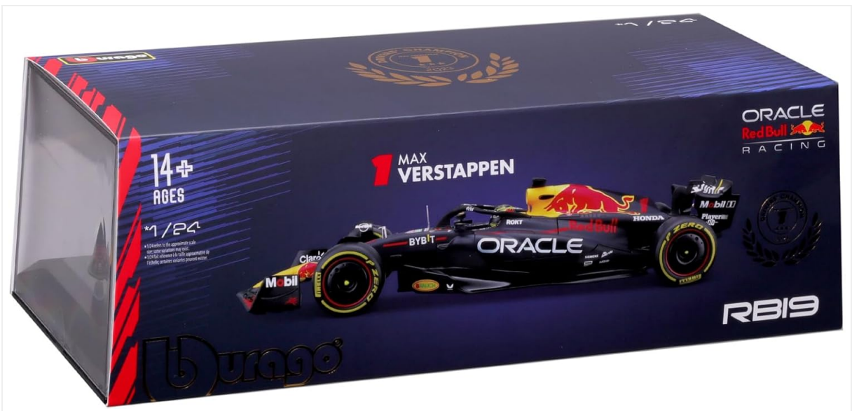
Image: A side profile view of the Bburago 1:24 scale Oracle RB19 diecast model, showing the full length of the car and sidepod details.