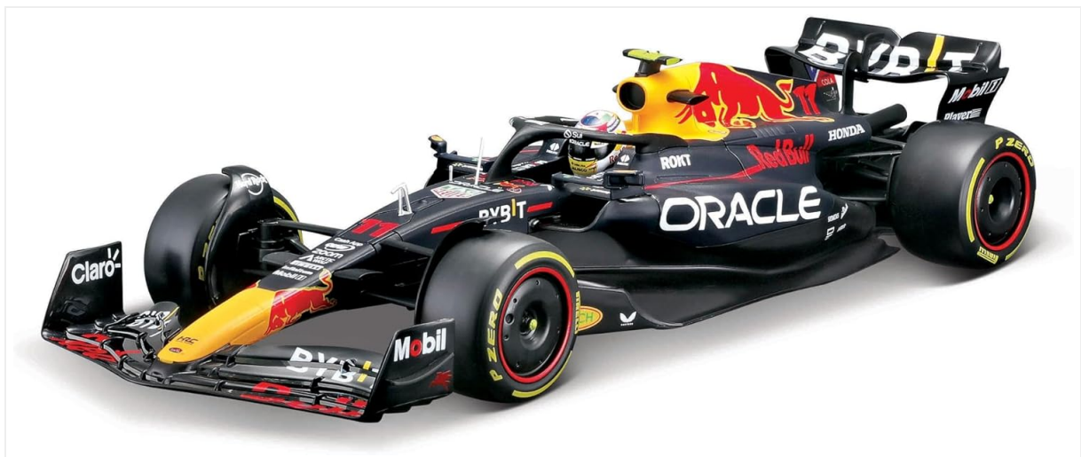
Image: A detailed front-side view of the Bburago 1:24 scale Oracle RB19 diecast model, showcasing its intricate livery and aerodynamic features.

The model can be displayed on its base with the acrylic cover for protection, or without the cover for an unobstructed view. Ensure the display location is stable, away from direct sunlight, extreme temperatures, and high humidity to preserve the model's condition.