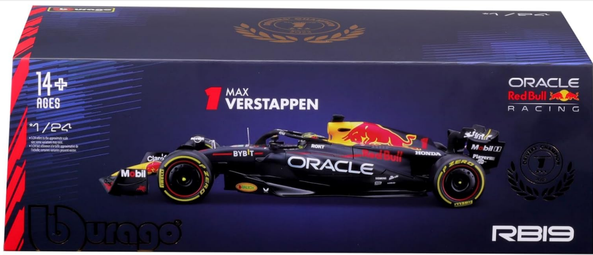
Image: The Bburago RB19 diecast model presented in its clear acrylic display case, enclosed within a dark blue decorative sleeve featuring product branding and imagery.