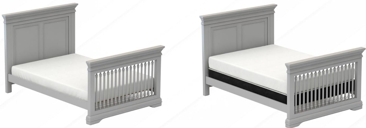
Image: Comparison showing a bed with slats (lower mattress height) versus a bed with a box spring (higher mattress height).

Ensure the mattress is properly centered on the slats to prevent shifting.