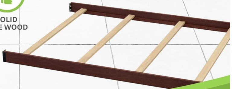
Image: Highlights the premium quality features of the product, including 100% solid wood construction and non-toxic, lead-free, phthalate-free finishes.