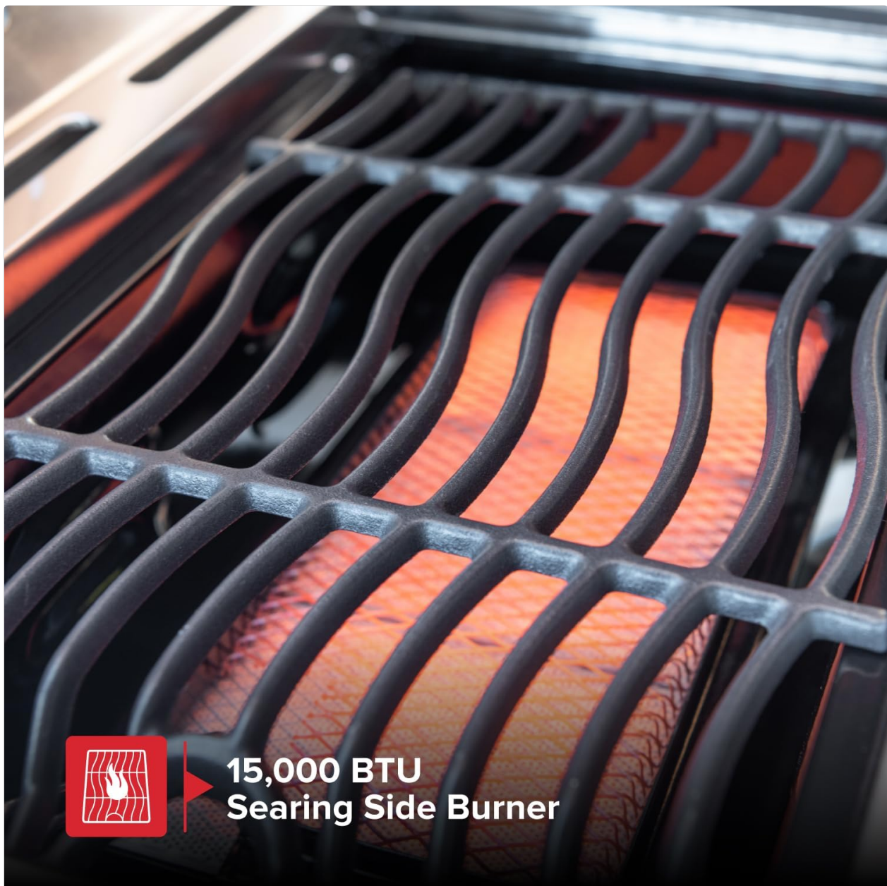
Figure 4.3: Close-up of the 15,000 BTU ceramic searing side burner.