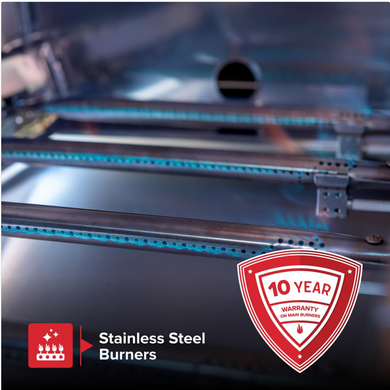
Figure 5.1: Stainless steel burners, designed for durability and easy maintenance.