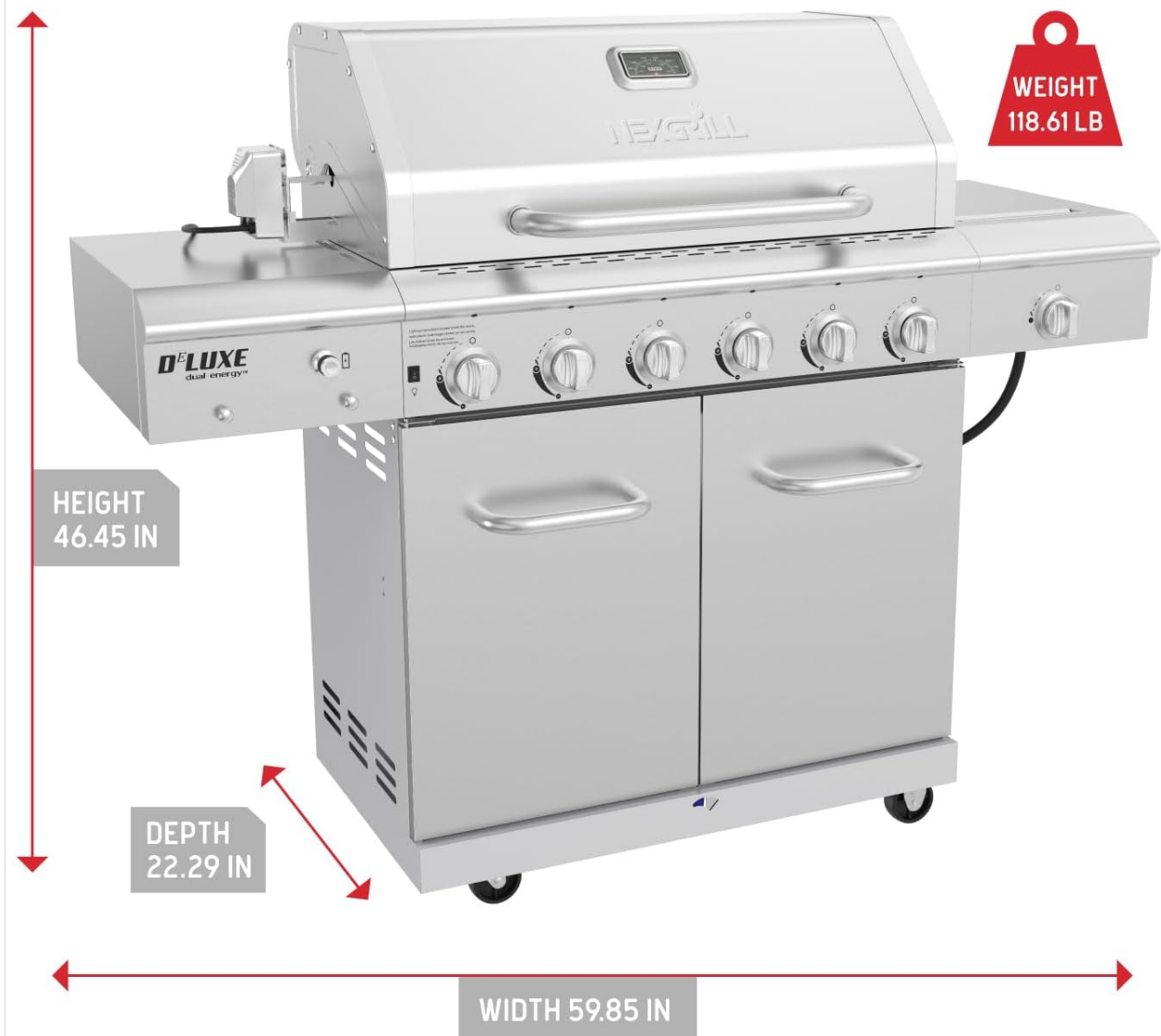
Figure 3.1: Product dimensions for assembly planning.