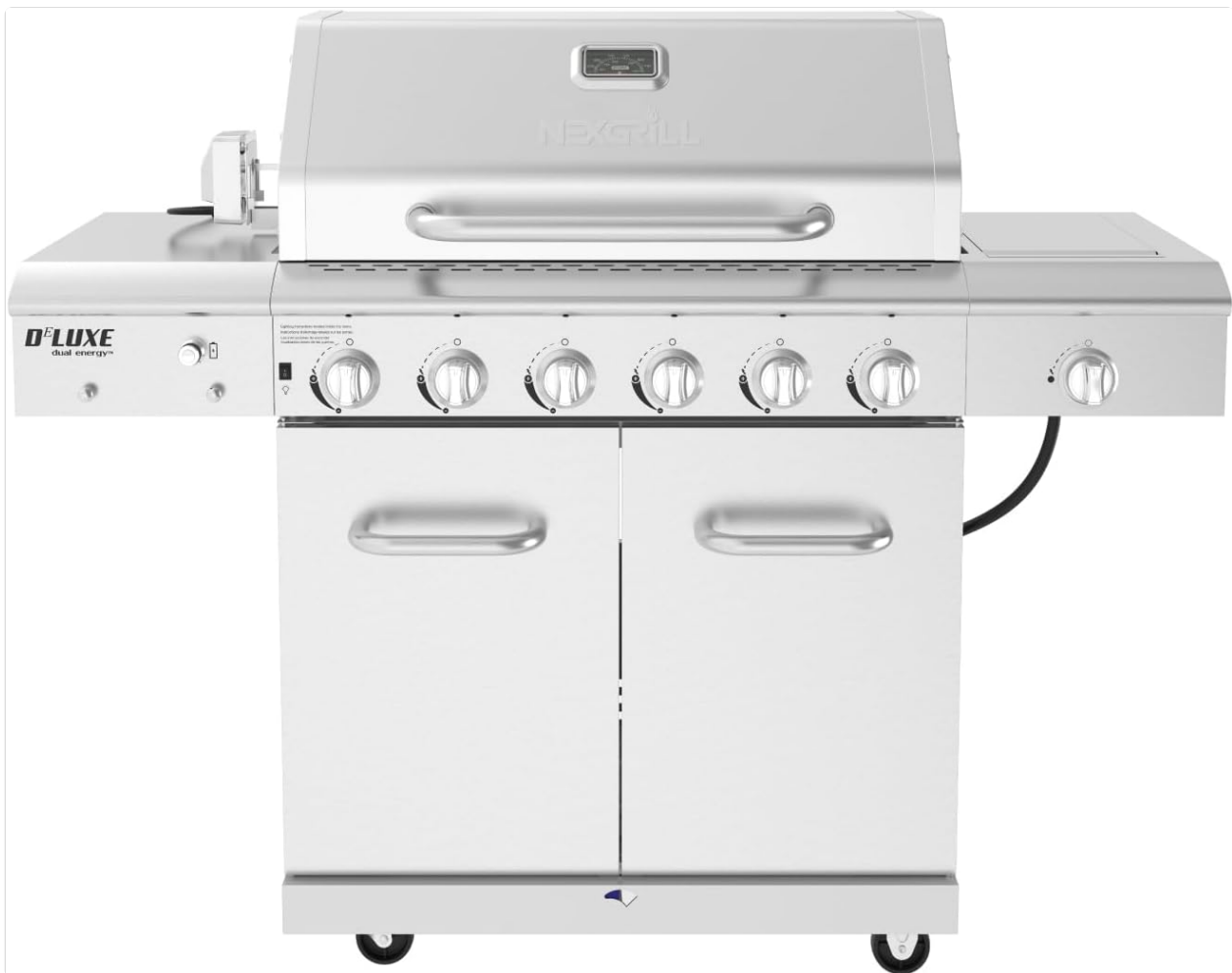
Figure 1.1: Nexgrill Deluxe 6-Burner Propane Gas Grill (Model 720-0896X)