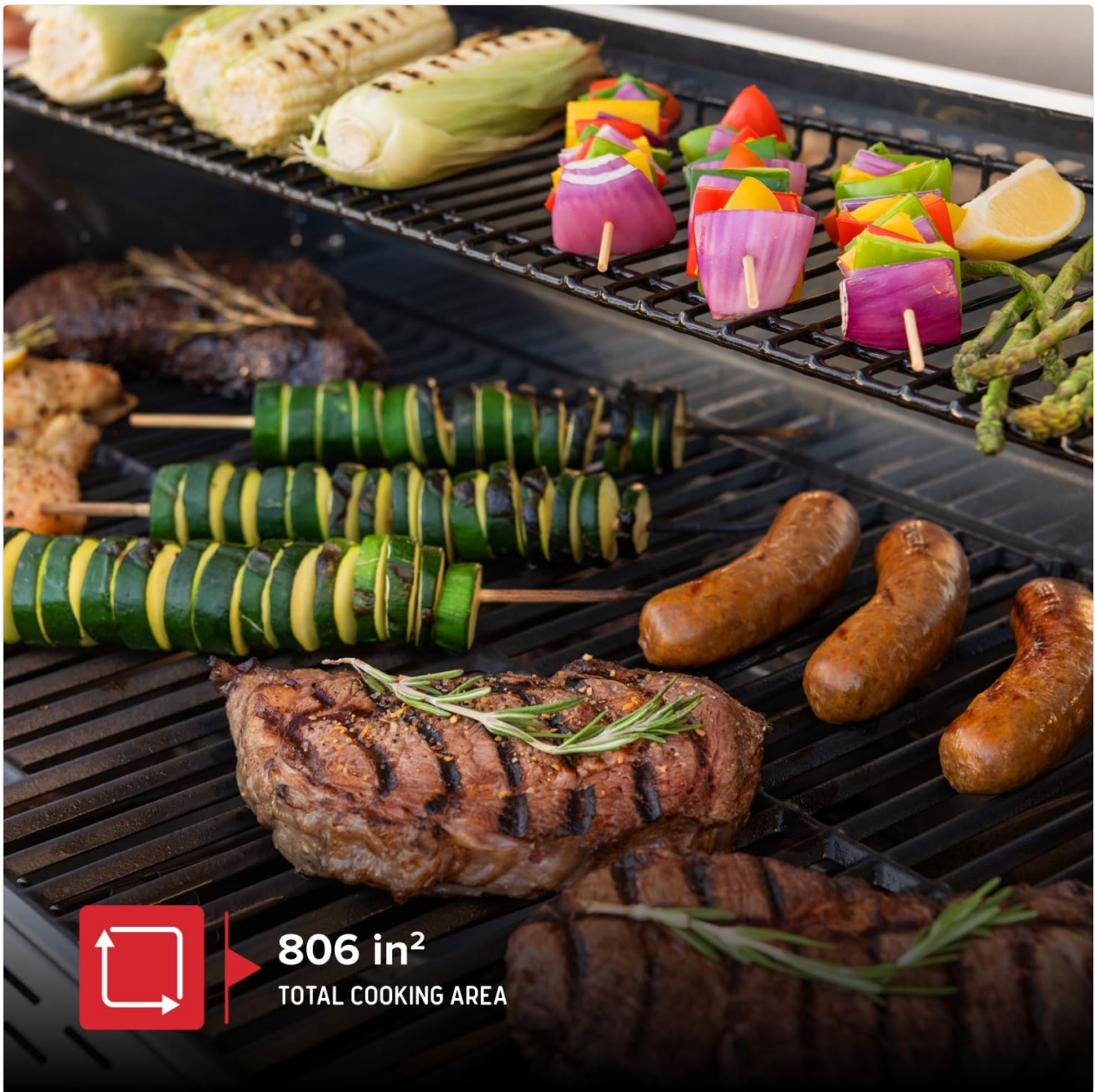
Figure 4.1: Total cooking area of 806 square inches.