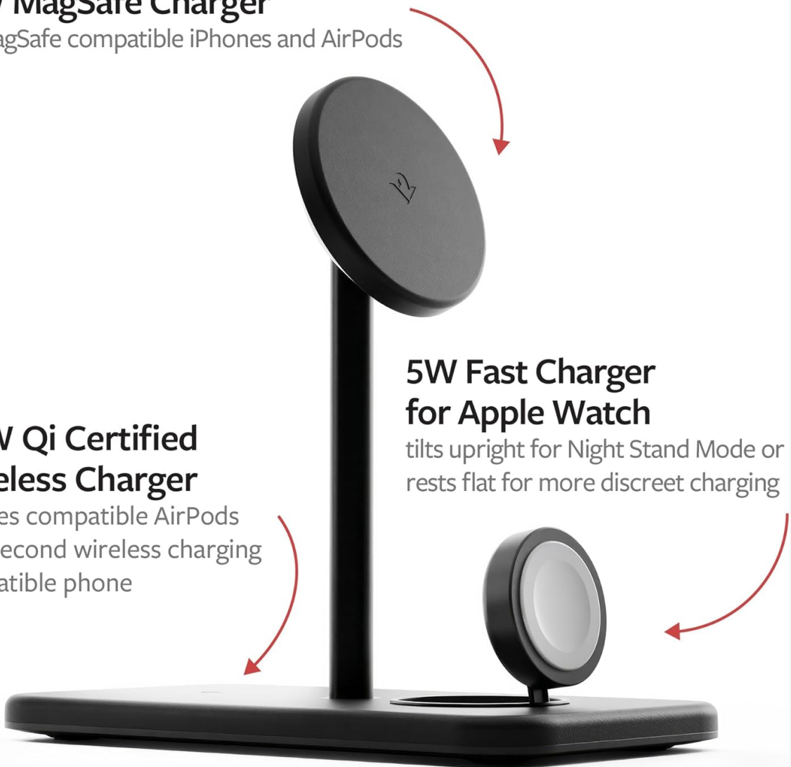
Image: A labeled diagram of the HiRise 3 Deluxe, highlighting the 15W MagSafe charger for iPhone, the 7.5W Qi wireless charger for AirPods or a second phone, and the 5W fast charger for Apple Watch.

tilts upright for Night Stand Mode or rests flat for more discreet charging