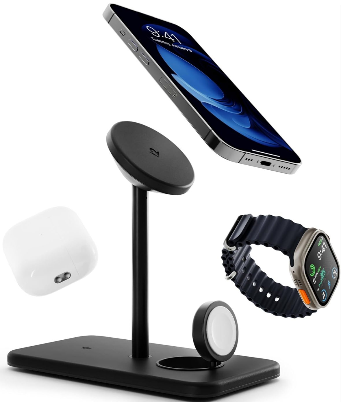
Image: The Twelve South HiRise 3 Deluxe charging stand, showcasing its ability to charge an iPhone, Apple Watch, and AirPods simultaneously.