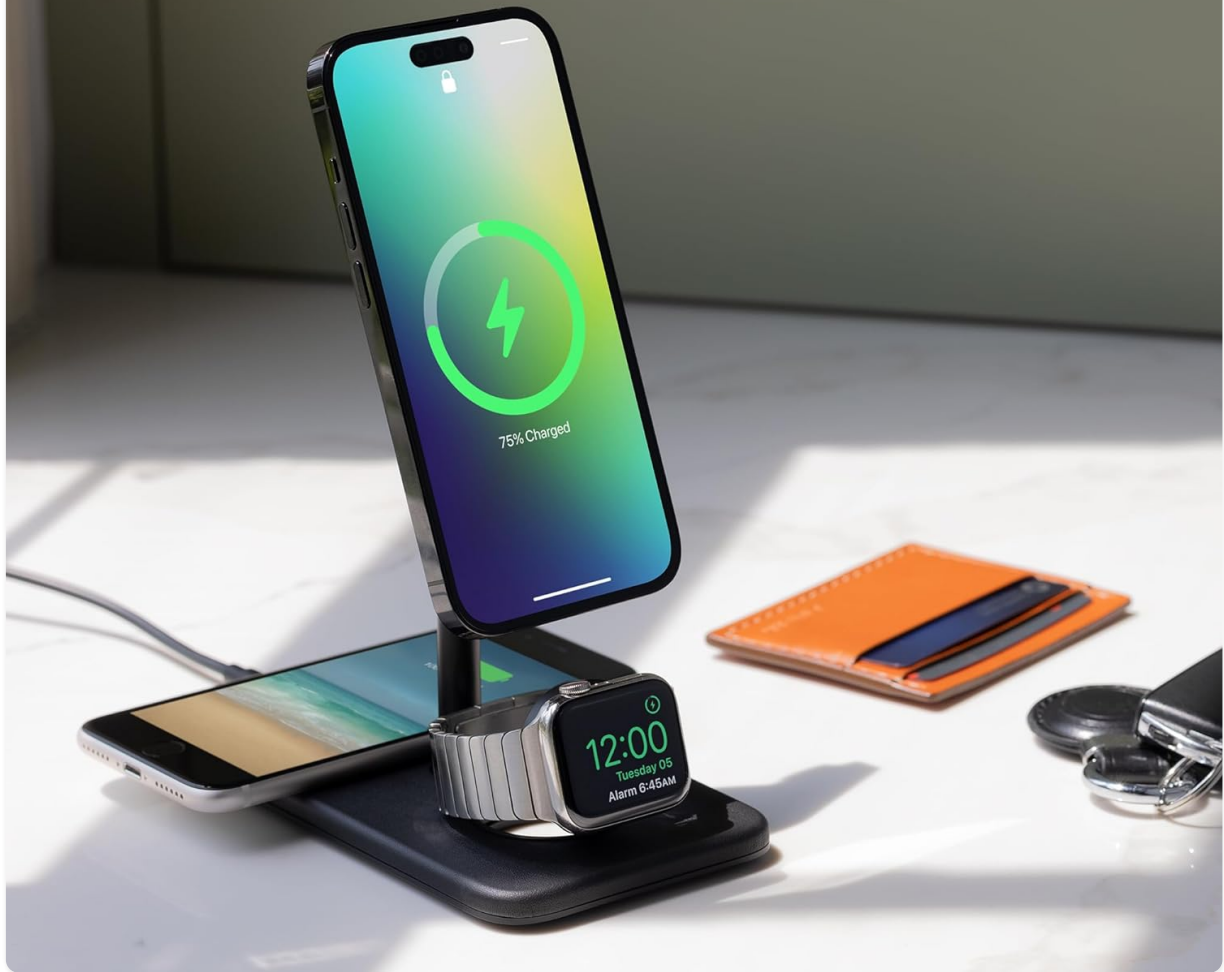
Image: The HiRise 3 Deluxe simultaneously charging an iPhone, Apple Watch, and a second smartphone on its base, highlighting its versatile charging options.

Charge your AirPods - or even a second phone, on the 7.5W Qi charger on the base.