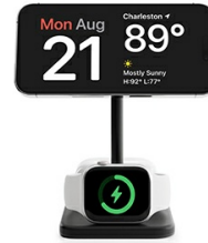
Image: A diagram demonstrating the 35-degree adjustable tilt of the MagSafe charger, allowing for both vertical and horizontal iPhone placement and optimized viewing angles.