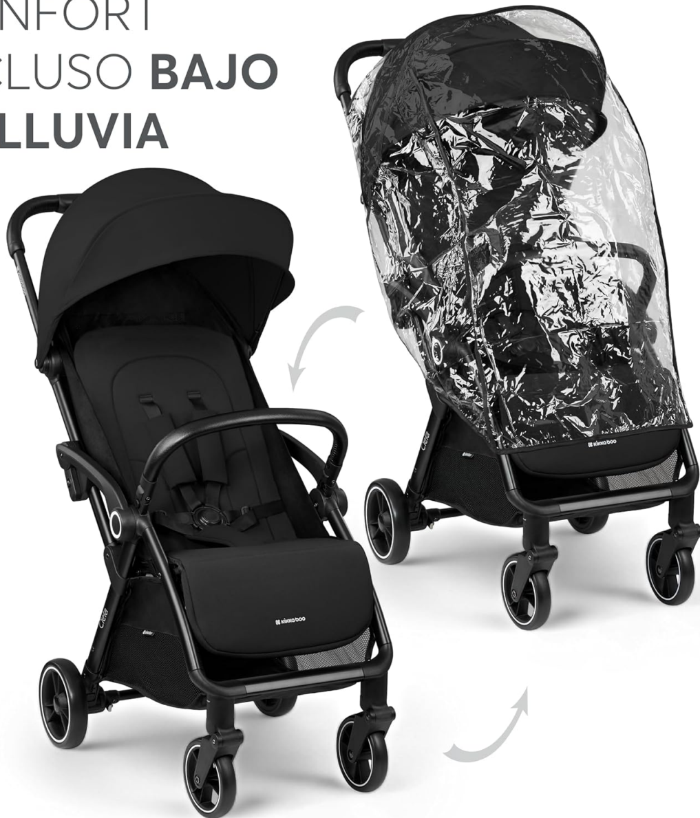
Figure 6: Kikkaboo Ciela Stroller features: canopy, comfortable seat, and storage basket. A close-up view of key features of the Kikkaboo Ciela Stroller, including the adjustable canopy with sun visor, the comfortable seating area for the baby, and the spacious storage basket located beneath the seat.