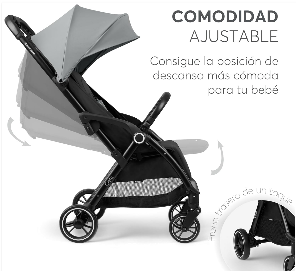
Figure 5: Kikkaboo Ciela Stroller backrest adjustment mechanism. A side view of the Kikkaboo Ciela Stroller illustrating the adjustable backrest. Arrows indicate the range of motion, demonstrating how the backrest can be reclined to different positions for the child's comfort.