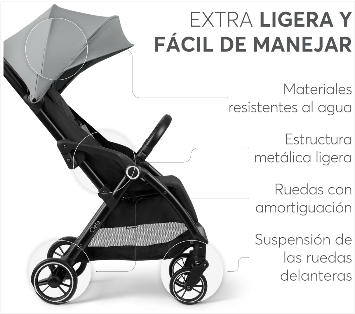
Figure 7: Kikkaboo Ciela Stroller highlighting lightweight frame and wheel suspension. A detailed side view of the Kikkaboo Ciela Stroller, pointing out its lightweight metallic frame, water-resistant materials, and the suspension system on its wheels, particularly the front wheels, for a smooth ride.

it is clean and dry before storing to prevent mold or mildew.