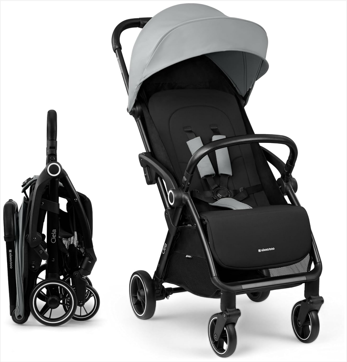
Figure 1: Kikkaboo Ciela Stroller in unfolded and folded positions. This image displays the Kikkaboo Ciela Stroller in two states: fully unfolded and ready for use, and compactly folded for storage or transport. The unfolded stroller shows the seat, canopy, and wheels, while the folded version highlights its space-saving design.