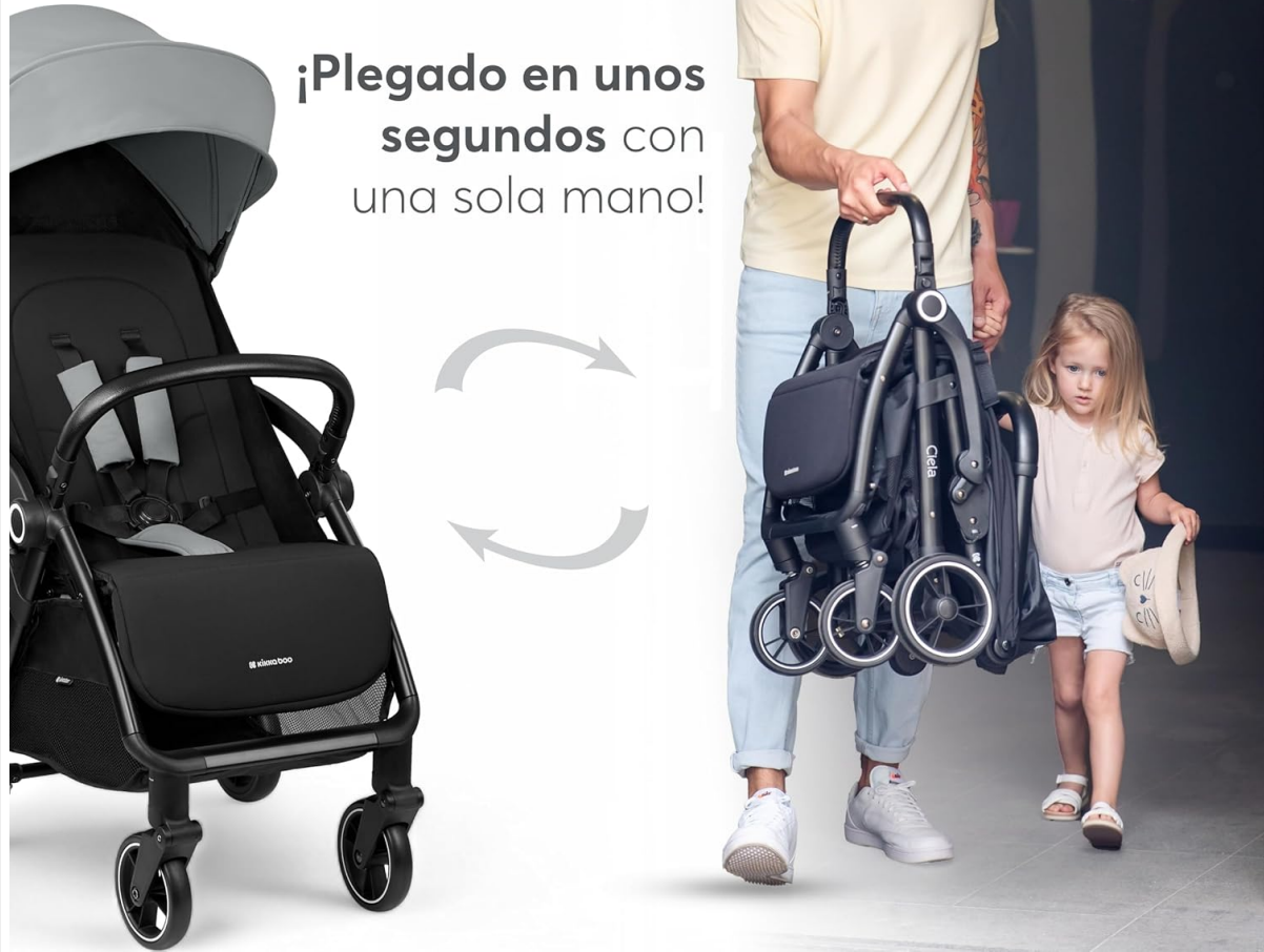
Figure 4: Man demonstrating one-hand folding of Kikkaboo Ciela Stroller. This image shows an adult easily folding the Kikkaboo Ciela Stroller with one hand, emphasizing its automatic and quick folding feature. A child stands nearby, indicating the stroller's portability.