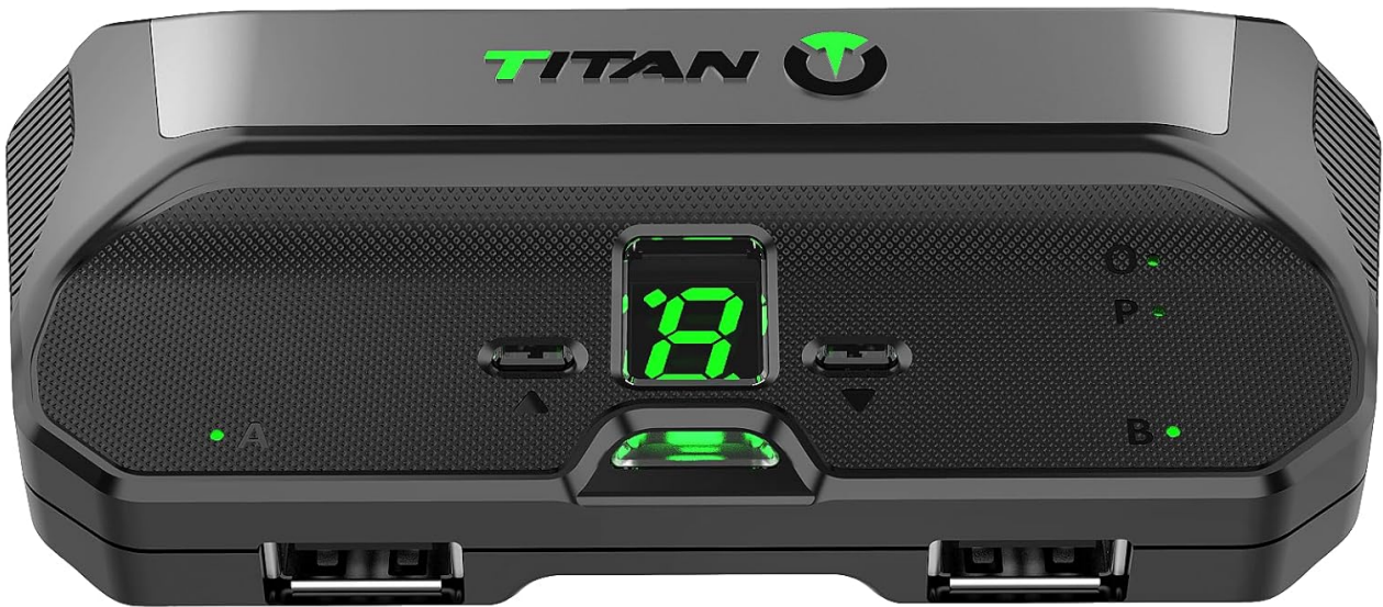
Image: Front view of the Titan Two device, displaying its central digital readout and multiple USB ports for connecting peripherals.