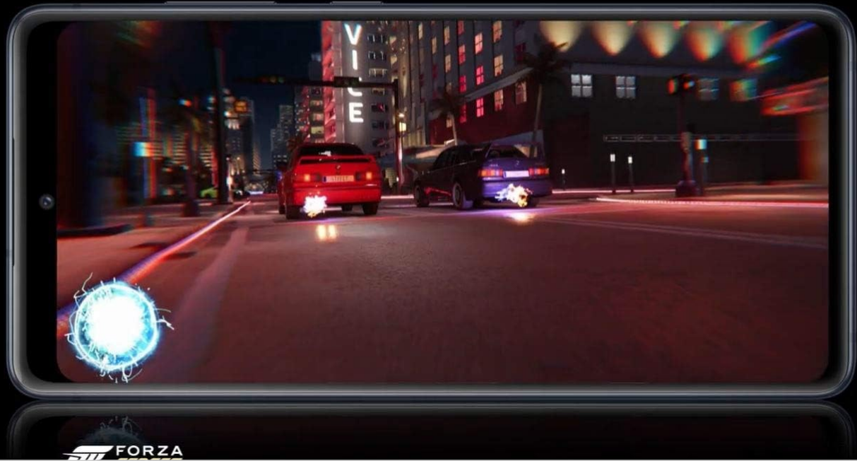
Figure 3.3: The device supports HyperFast 5G connectivity for enhanced performance.

When you're connected to the network with Galaxy S20 FE 5G, you can game on in real time with little lag, download at lightning fast speeds and experience crystal clear video calls.