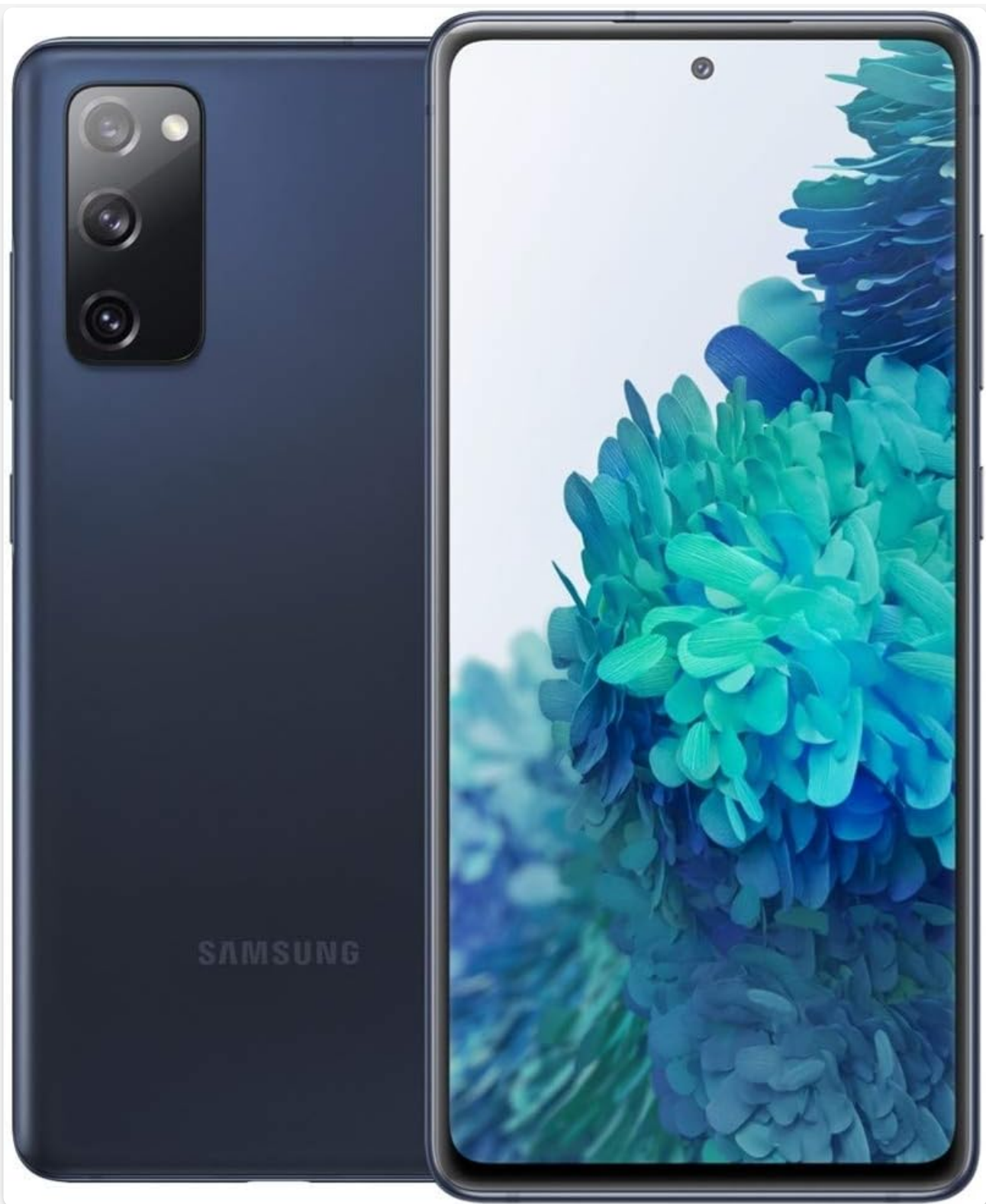
Figure 1.1: Front and back view of the SAMSUNG Galaxy S20 FE 5G smartphone.