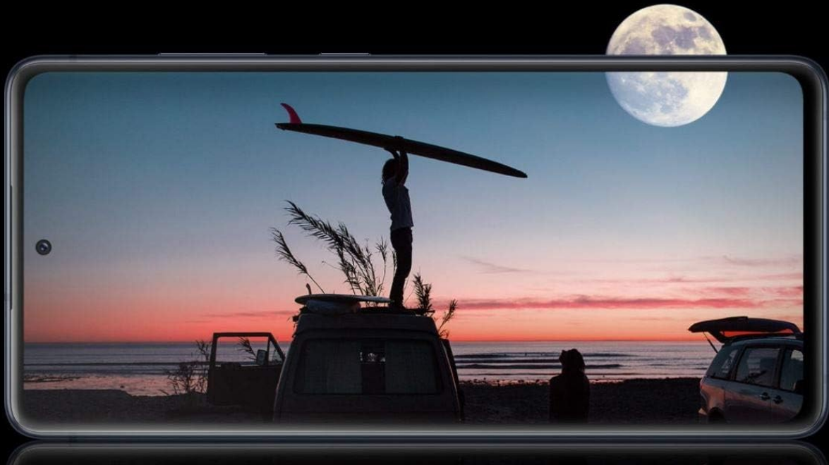
Figure 3.4: The 4500mAh battery is designed for all-day use.

Live your life without worrying where you can plug in your phone. The 4500mAh (typical) battery has the power to outlast your day and the intelligence to save power for the things you do most.