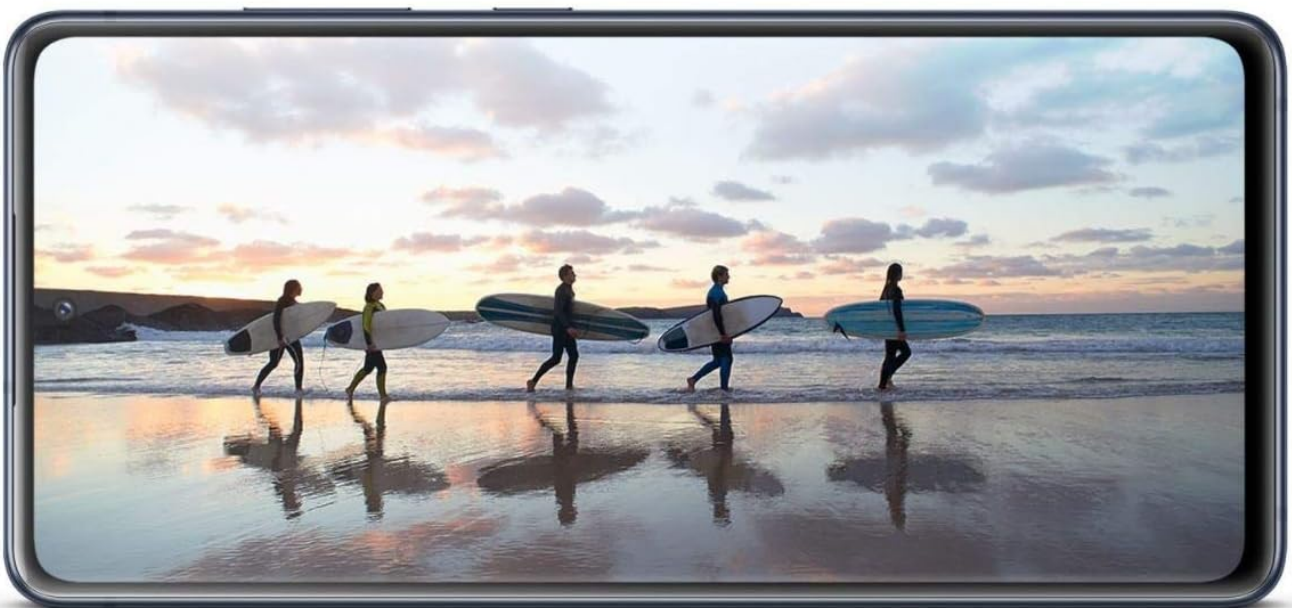
Figure 3.1: The Infinity-O Display provides an immersive viewing experience.

With barely-there bezels and a super small punch hole for the camera, the 6.5" FHD Infinity-O Display lets you dive into gaming, streaming and video calling without anything blocking your view.