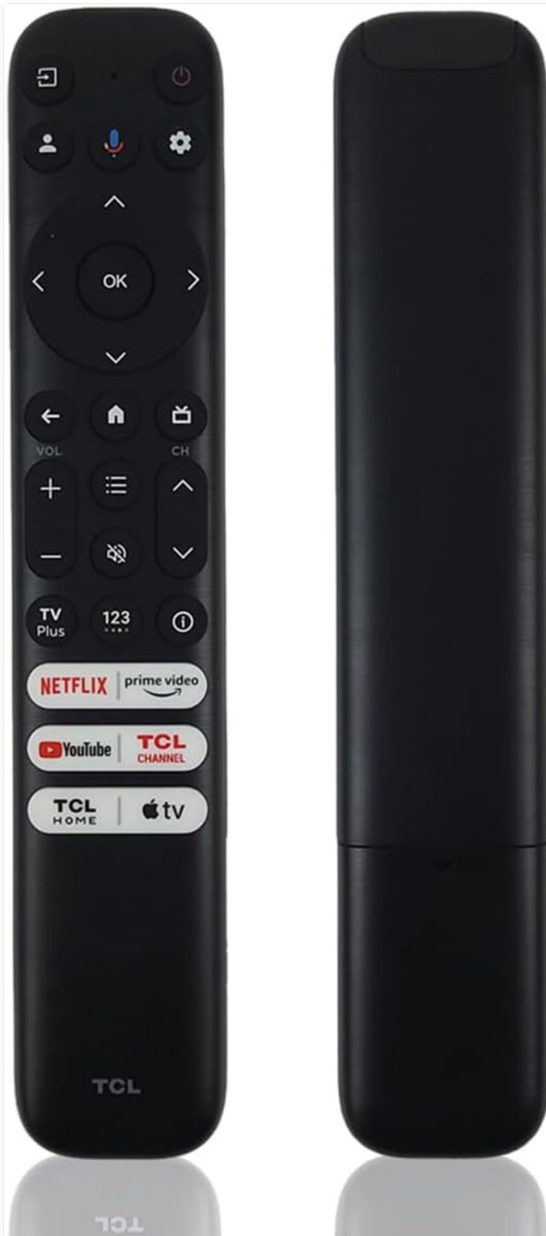
Figure 1: Front and back view of the Ceybo RC813 FMB1 Voice Remote Control. The front features various buttons including navigation, volume, channel, and dedicated app shortcuts. The back is smooth and ergonomic.