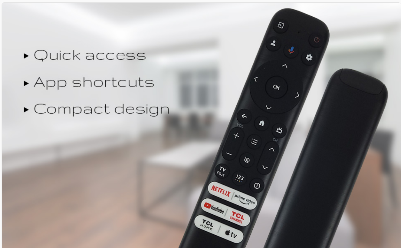
Figure 3: The remote's design emphasizes quick access, app shortcuts, and a compact form factor for ease of use.

The RC813 FMB1 remote control features a variety of buttons for intuitive navigation and control of your TCL Smart TV. Refer to the image below for button layout.