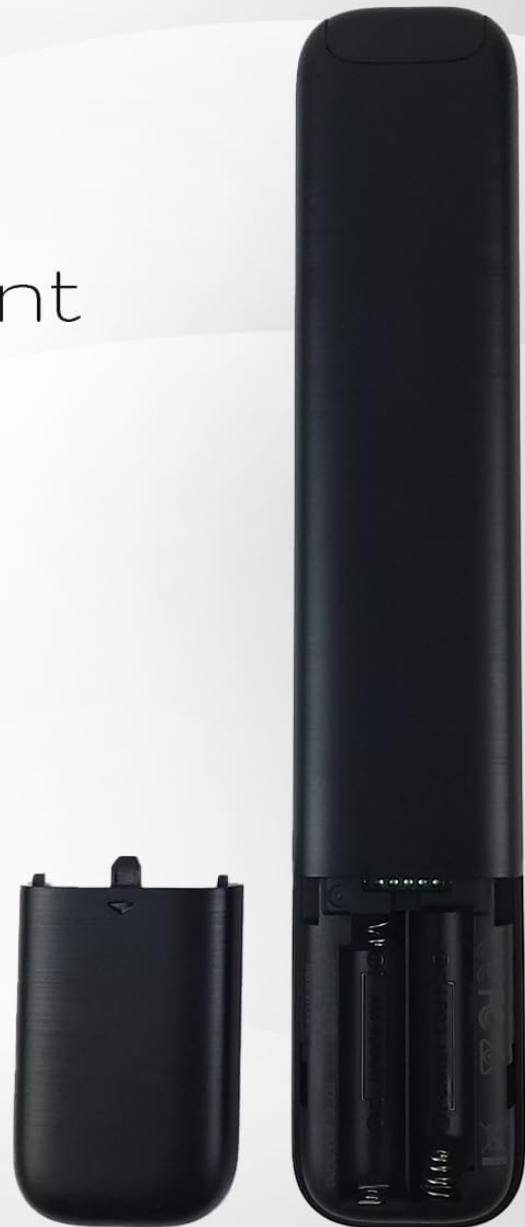
Figure 2: Illustration of the battery compartment and proper insertion of AAA batteries.