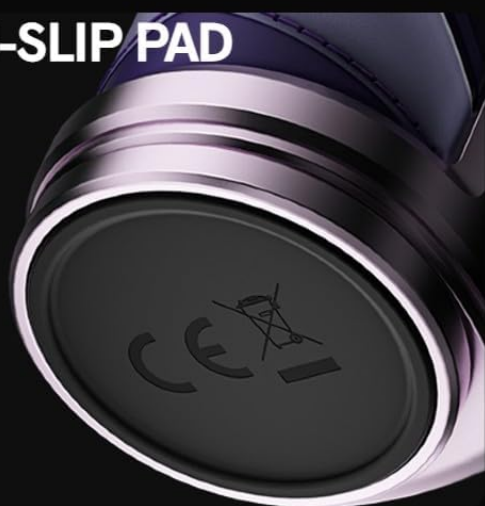
Image: Details of the ARGUS Pro 2's integrated design, classic leather streamlined body, and anti-slip pad.