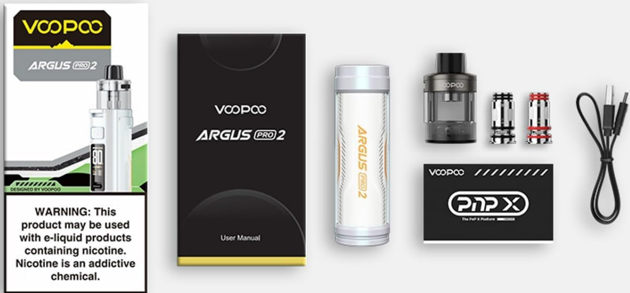
Image: All components included in the VOOPOO ARGUS Pro 2 Vape Pod Kit packaging.