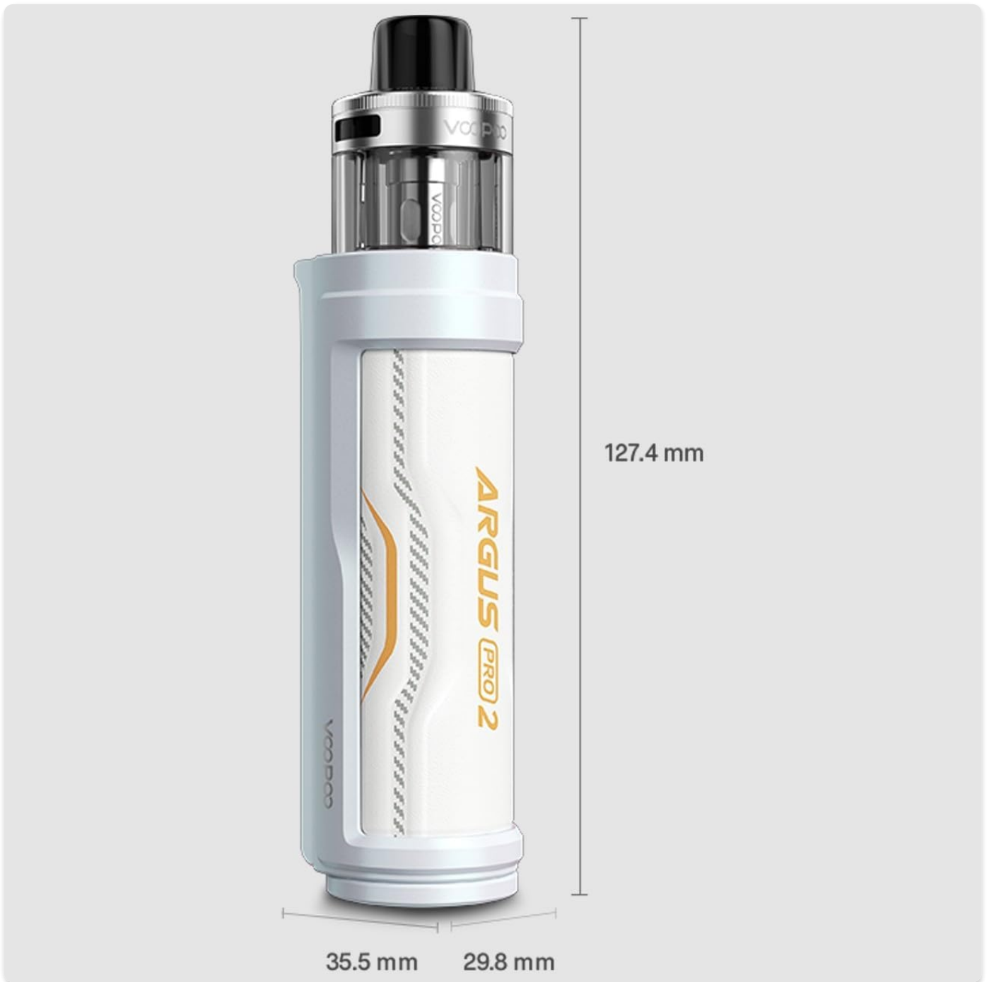
Image: Detailed dimensions of the VOOPOO ARGUS Pro 2 device.