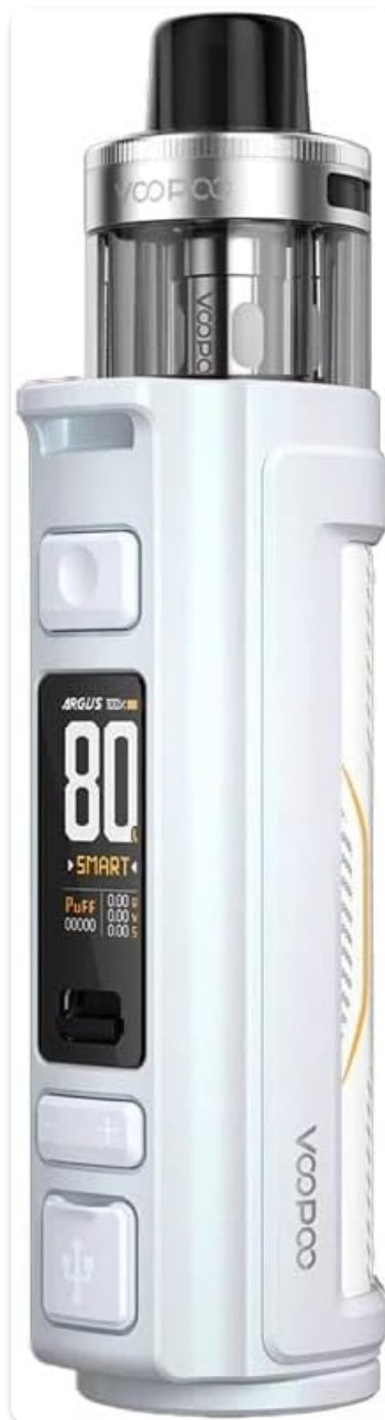
Image: The VOOPOO ARGUS Pro 2 Vape Pod Kit in Pearl White, showcasing its sleek design and display screen.