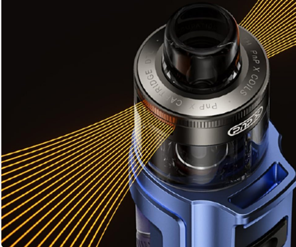
Image: Diagram illustrating the top airflow intake system of the ARGUS Pro 2, designed to prevent leaks.

The distinctive top-airflow design effectively controls e-liquid and condensate leaking, which also brings a long aftertaste and lasting flavor combined with PnP X coils.