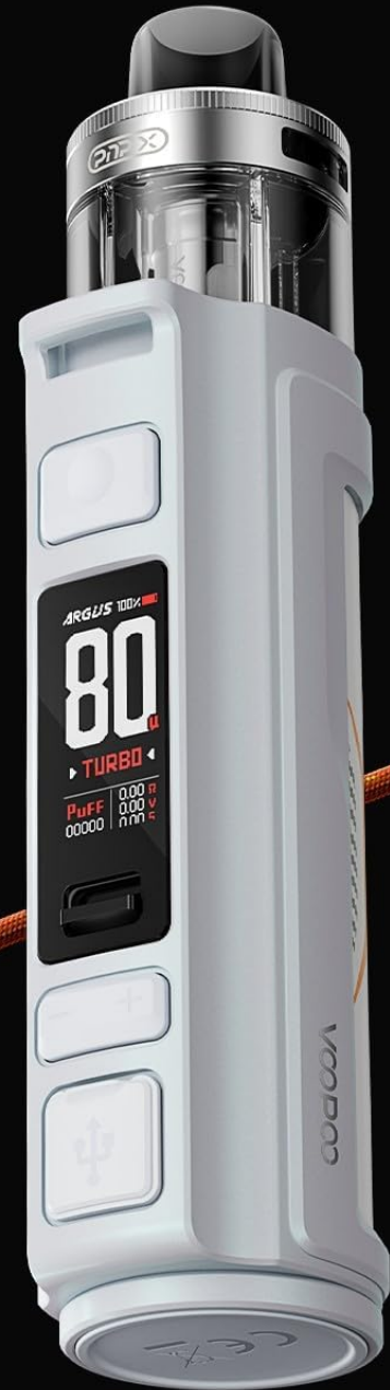
Image: Visual representation of the ARGUS Pro 2's Turbo Mode, 80W maximum output, and 3000mAh battery capacity.

Built-in battery brings an uninterrupted vaping journey