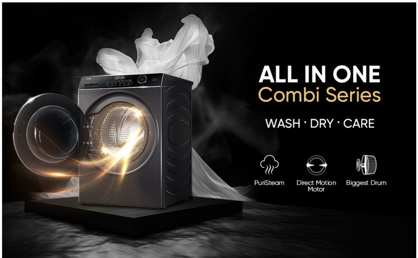
Image: Overview of the Haier washer dryer, highlighting its 5-year comprehensive warranty, 12-year motor warranty, PuriSteam, Direct Motion Motor, and AI DBT technology.