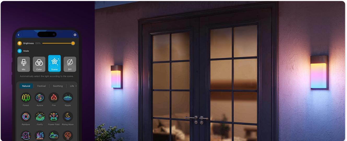
Image: Govee Home App interface demonstrating color and brightness controls for the wall light.