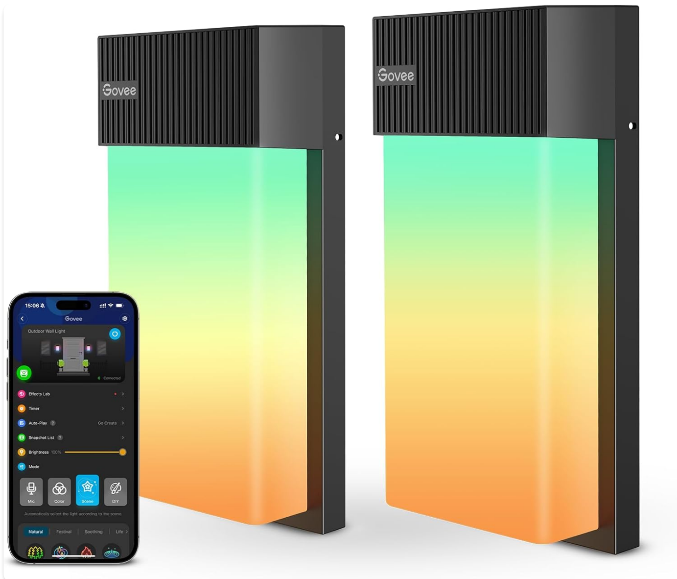
Image: Two Govee Outdoor Wall Lights shown alongside a smartphone displaying the Govee Home App, highlighting smart control capabilities.