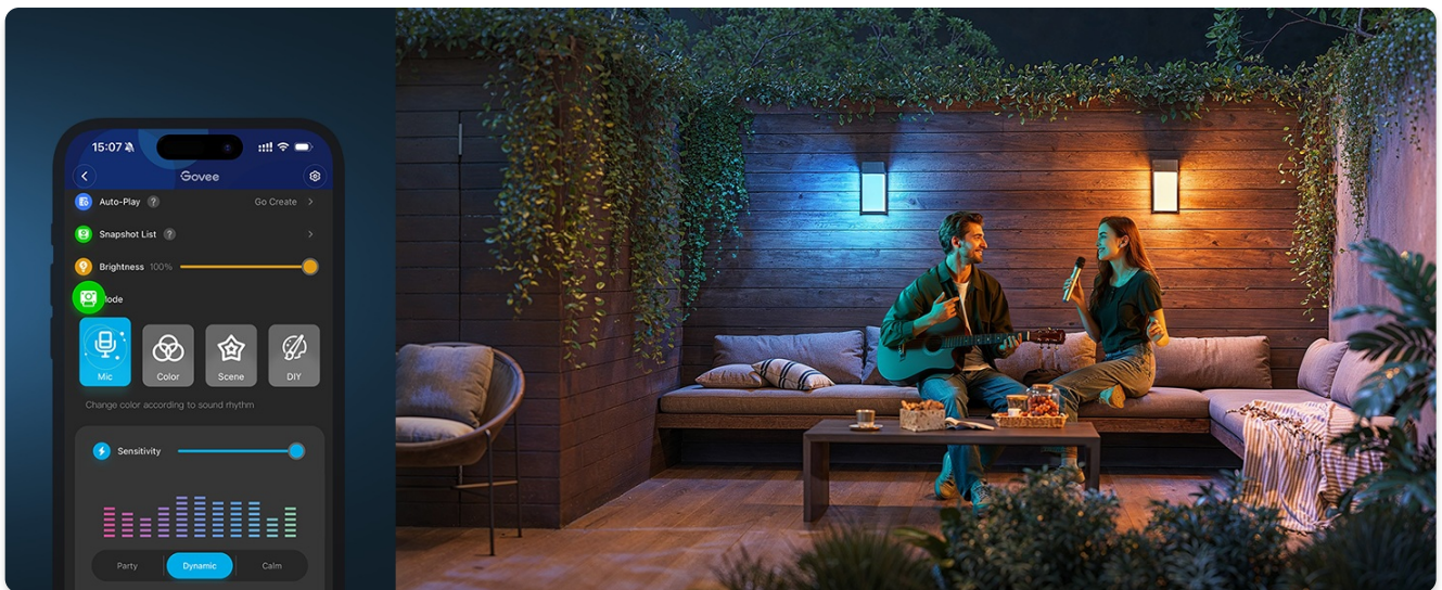
Image: Govee Home App illustrating the DIY customization feature for multi-color display.

5. Voice Control: Integrate with Alexa, Google Assistant, and Matter for convenient voice commands.