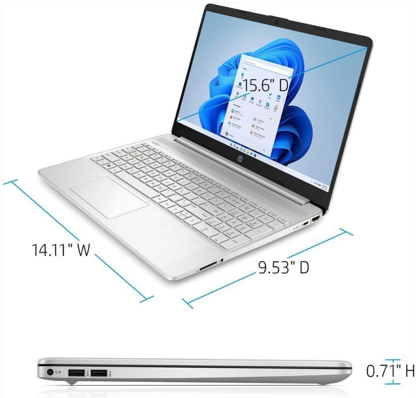
Figure 3: Laptop dimensions.