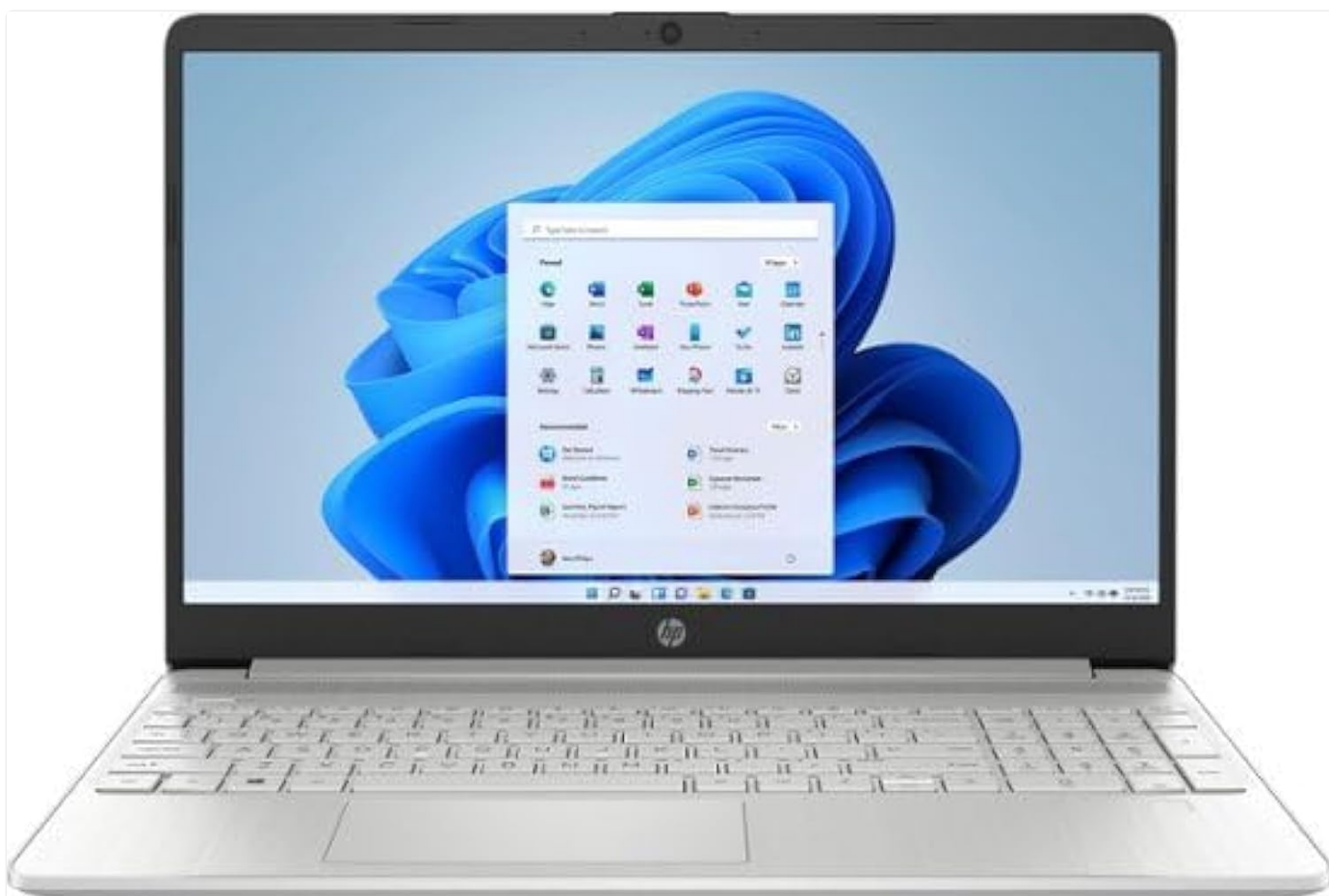
Figure 1: Front view of the HP 15.6" Touch-Screen Laptop.

This manual provides essential information for setting up, operating, and maintaining your HP 15.6" Touch-Screen Laptop, model 15-DY5033DX. Designed for efficiency and portability, this laptop features an Intel 12th Generation Core i3 processor, 8GB of memory, a 256GB SSD, and runs on Windows 11 Home in S mode. Its touch-screen display enhances user interaction for various tasks.