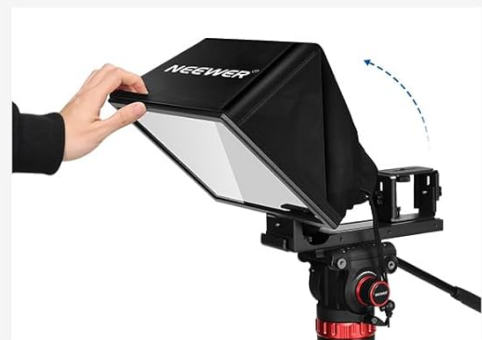
3 Unfold it and use

Image: A visual guide illustrating the three simple steps for setting up the NEEWER X12B Teleprompter: removing it from the case, mounting it to a tripod, and unfolding it for immediate use.