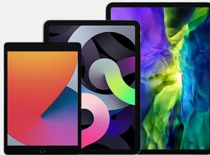
✓ Compatible with iPad / iPad Air / iPad Pro 11"