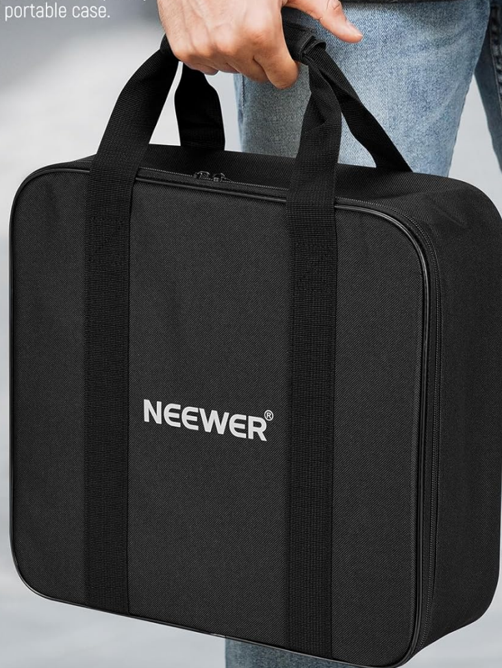
Image: The NEEWER X12B Teleprompter securely packed inside its portable carry case, demonstrating its compact storage and transport capabilities.

Protect and store the X12B teleprompter with the included portable case.