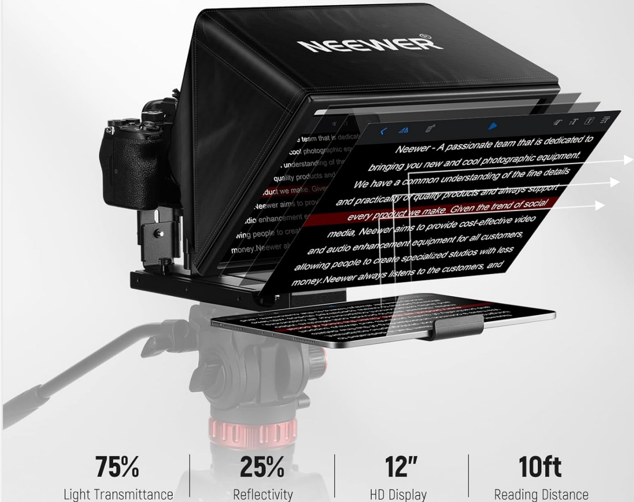
Image: Highlights the clear text reflection on the 12-inch HD display of the NEEWER X12B Teleprompter, detailing its 75% light transmittance, 25% reflectivity, and 10ft reading distance.

The multi coated glass ensures clear text reflection on the 12 inch high definition display.