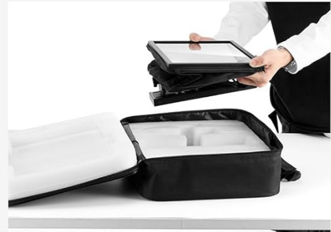
1 Remove from the case