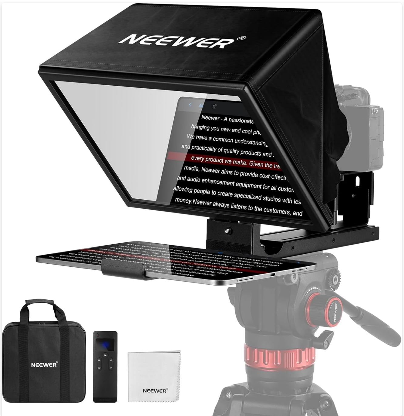
Image: The NEEWER Basics X12B Teleprompter setup, including a camera mounted behind the beam splitter glass, a tablet displaying text, the remote control, a cleaning cloth, and the portable carry bag.