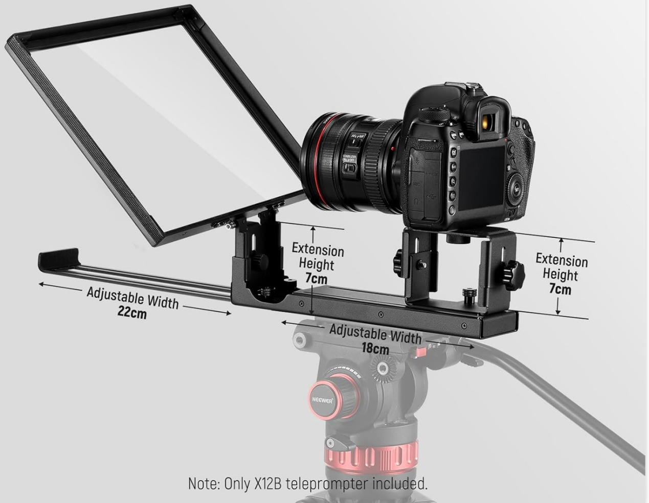
Image: A detailed view of the NEEWER X12B Teleprompter's adjustable platform, highlighting the adjustable width (22cm) and extension height (7cm) for precise camera positioning.

The adjustable aluminum alloy construction makes it suitable for various photography equipment by keeping the lens always centered.