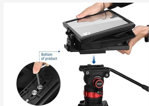
2 Mount it to a tripod via the bottom screw