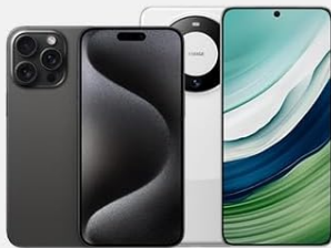
✓ Compatible with Smartphones