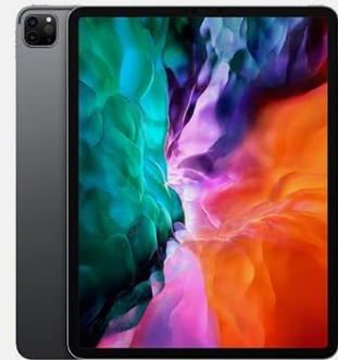
✗ Not compatible with iPad Pro 12.9"