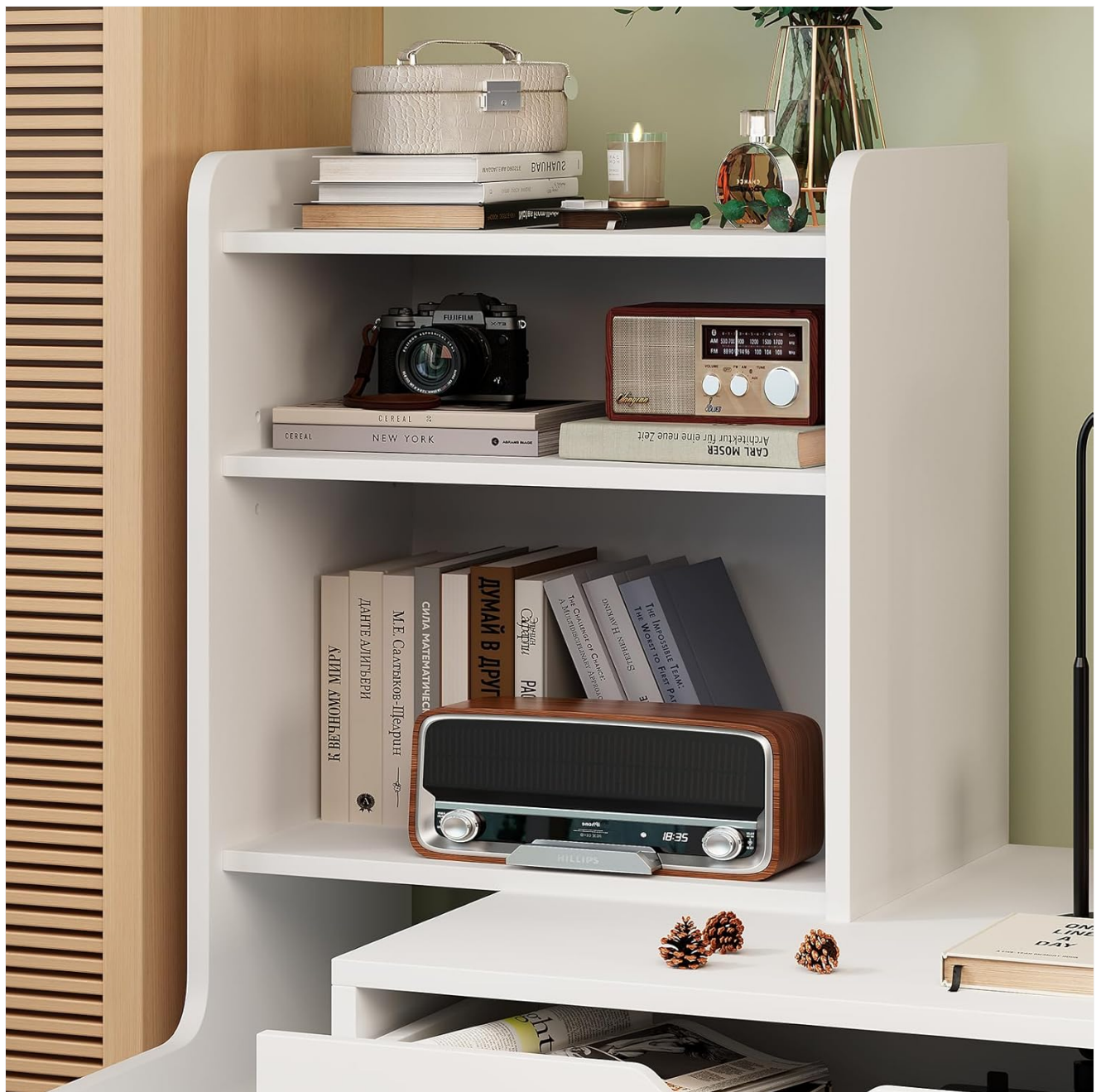
Image: A detailed view of the desk's integrated shelving unit, showing books and decorative items, demonstrating its storage capacity.