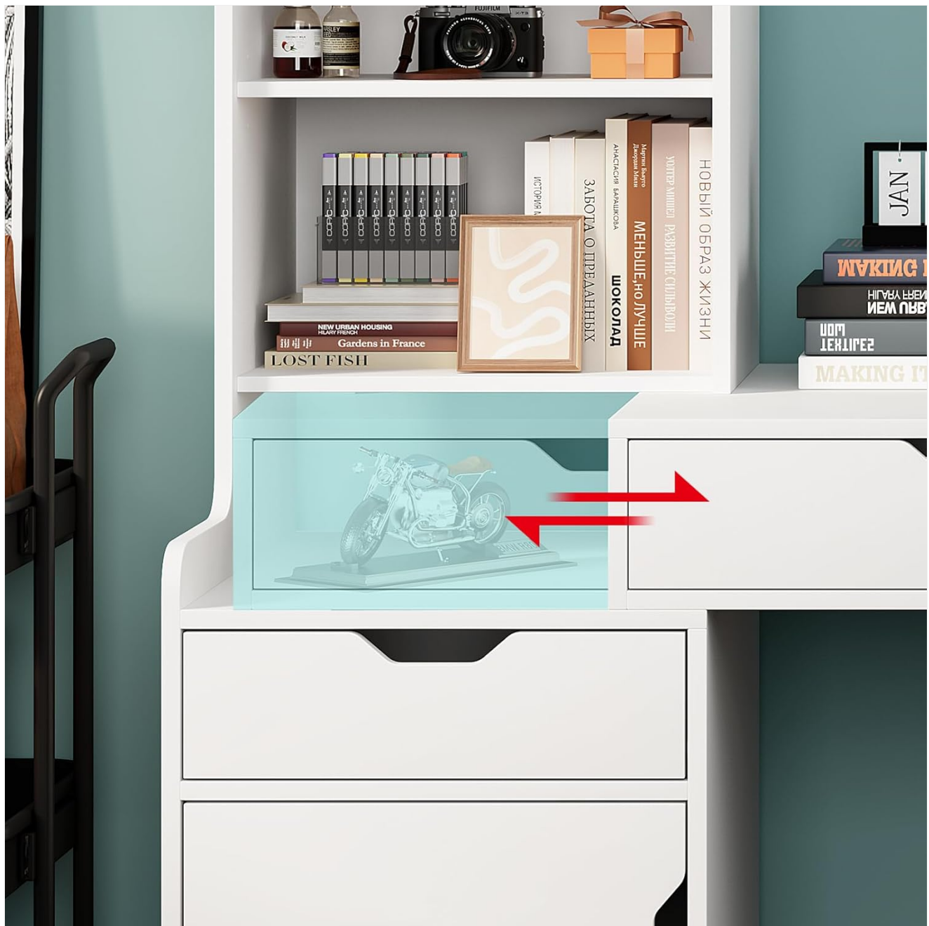
Image: A visual representation of the adjustable shelf within the storage unit, indicating its flexible design.