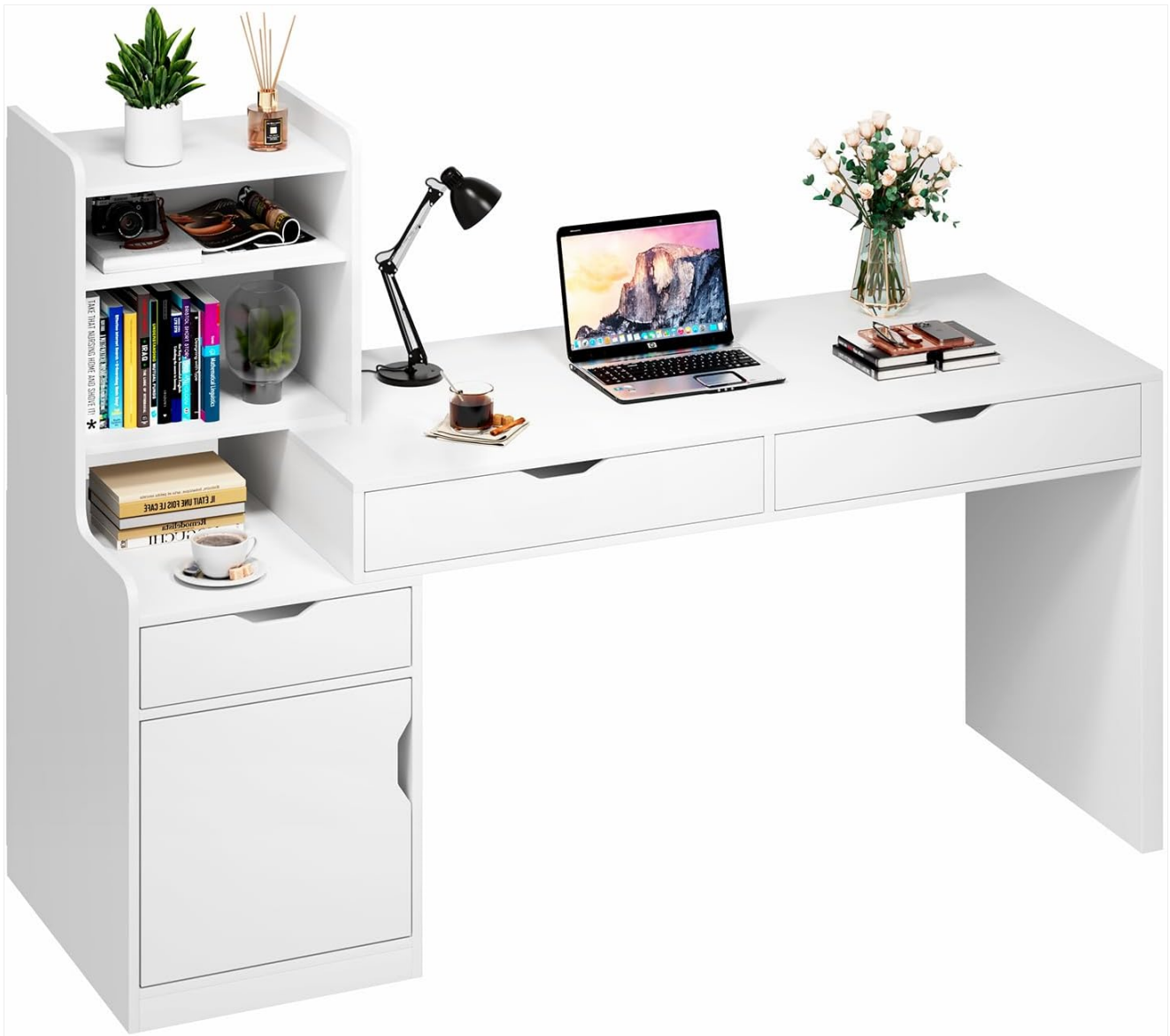
Image: The YOMILUVE Computer Desk, showcasing its spacious desktop, three drawers, and integrated shelving unit.