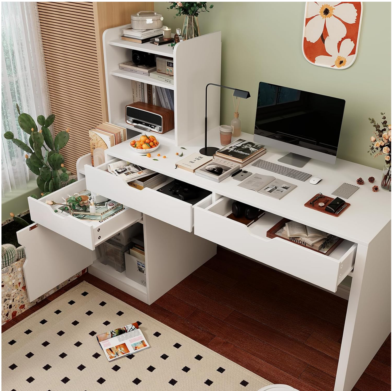
Image: The desk with its drawers pulled open, illustrating the available storage space for various items.