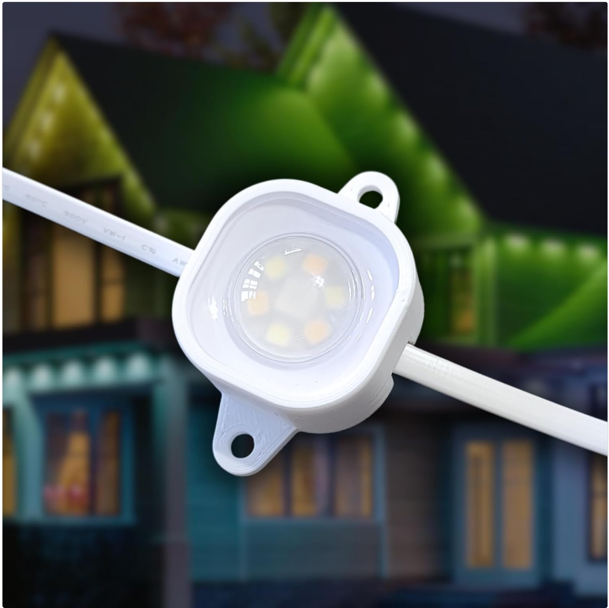
Figure 1: Govee PRO light secured with a mounting bracket.