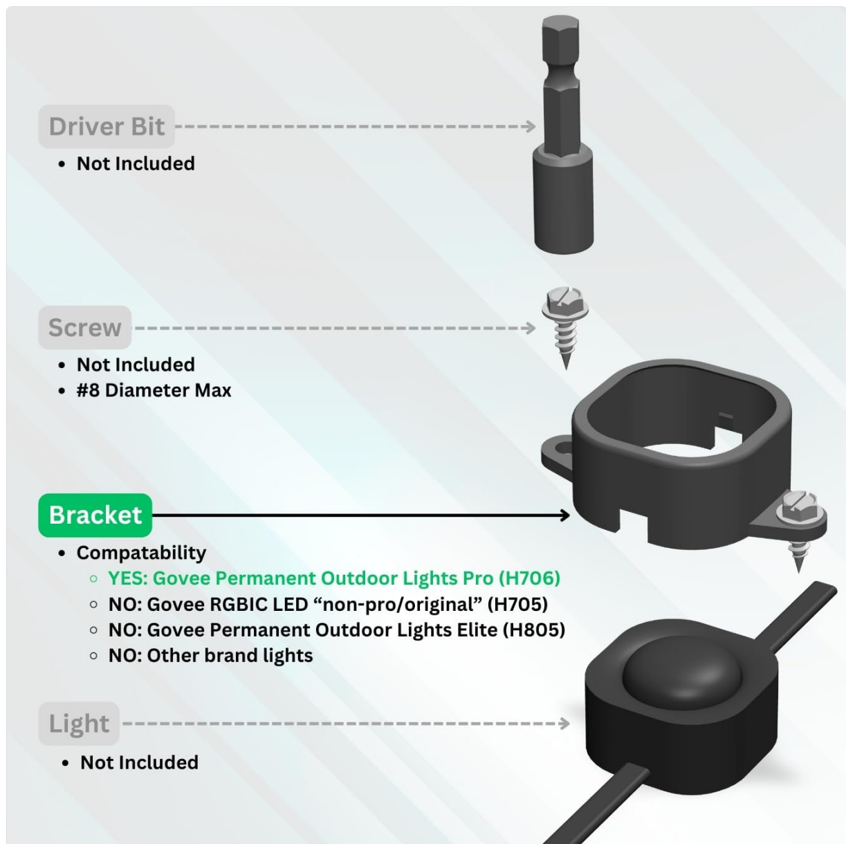
Figure 3: Components for installation, highlighting items not included.