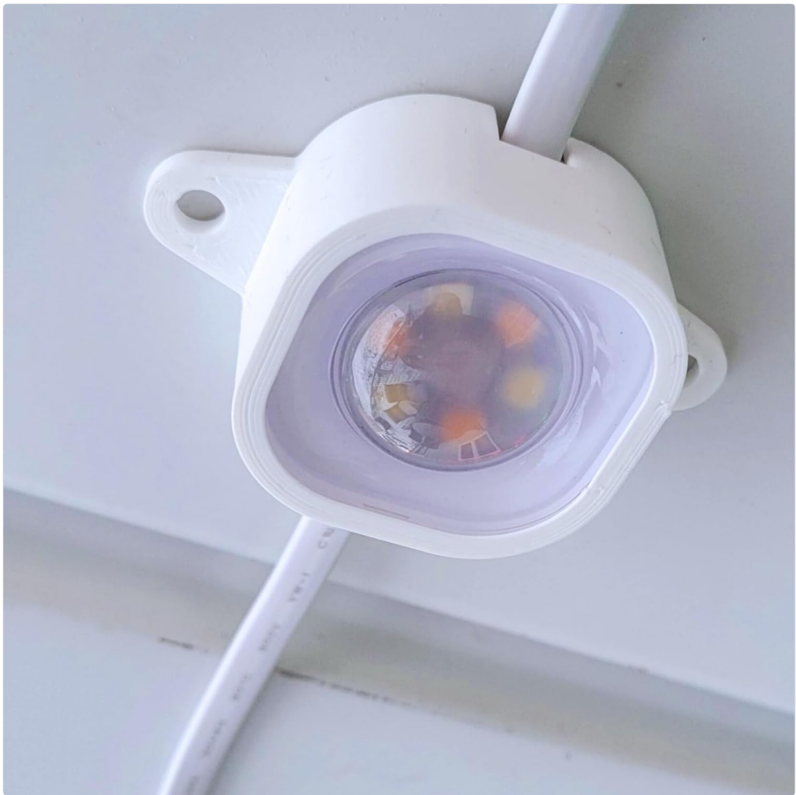
Figure 4: Bracket clipped onto a Govee light module.