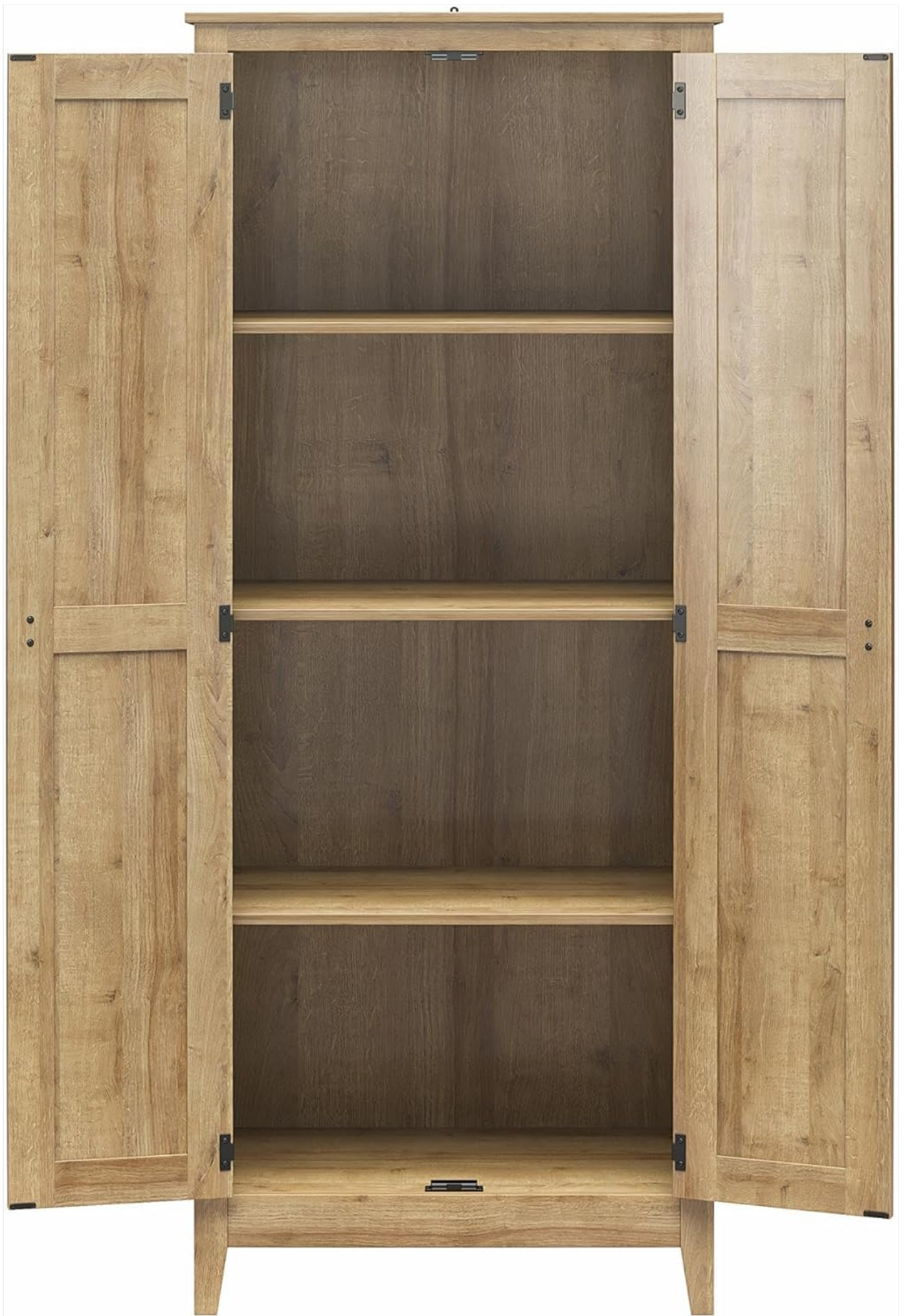
Figure 3.2: Interior view with empty shelves, demonstrating adjustable shelf positions.