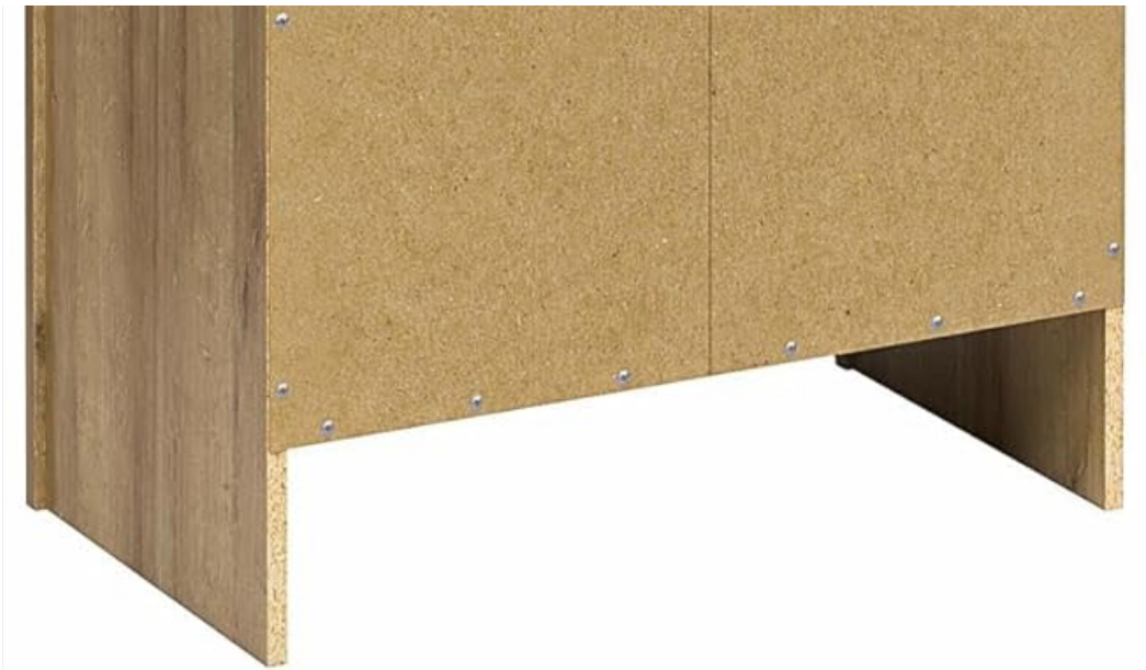
Figure 2.2: Rear view of the cabinet, indicating the area for wall anchor attachment.