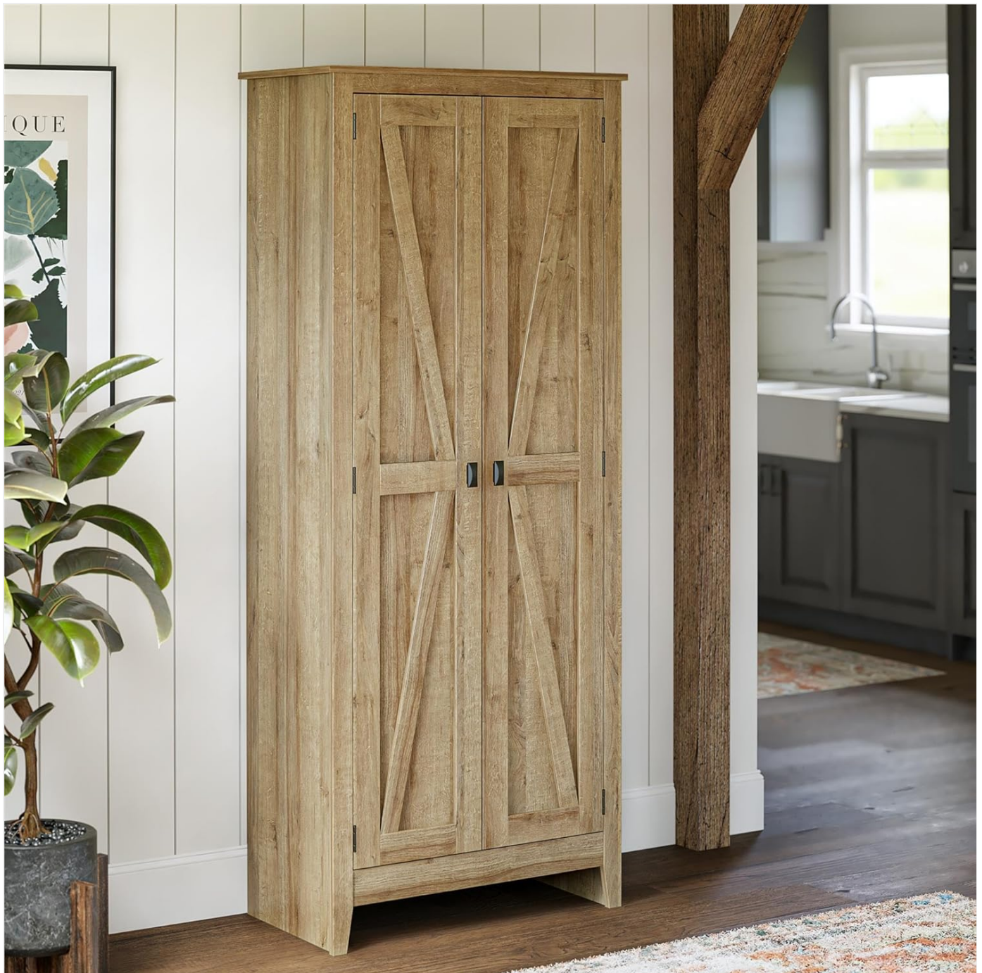
Figure 2.1: The assembled cabinet in a typical home environment.