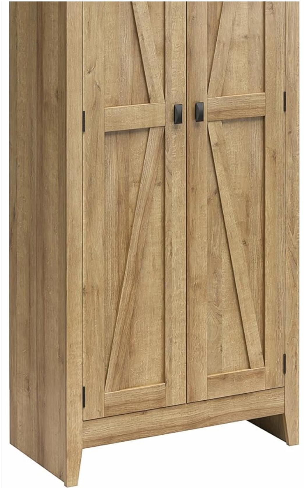
Figure 1.1: Front view of the SystemBuild Evolution Farmington Storage Cabinet.