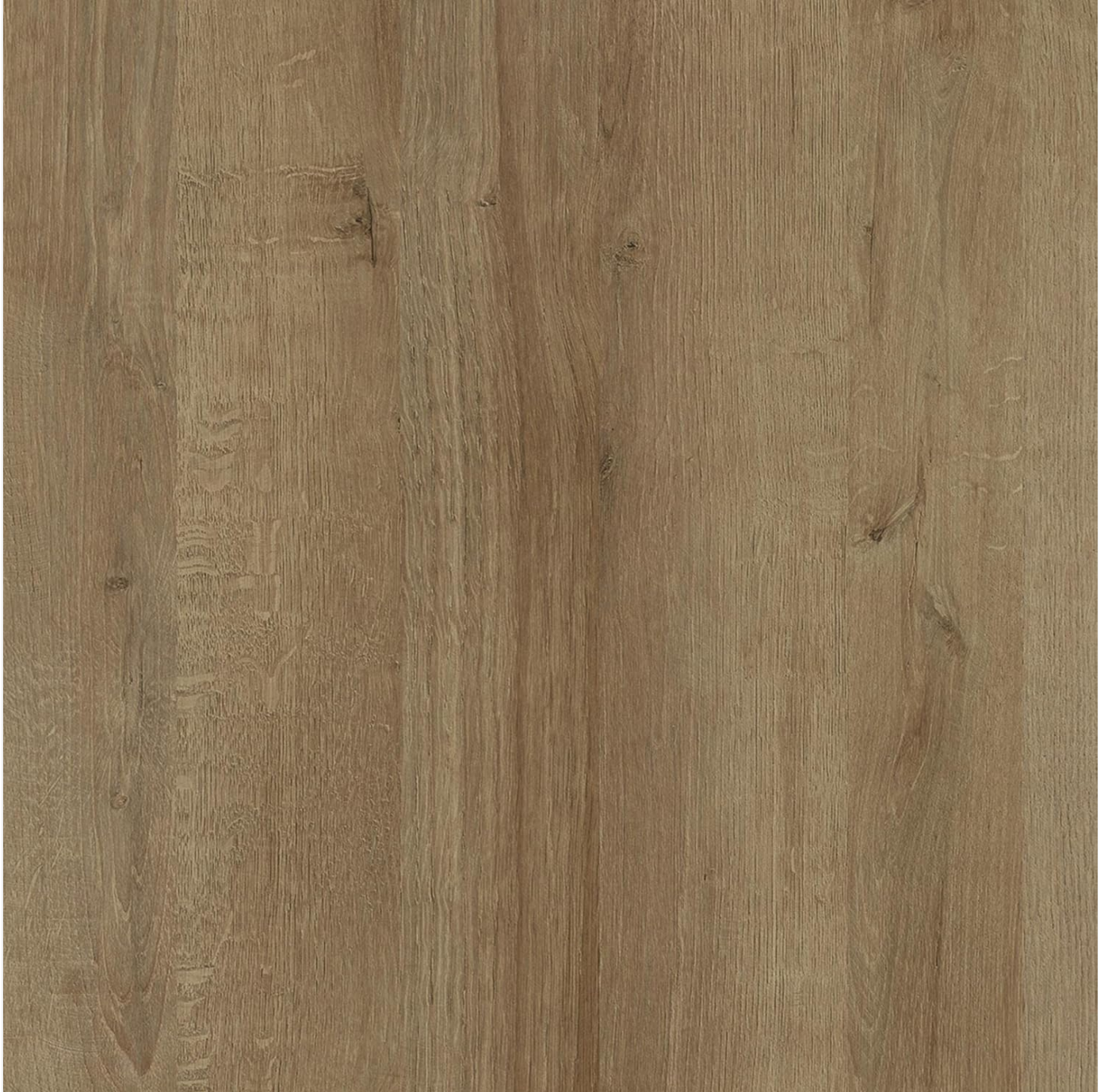
Figure 4.1: Detail of the Reclaimed Oak finish, highlighting the texture to be cared for.