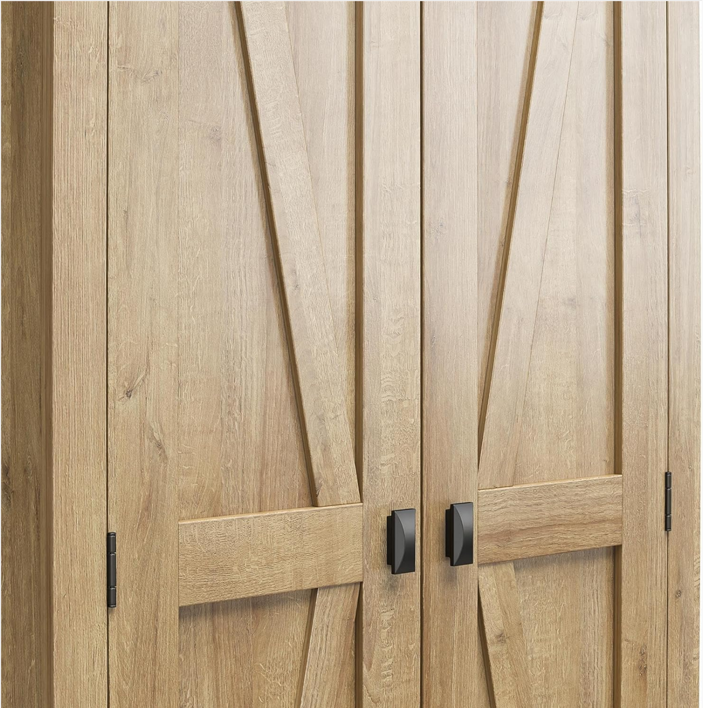
Figure 3.3: Detail of the cabinet doors and handles.