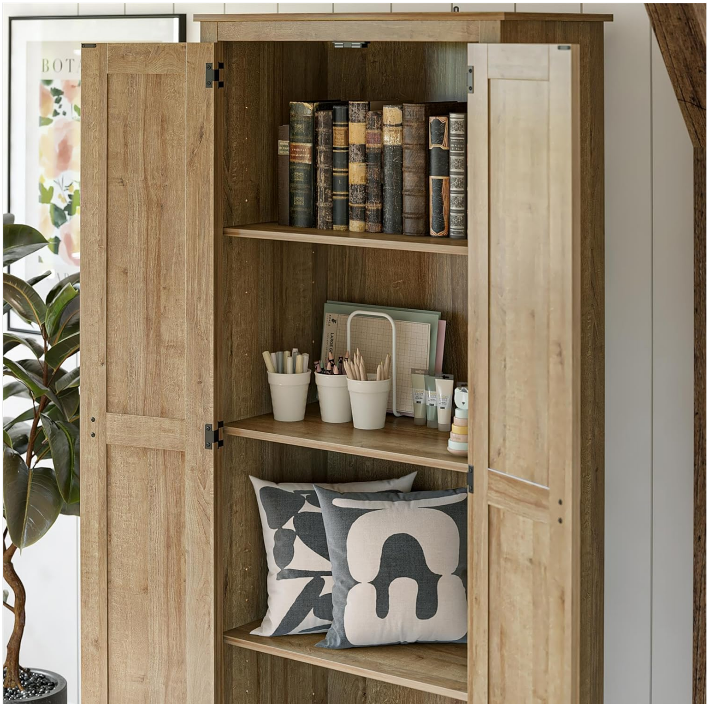
Figure 3.1: Interior view showcasing storage possibilities with items.