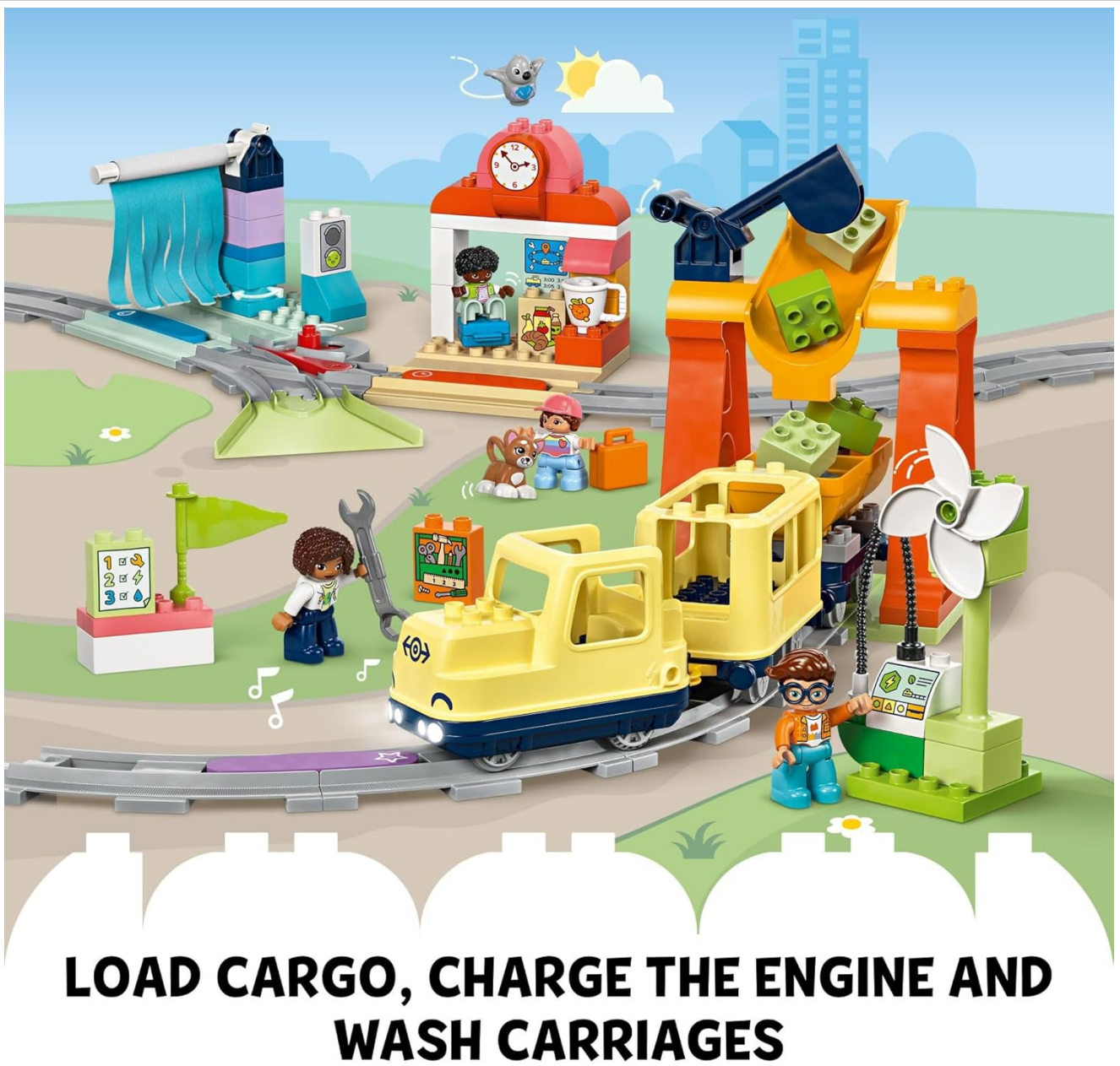
Figure 3.1: Interactive play elements including cargo loading and train wash.