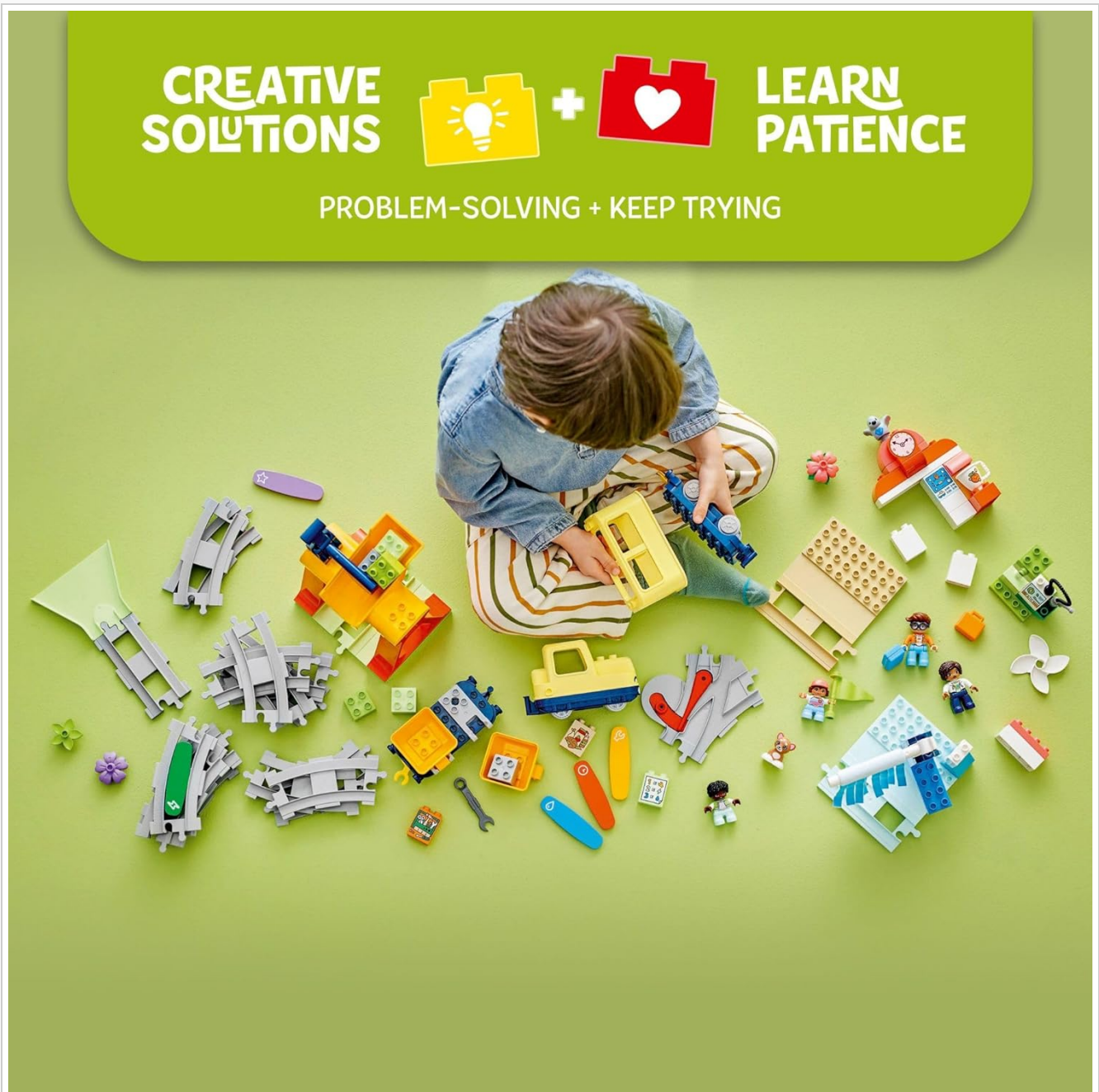
Figure 2.1: Unpacked components ready for assembly.