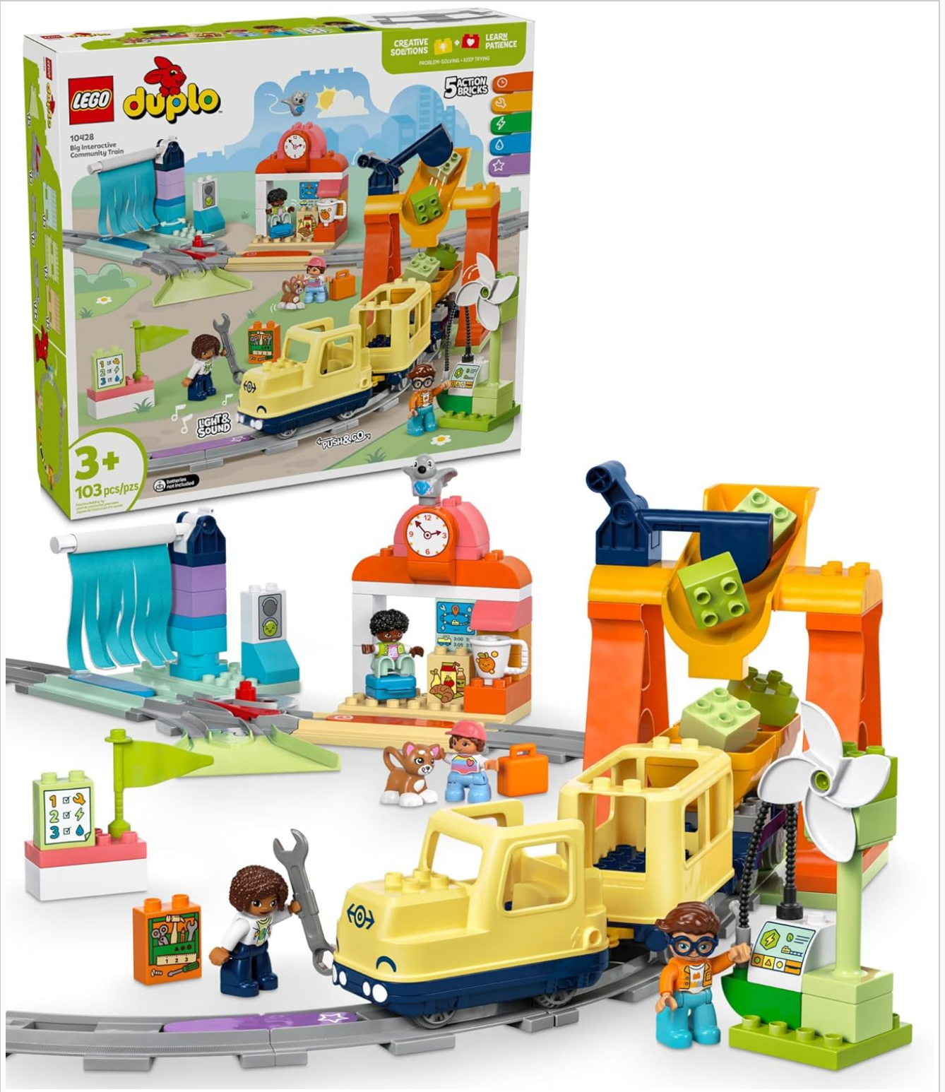
Figure 1.1: Complete LEGO DUPLO Town Big Interactive Community Train Set.