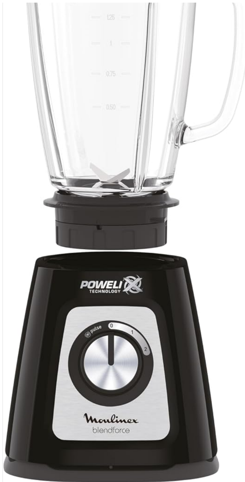
Image 3.1: Exploded view showing the motor unit, glass jar, blade assembly, lid, and measuring cup.