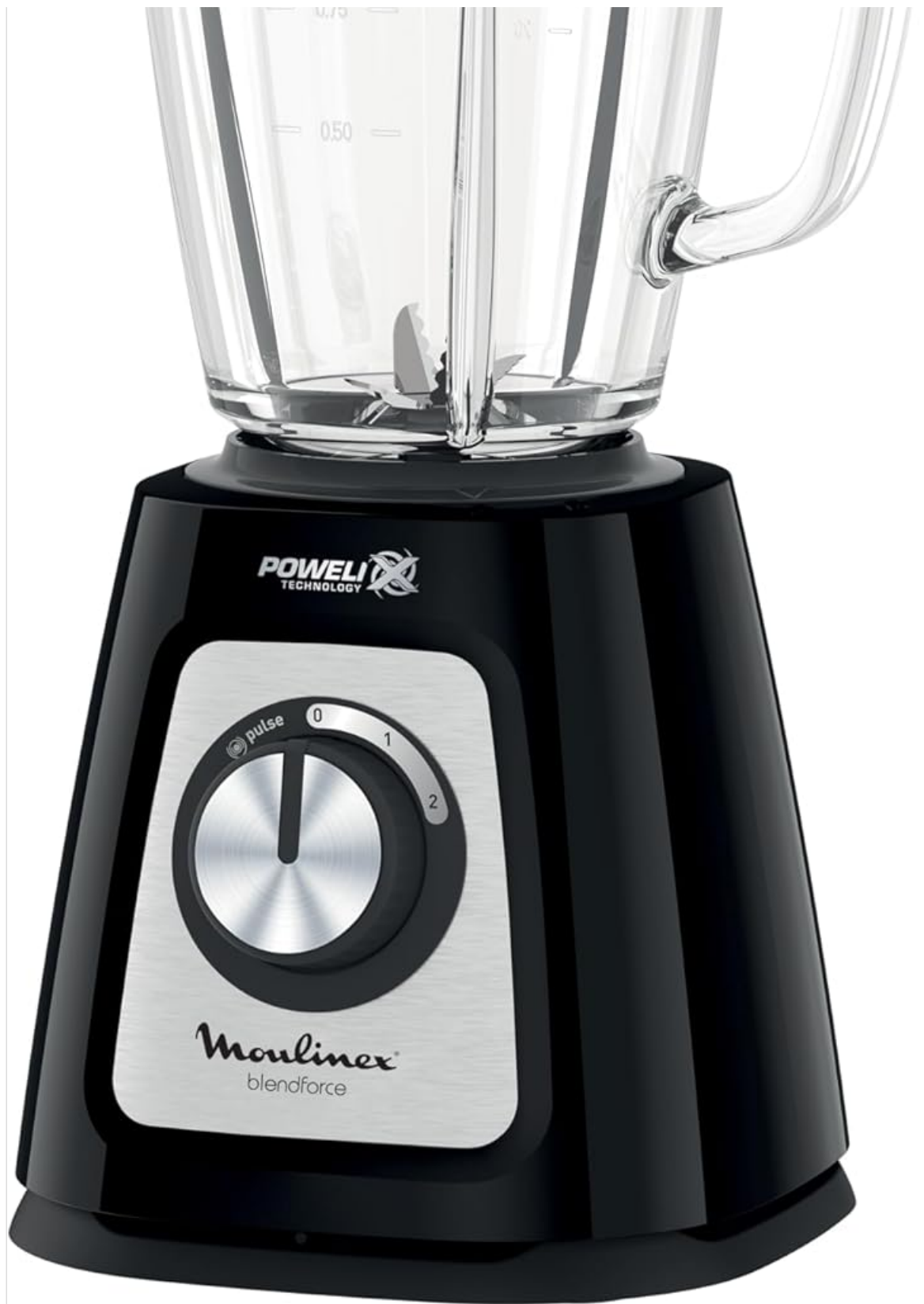
Image 4.1: Blender motor unit with control dial for speed and pulse functions.