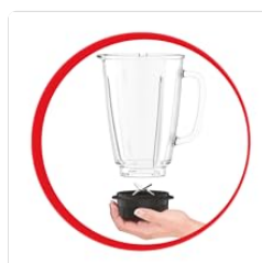
Image 5.1: Easy Clean feature for separating blades from the jar base.