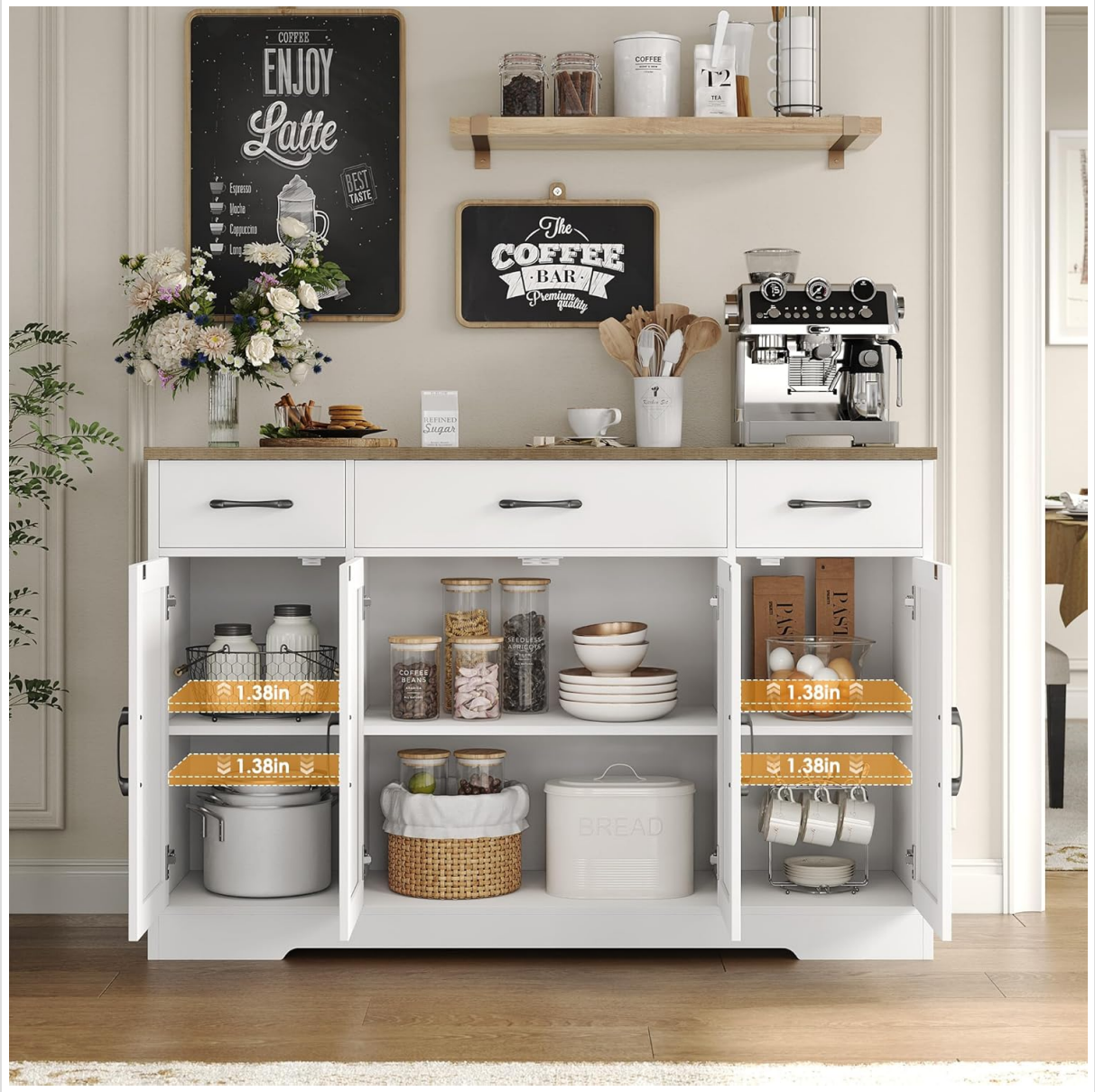
Image: Open drawers of the buffet cabinet demonstrating internal storage capacity for kitchen essentials.