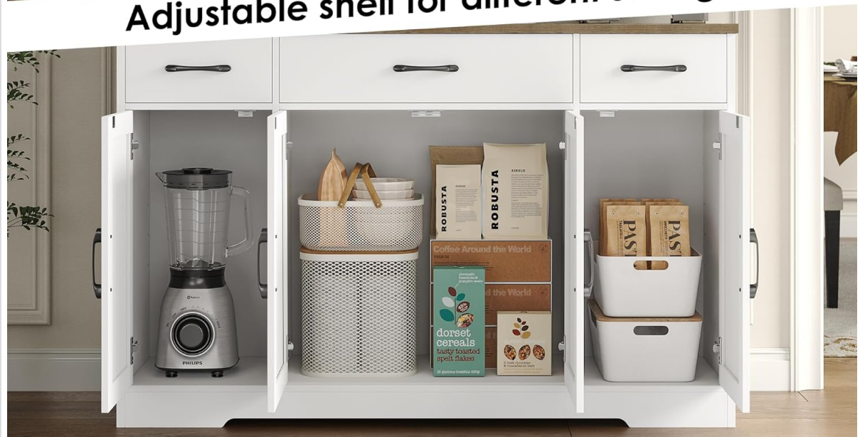
Image: The interior of the cabinet with doors open, highlighting the adjustable shelves and spacious compartments.