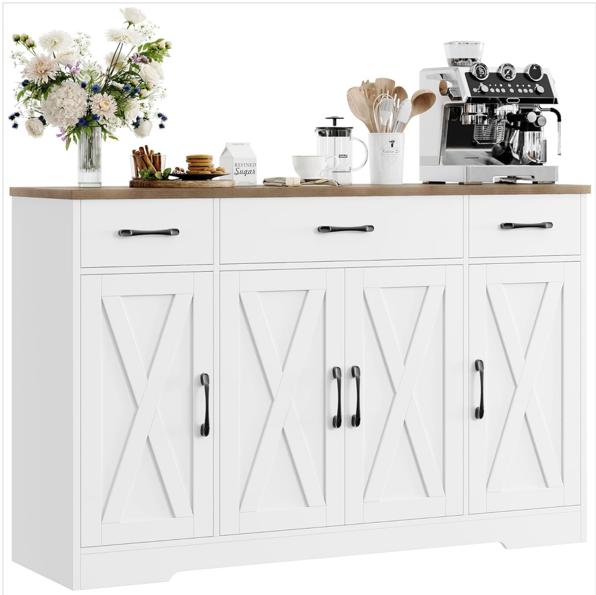
Image: The HOSTACK Buffet Cabinet, fully assembled, showcasing its design and potential use as a coffee bar station.