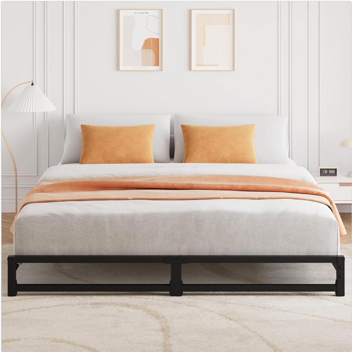
Image 4.1: The bed frame with a mattress and bedding, demonstrating its intended use.