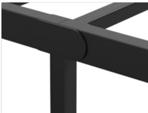
Image 3.3: Slat connection detail, showing how slats are secured to the frame.