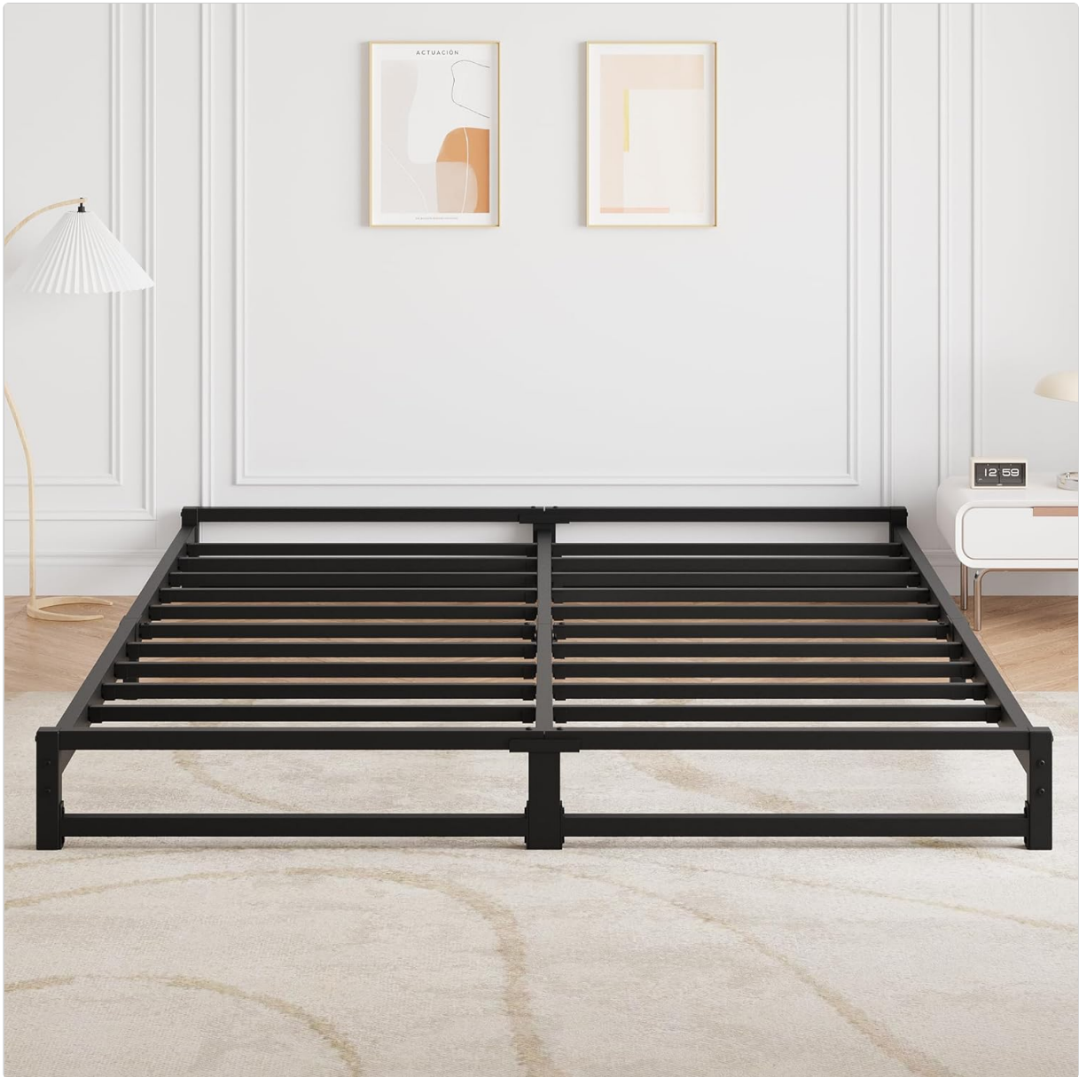
Image 1.1: Fully assembled GAOMON Queen Size Metal Platform Bed Frame.