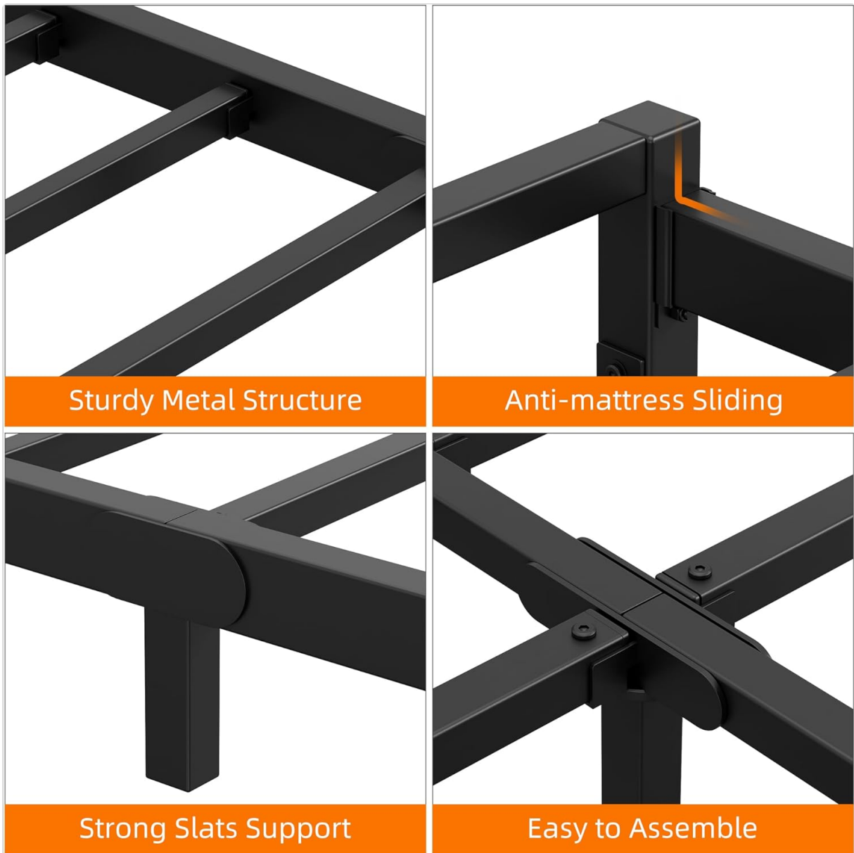
Image 3.1: Detailed views of the bed frame's structural components, highlighting sturdy metal, anti-slip design, slat support, and assembly points.