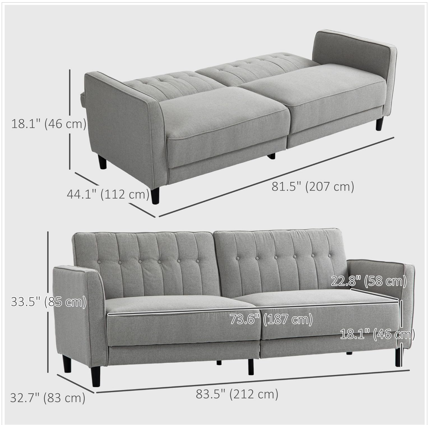
Figure 1: Product dimensions in both sofa and bed configurations. Sofa: 83.5" W x 32.7" D x 33.5" H. Bed: 81.5" L x 44.1" W x 18.1" H.