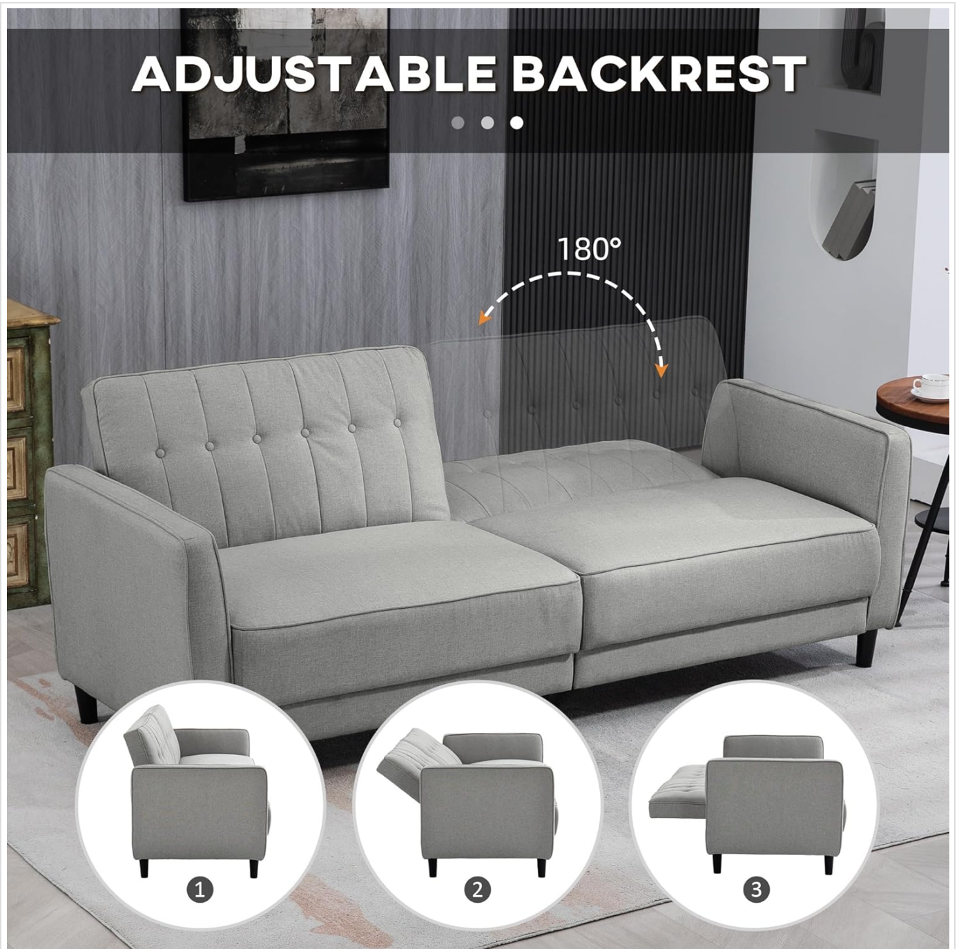
Figure 3: Visual guide demonstrating the adjustable backrest, from upright to fully reclined (180 degrees).