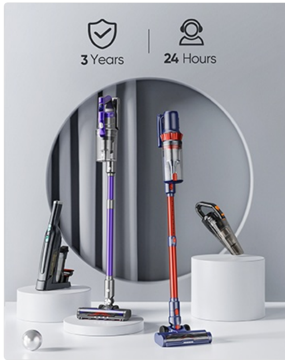
Image: Visual representation of HONITURE's commitment to a 3-year warranty and 24-hour customer support.

© 2024 HONITURE. All rights reserved. Specifications are subject to change without notice.