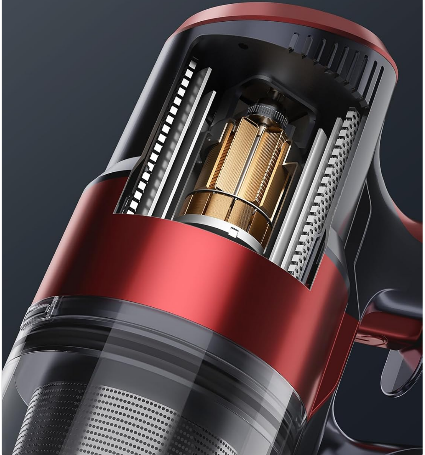
Image: A detailed view of the 450W brushless motor, showcasing the core technology of the vacuum cleaner.

I nostri motori più veloci ed efficienti dal punto di vista energetico