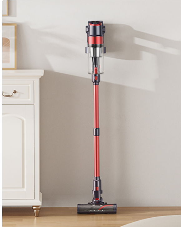
Image: The HONITURE S13 Pro vacuum cleaner fully assembled and standing, ready for use or storage.