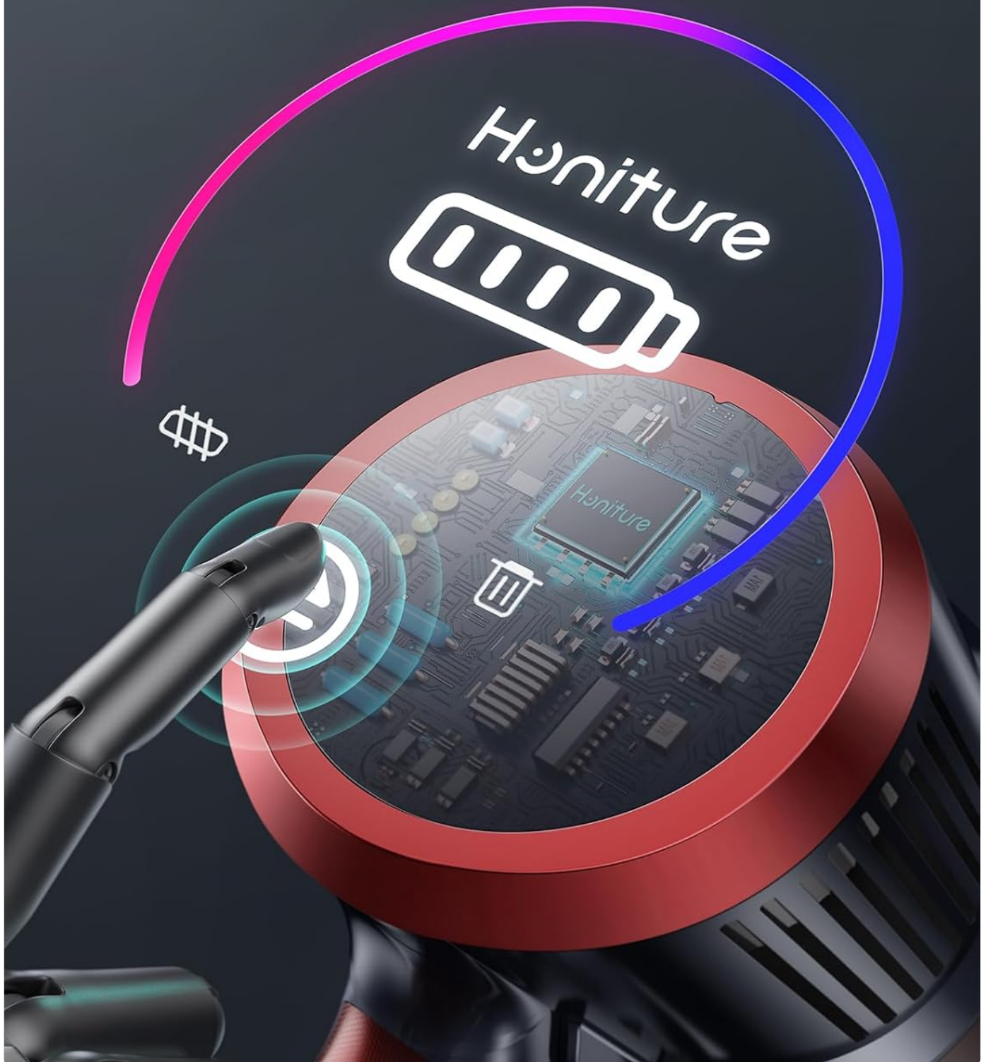
Image: The intelligent LED touchscreen display, providing real-time information on battery level and current operating mode.