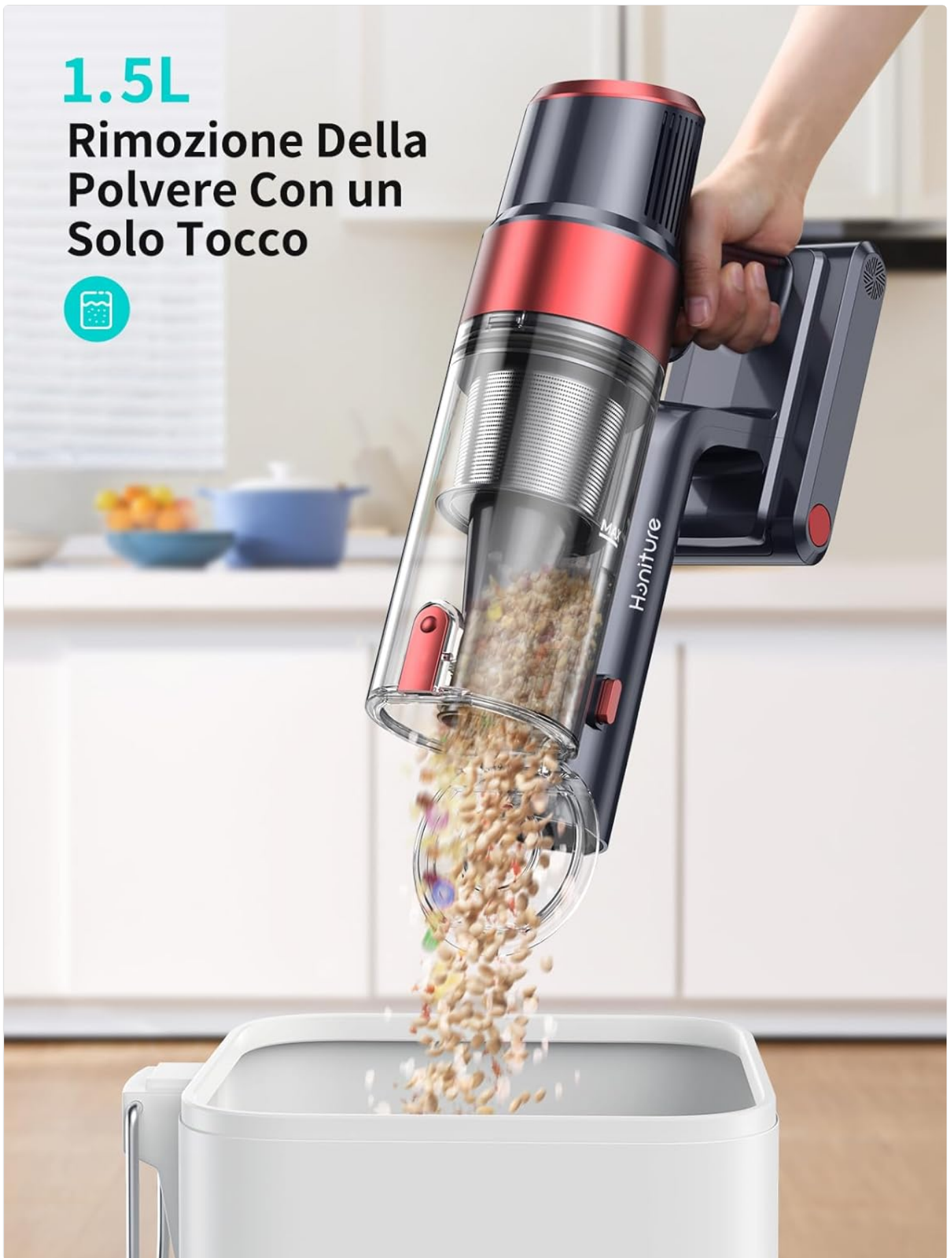
Image: Demonstrating the convenient one-touch dust removal feature, emptying the 1.5L dustbin into a waste receptacle.