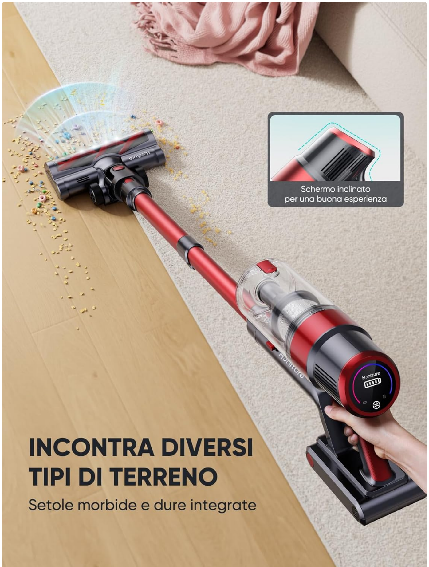
Image: The vacuum's floor brush demonstrating its ability to clean various floor types, from hard surfaces to carpets, with an inclined screen for better user experience.