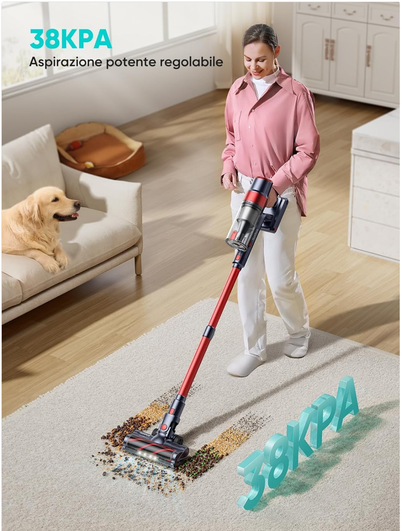
Image: The HONITURE S13 Pro vacuum cleaner effectively cleaning a carpet, highlighting its 38KPA suction capability.