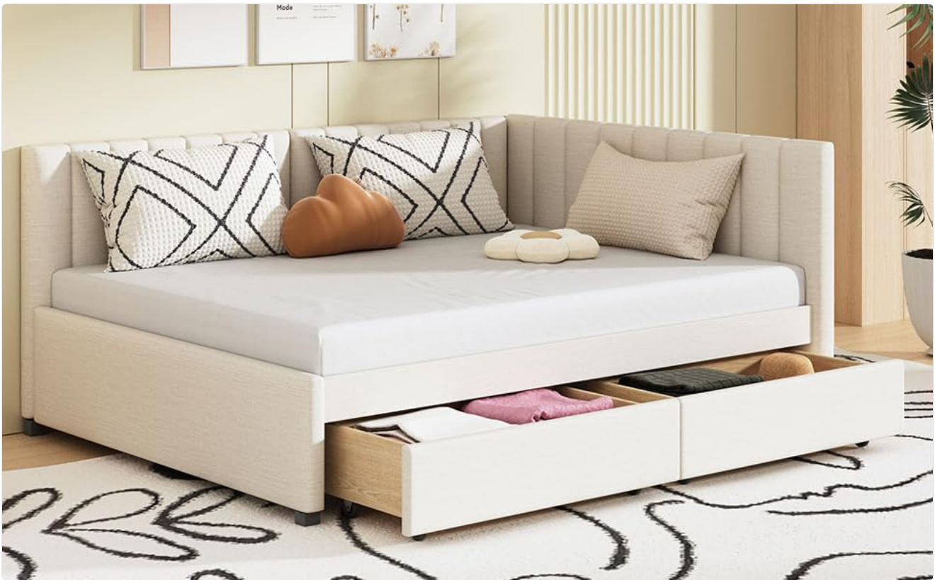
Image 4: The Merax daybed with a mattress and decorative pillows, showing the storage drawers partially open and filled with items.