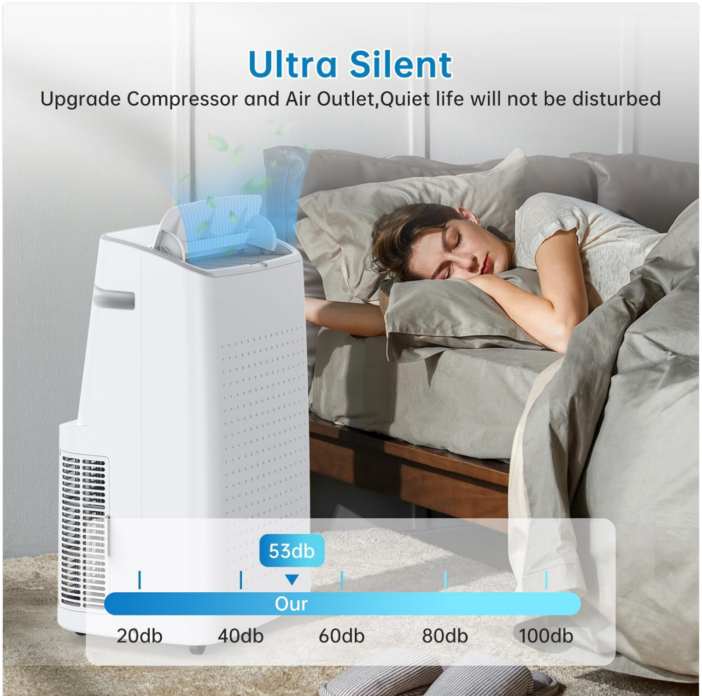
Image: Demonstrates the ultra-silent operation of the unit, showing it next to a sleeping person with a noise level indicator of 53dB.