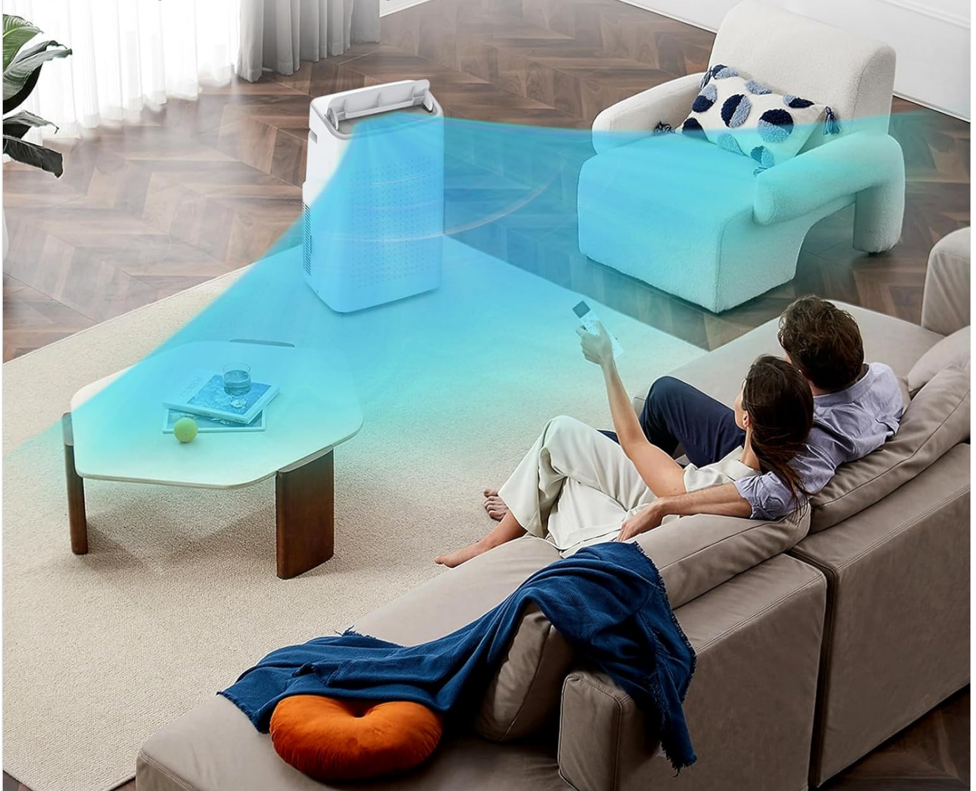
Image: Illustrates the 20-foot remote control range, showing a couple comfortably operating the unit from their couch.

Precisely Control Your Comfort From Up To 20 Feet Away From The Comfort Of Your Couch