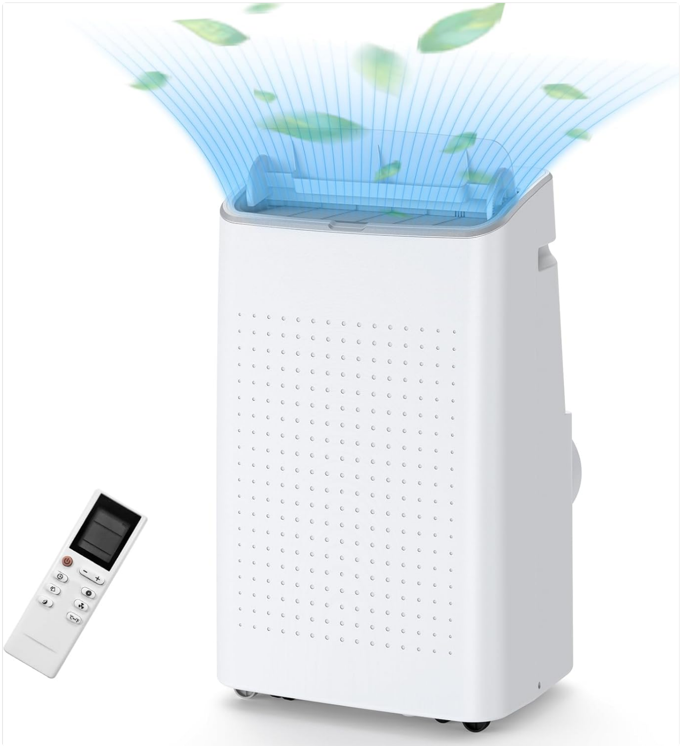
Image: The Garvee portable air conditioner unit shown with its remote control, illustrating the upward airflow.