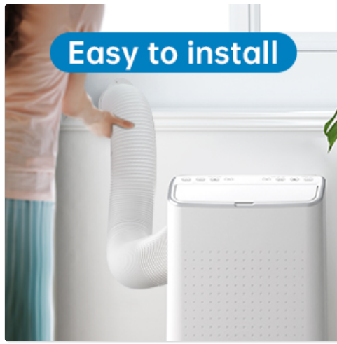
Image: A person connecting the flexible exhaust hose to the window kit, illustrating the ease of installation.