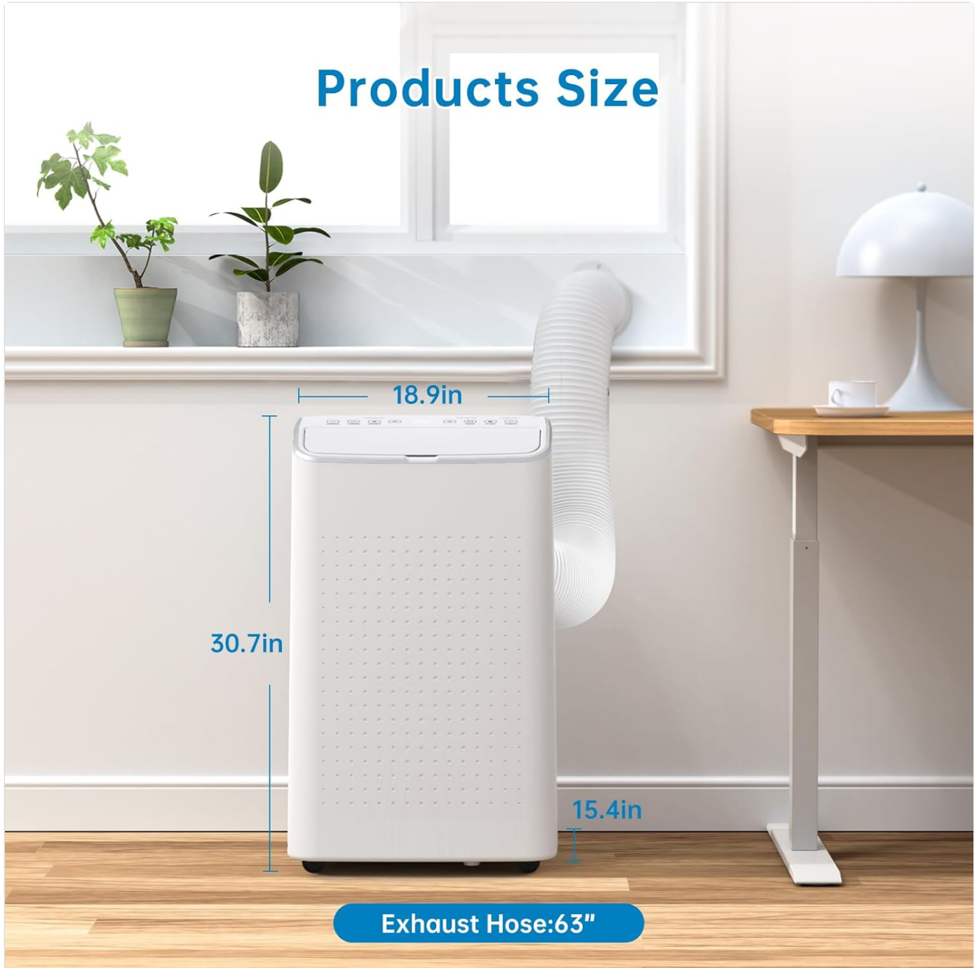
Image: Diagram showing the product dimensions: 30.7 inches (height), 15.4 inches (width), and 18.9 inches (depth), with an exhaust hose length of 63 inches.