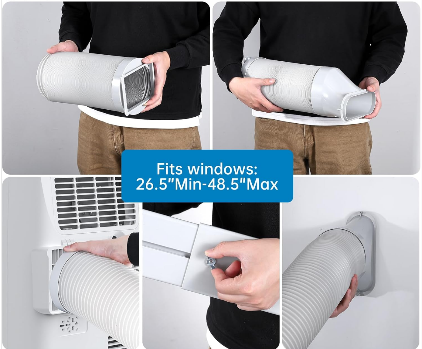
Image: Visual guide demonstrating the assembly of the exhaust hose and window adapter, and its installation into a window. The window kit fits windows from 26.5" to 48.5".