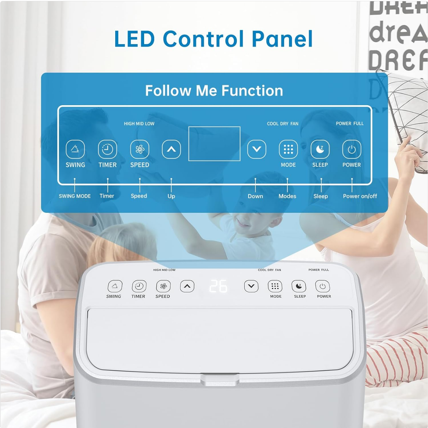
Image: A detailed view of the LED control panel on the unit and the remote control, showing various buttons for swing, timer, speed, temperature adjustment, modes, sleep, and power.