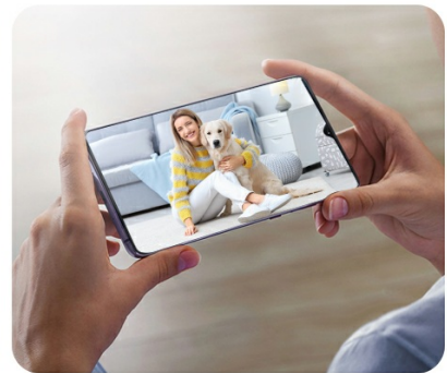
Step 3 Now you're ready to see