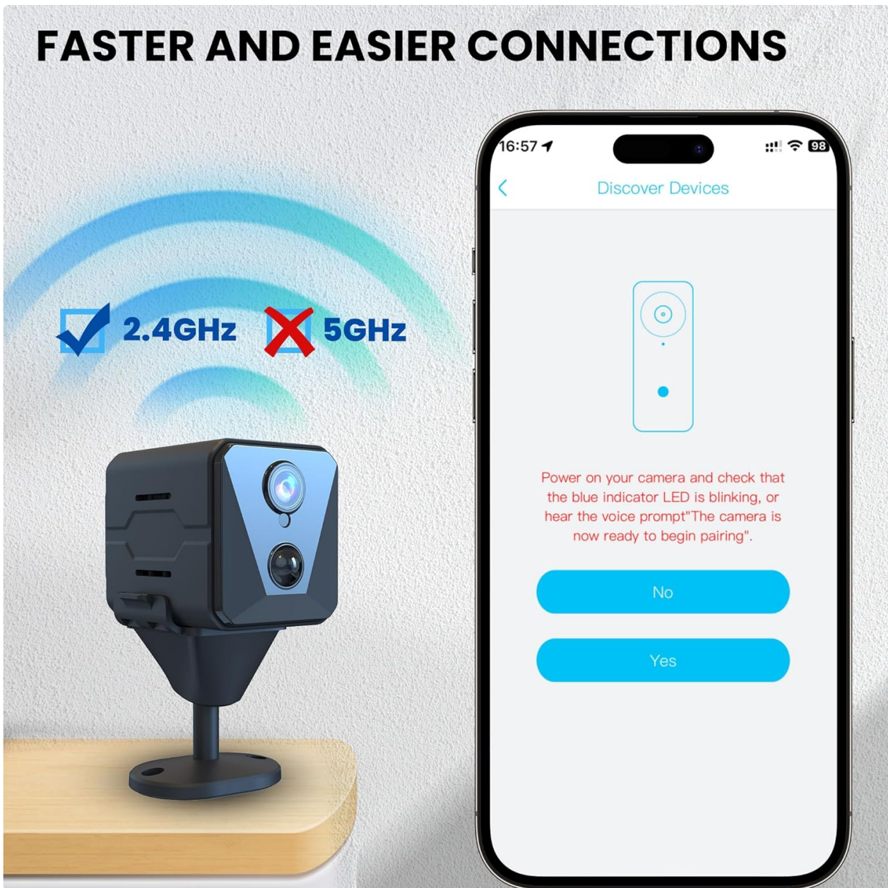
Figure 4: The camera supports 2.4GHz Wi-Fi for stable connections.