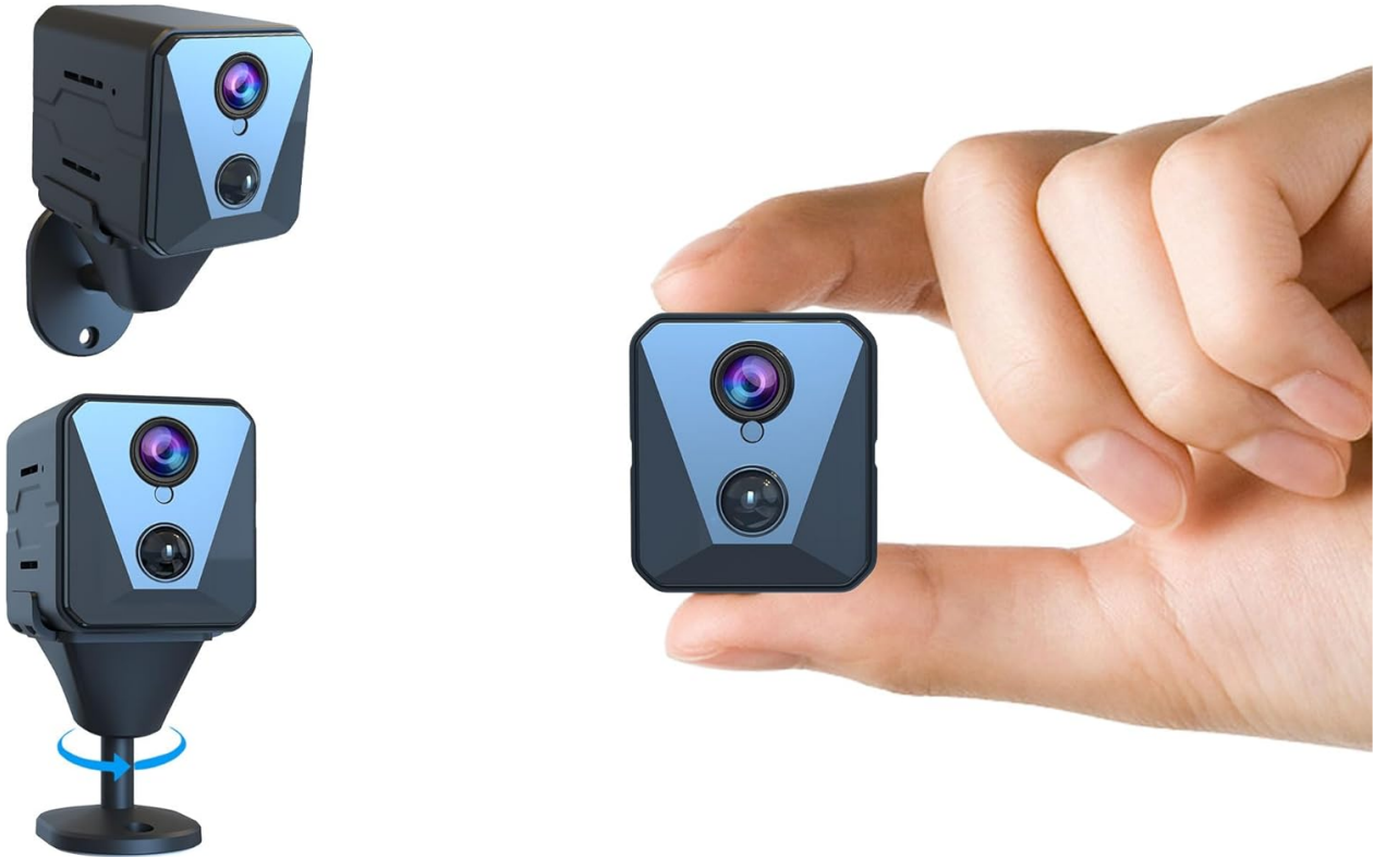
Figure 1: Funstorm 4K HD Mini Nanny Cam and its compact size.