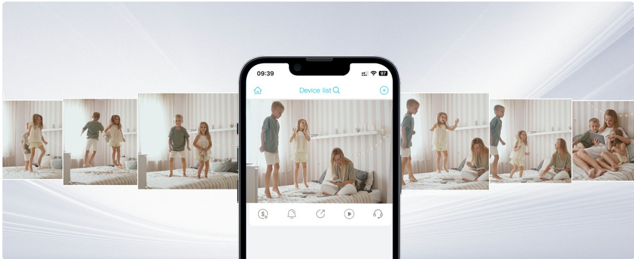
Figure 10: The app displays a log of detected activities for easy review.