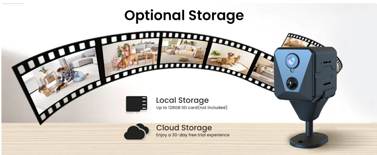
Figure 11: Choose between local SD card storage or cloud storage for your recordings.

The camera offers flexible storage solutions. You can utilize local storage with a Micro SD card (up to 128GB) for continuous recording, or opt for cloud storage with a 30-day free trial for convenient access to your footage from anywhere.