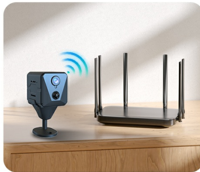
Step 2 Fully charge and follow the steps to connect to Wi-Fi(Only 2.4G).