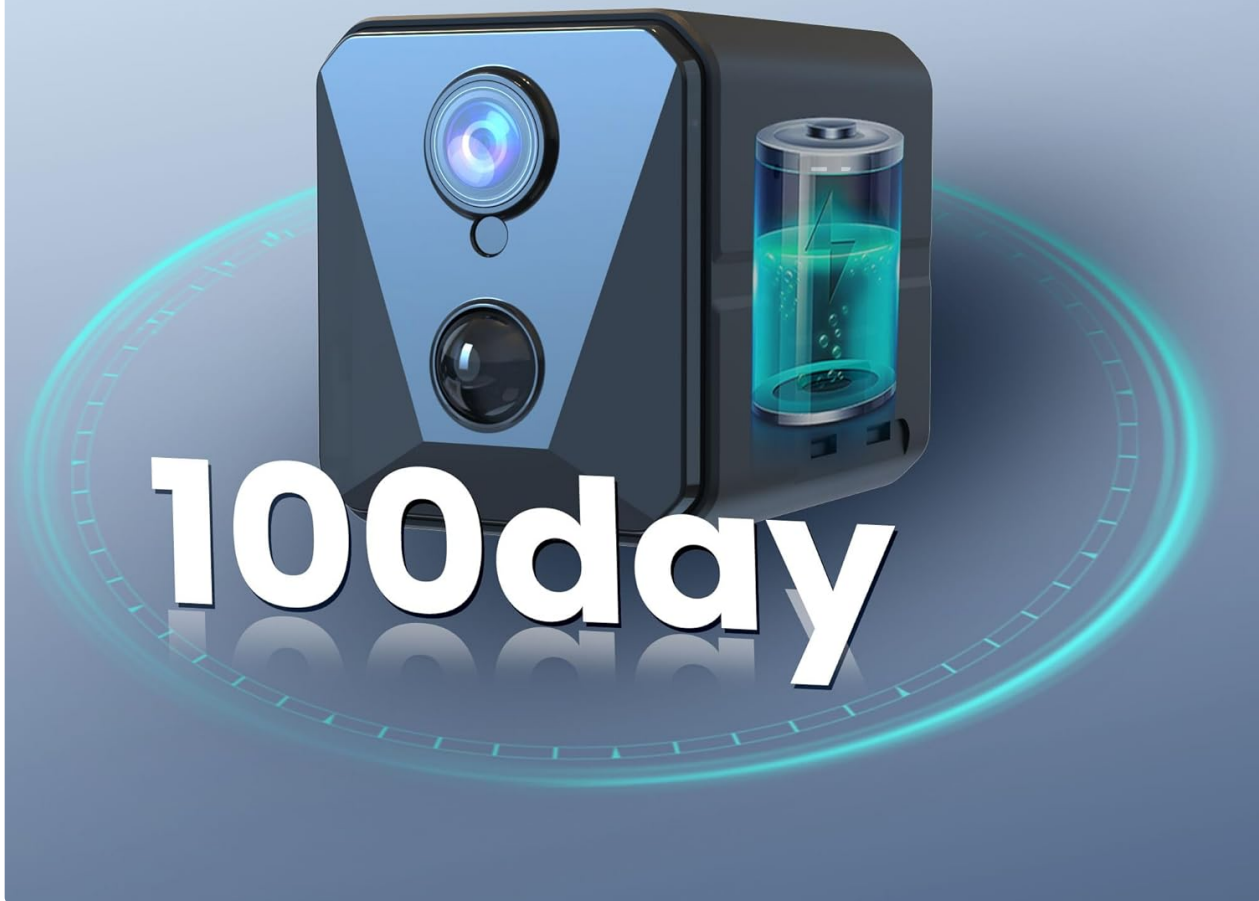
Figure 8: The camera boasts an impressive 100-day battery life.