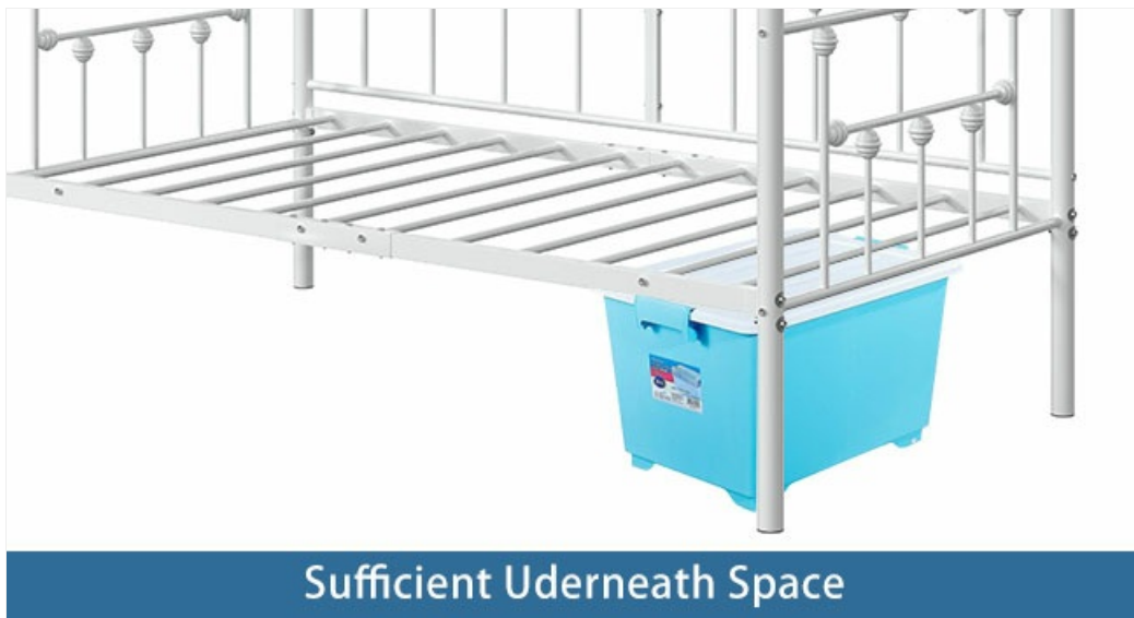
Figure 4.2: Ample 12.6-inch Under-Bed Clearance for Storage.