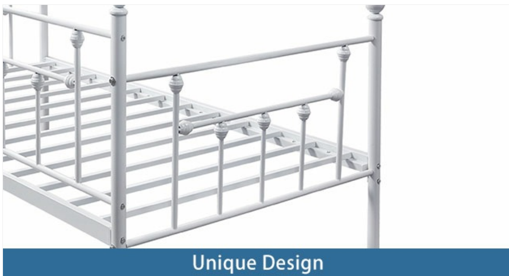
Figure 6.1: Mattress Compatibility and Anti-Slip Guardrail Feature.