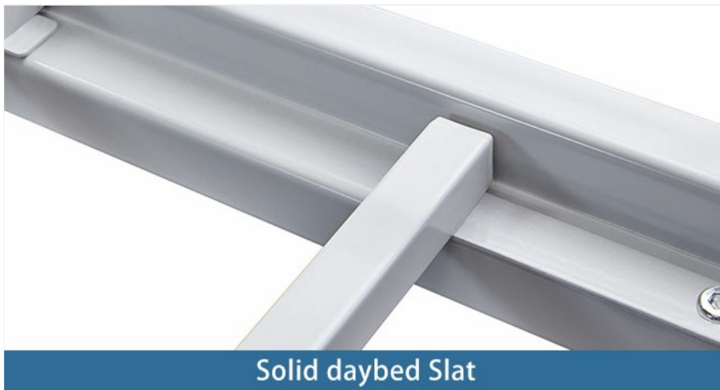
Figure 5.1: Solid Daybed Slats for Mattress Support.