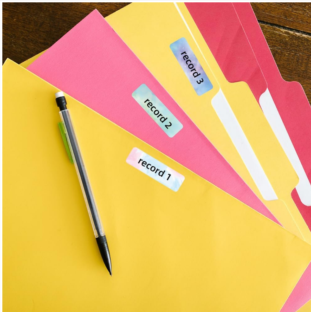
Figure 4: A collection of colorful file folders (yellow, pink, blue) with white labels reading 'record 1', 'record 2', and 'record 3', created using the Phomemo D30 label maker, alongside a pen.