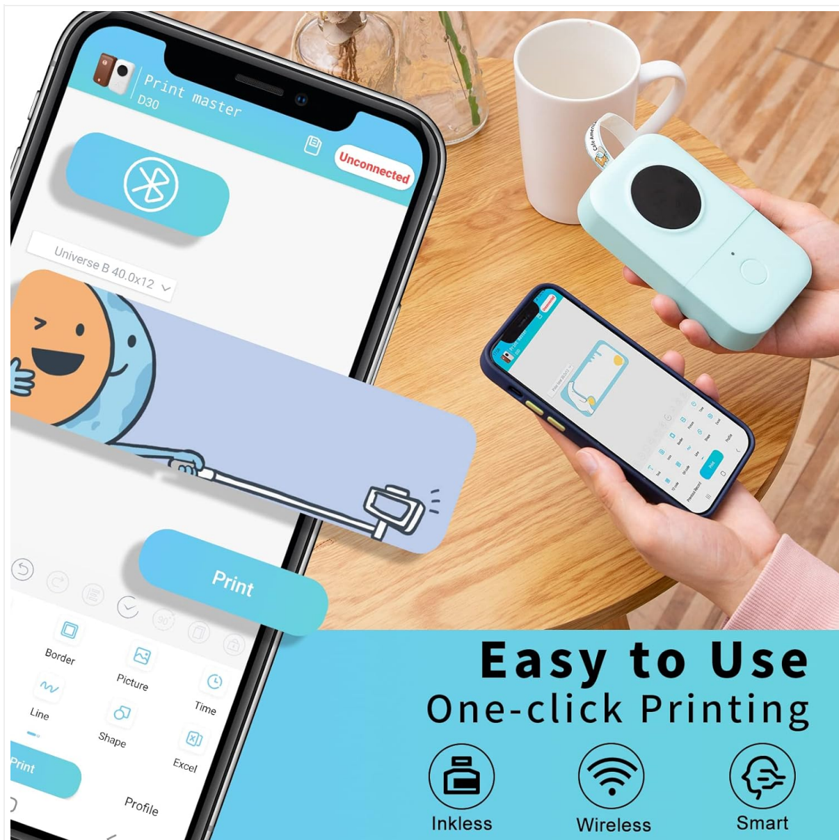
Figure 1: The Phomemo D30 app interface on a smartphone, displaying connection status and various label design options. The label maker is shown next to the phone.

Your browser does not support the video tag.