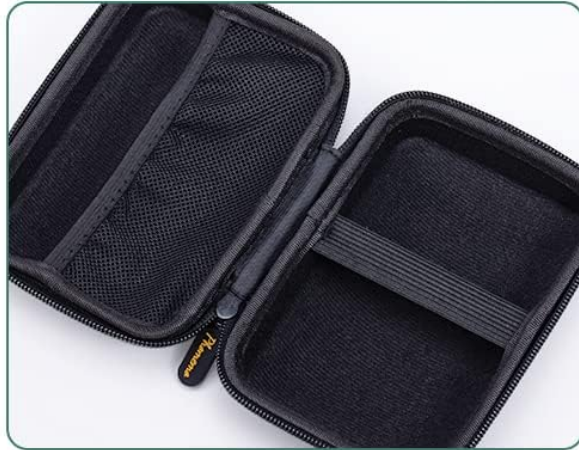
Figure 7: The Phomemo D30 case featuring a carabiner for easy attachment and an internal elastic band designed to securely hold the label maker in place, ensuring stable protection.