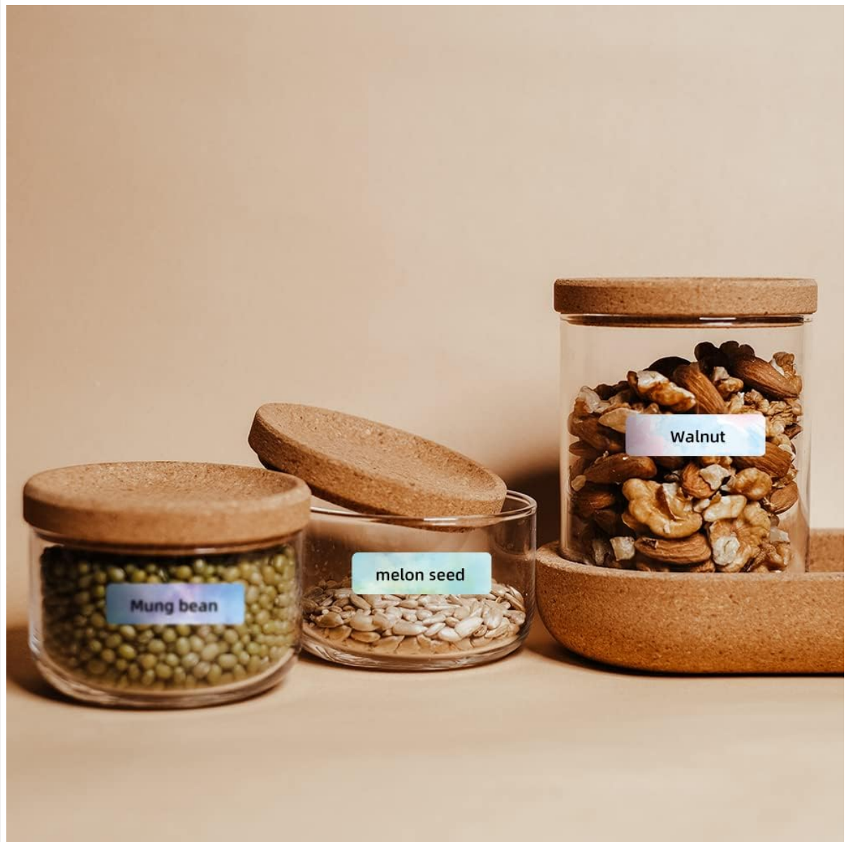
Figure 3: Three transparent glass jars containing mung beans, melon seeds, and walnuts, each clearly identified with a custom-printed label from the Phomemo D30 label maker.