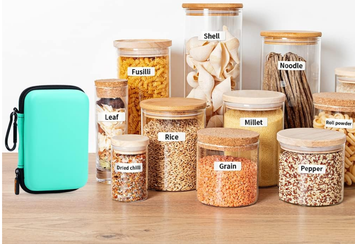
Figure 5: The Phomemo D30 label maker and its protective case are shown on a wooden table, surrounded by several glass jars containing various food items, all neatly labeled for kitchen storage.